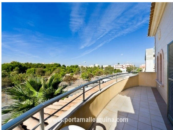
Great views from the terrace