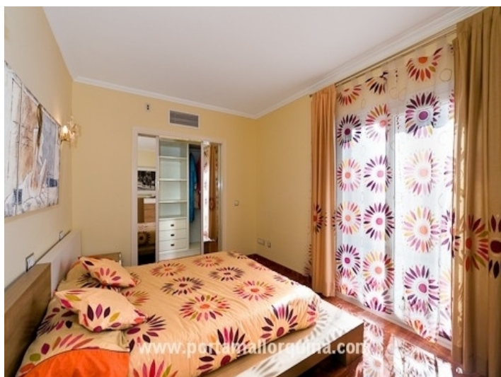
Bedroom with panoramic windows