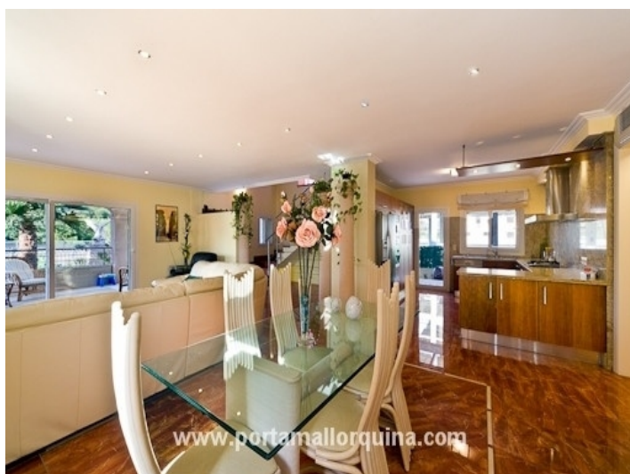
Elegant dining area