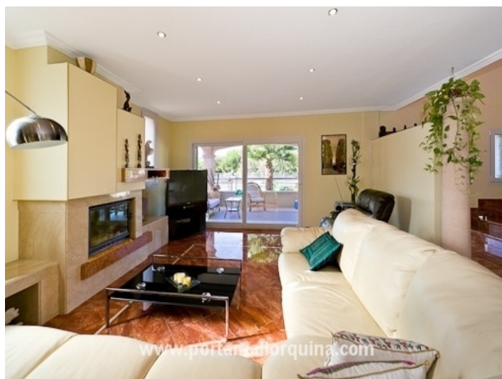
Fantastic living area