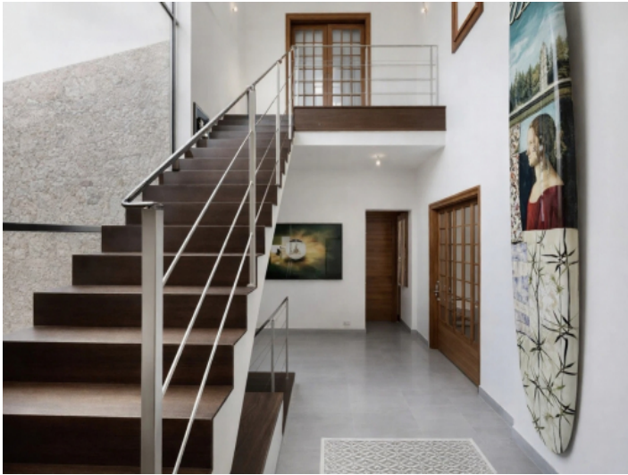
Staircase and gallery