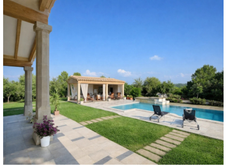
Pool house and swimming pool