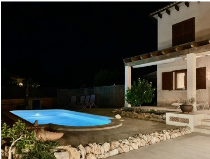
Pool area by night