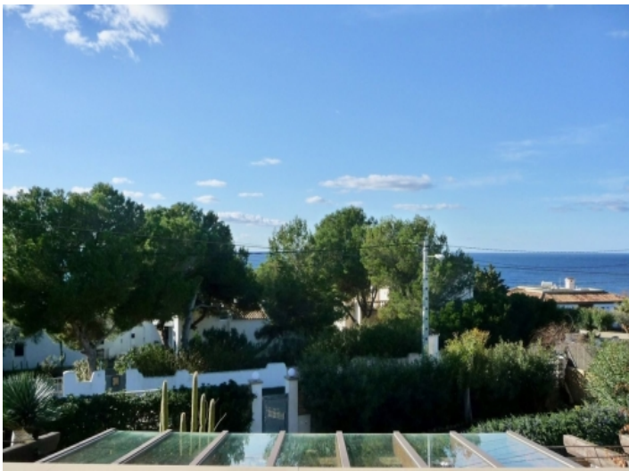
Beautiful sea views