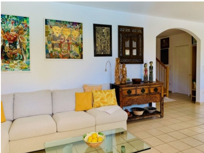
Spacious living area