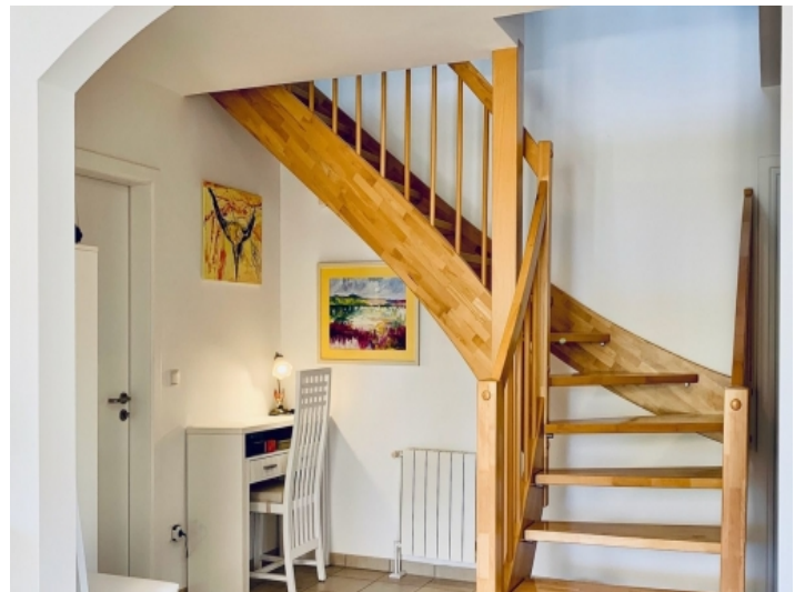
Access upper floor