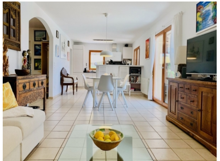
Bright living and dining area