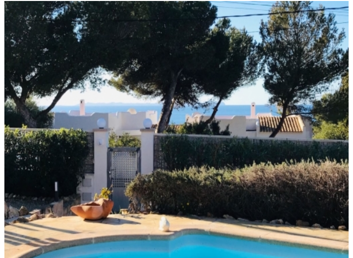
Pool and sea views