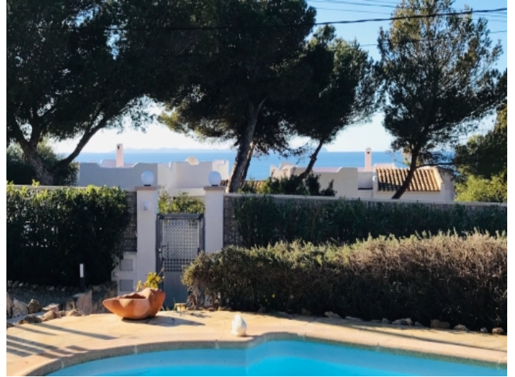
Pool and sea views