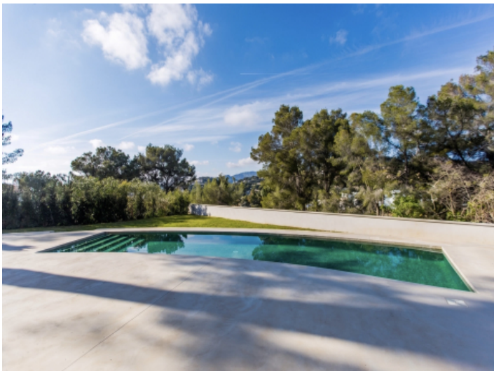
Spacious outdoor area