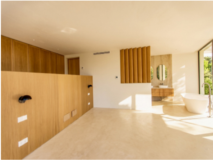
Bedroom with en-suite bathroom