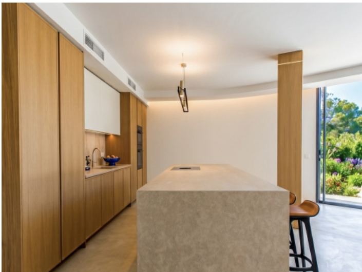
Open kitchen with kitchen island