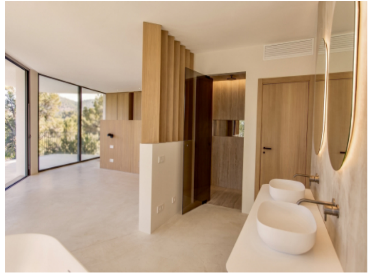
Bedroom with en-suite bathroom