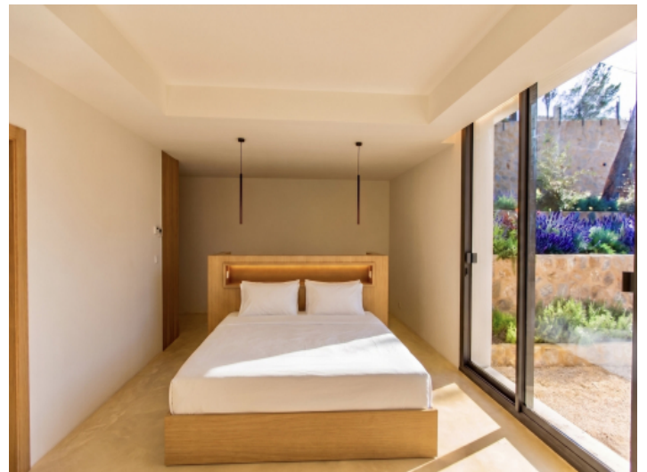
Bedroom with garden access