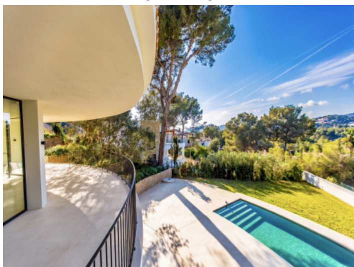
Idyllic green view