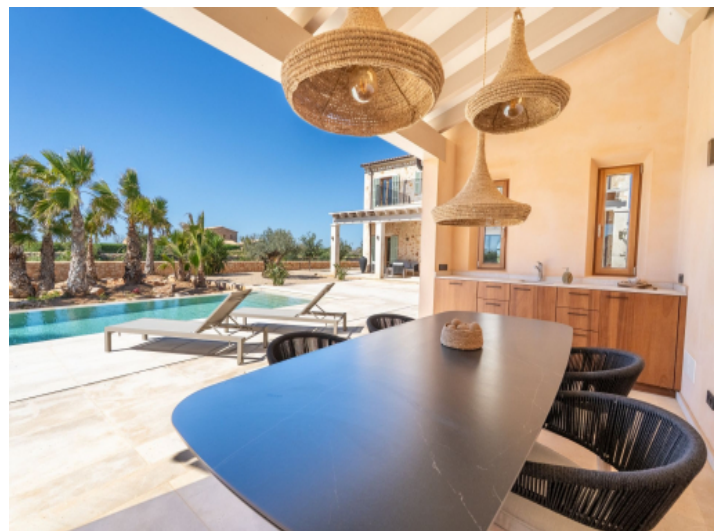
Elegant pool house