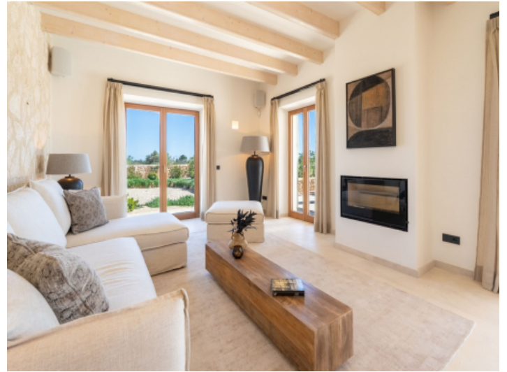
Living room with fireplace