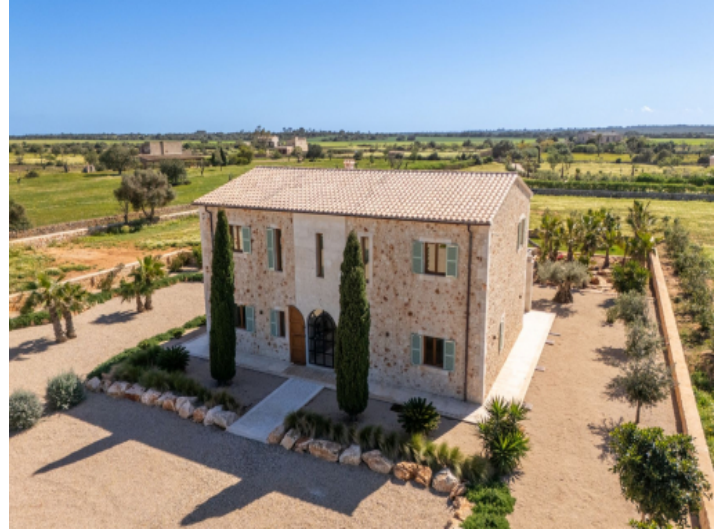
lEstate with natural stone façade