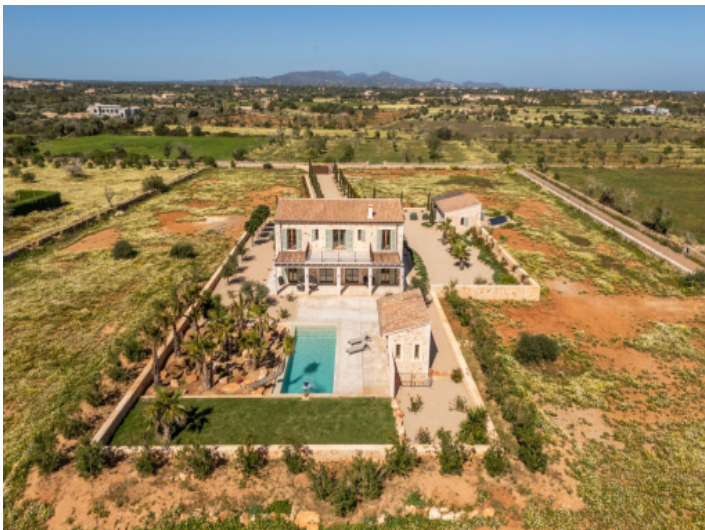
Finca with privacy and lots of land