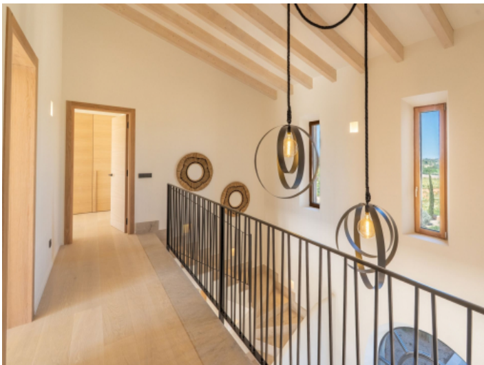
Staircase leading to the sleeping quarters