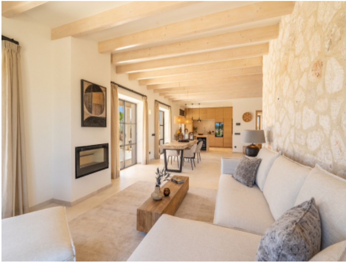
Living and dining area with wooden beam ceilings