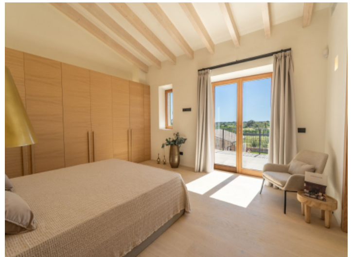
Bright bedroom filled with natural light