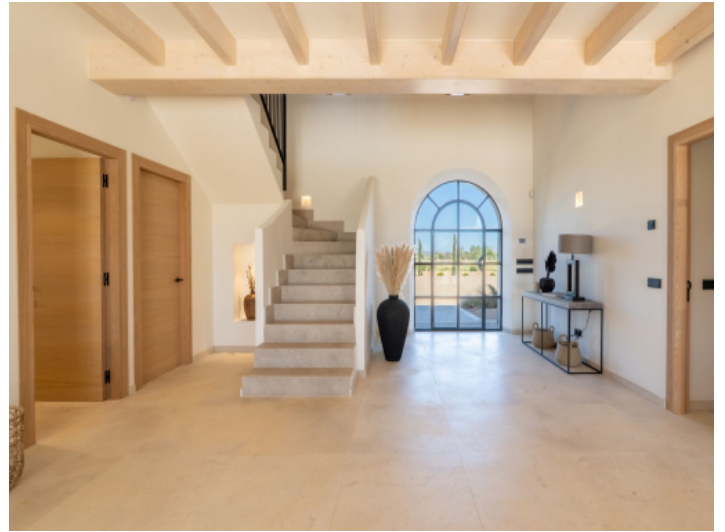
Bright entrance area