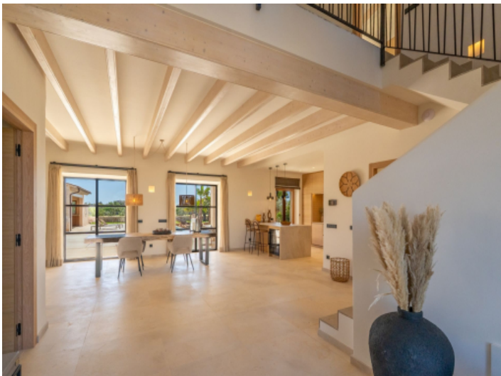
Mediterranean living space