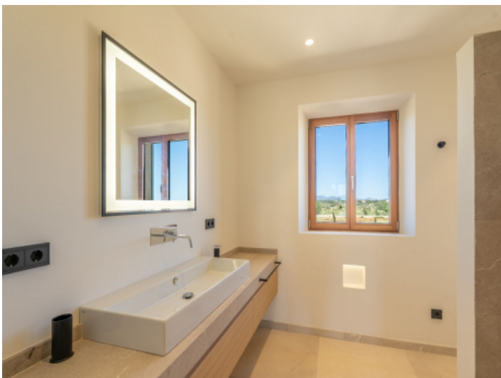
En-suite bathroom with daylight