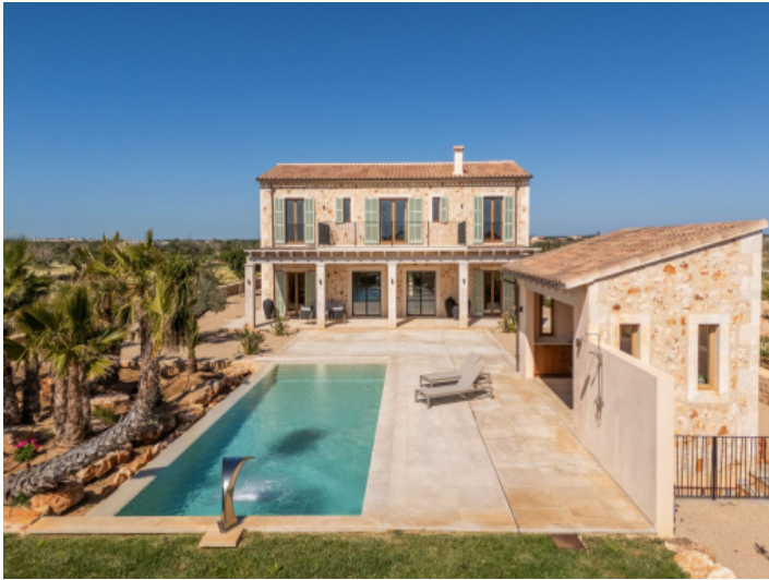
Luxury finca with pool house