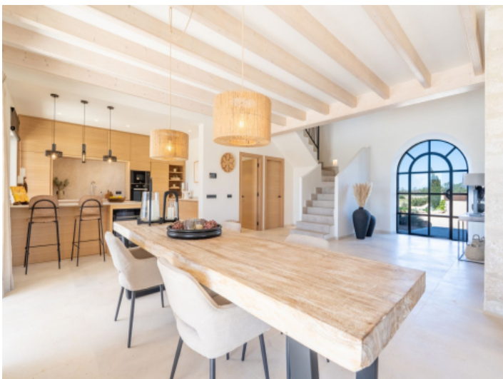
Stylish dining area