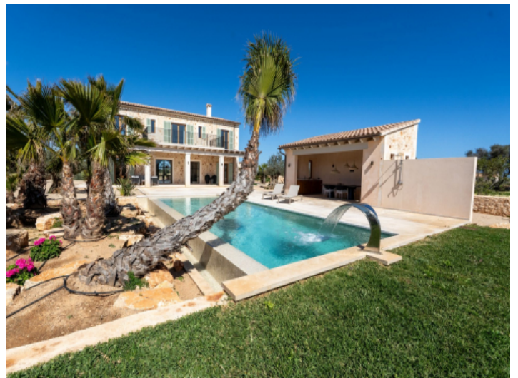
Beautiful landscaped outdoor area