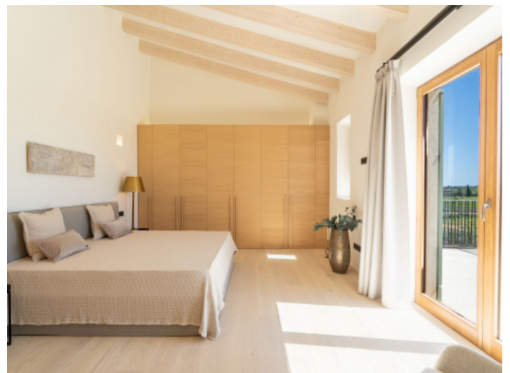
Bedroom with private terrace