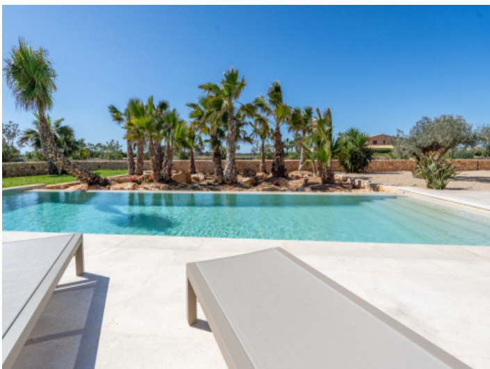
Pool surrounded by palm trees