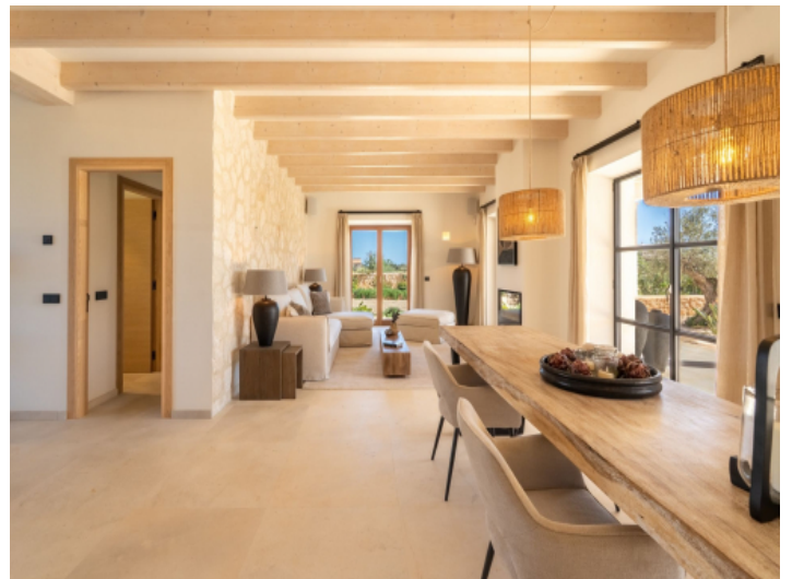
Cozy living and dining area