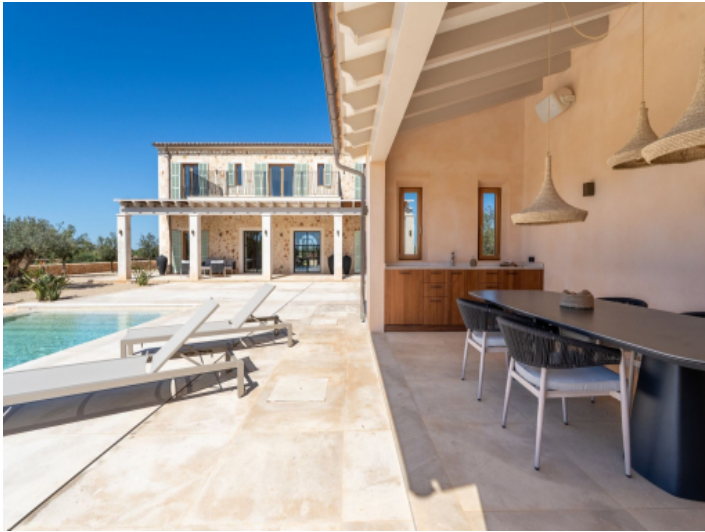
Beautiful outdoor terraces