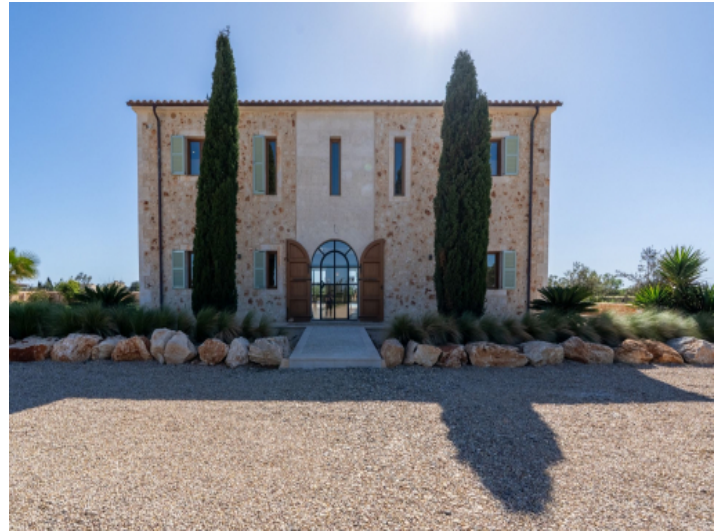
Luxury finca surrounded by nature