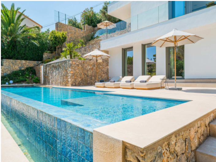
Heated infinity pool