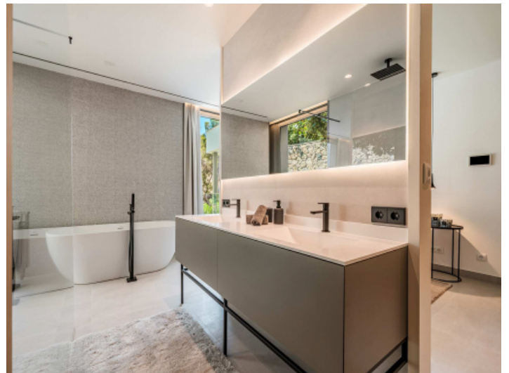
One of the five bathrooms