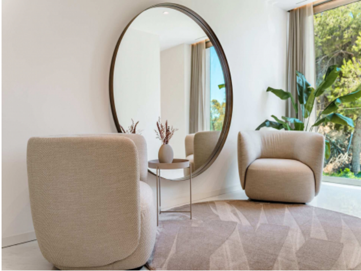
Cozy relaxation corner