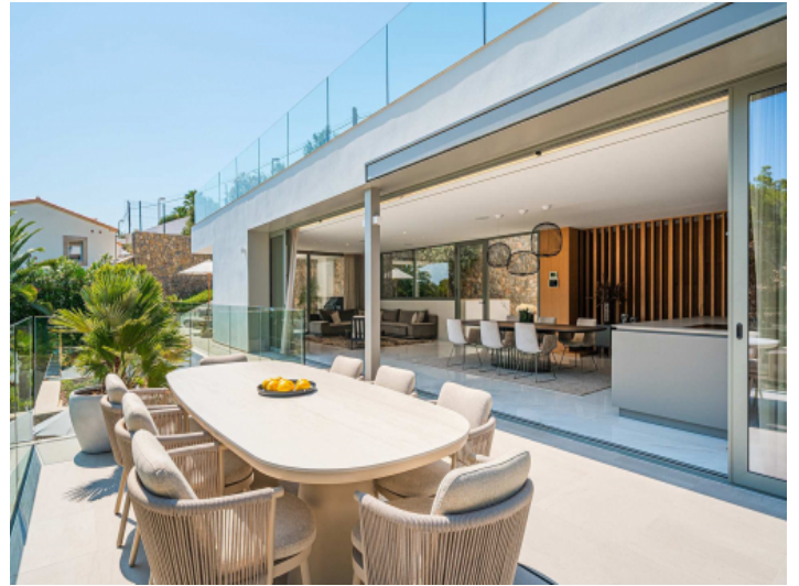
Living and dining area with direct access to the spacious