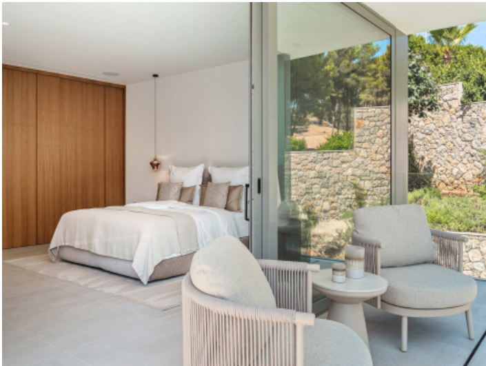
One of the four sleeping areas with direct access to the