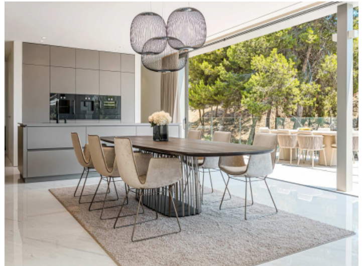
Light-filled dining area with access to the terrace