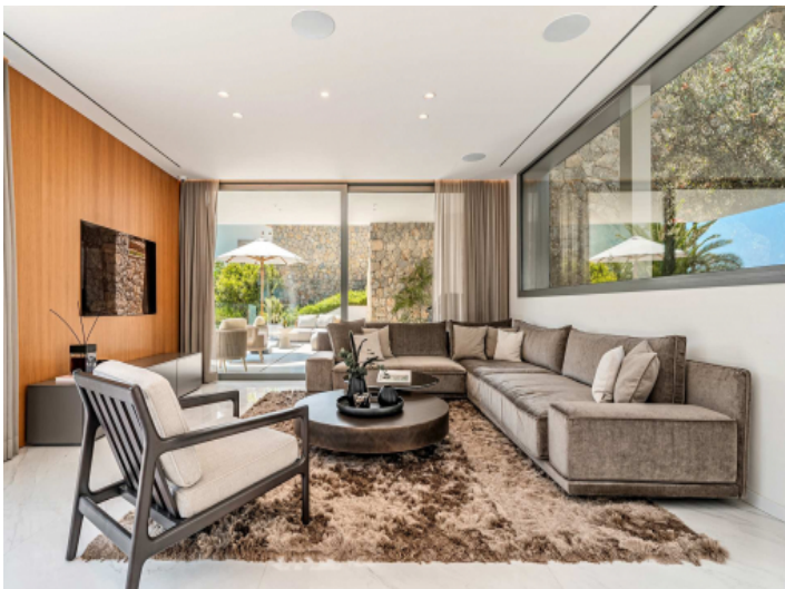
Modern living area with large window front