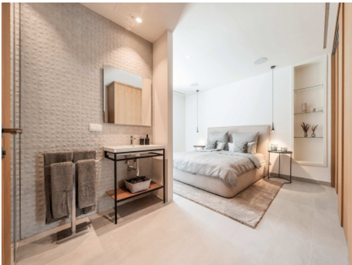
One of the four bedrooms