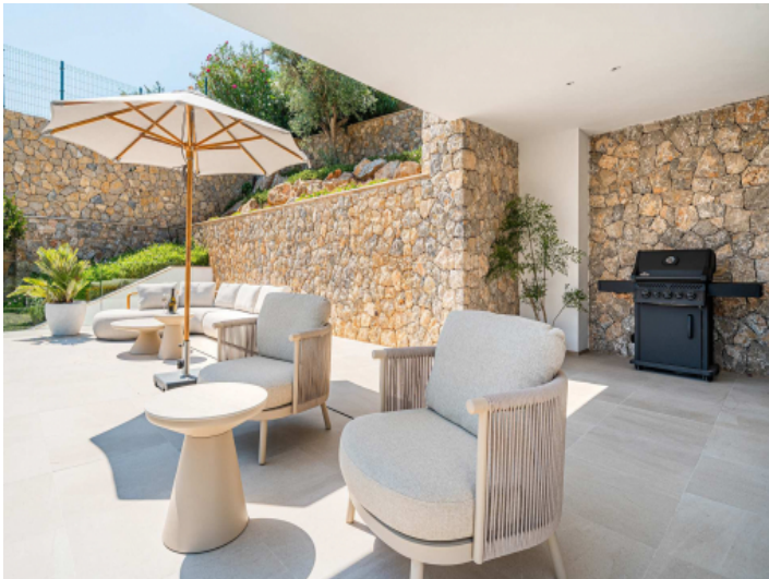
Partially covered terrace