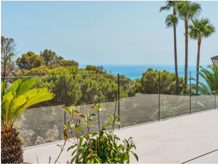
Idyllic atmosphere with partial sea view