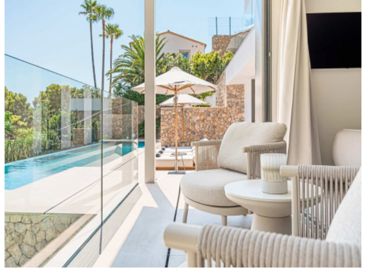
Time to enjoy