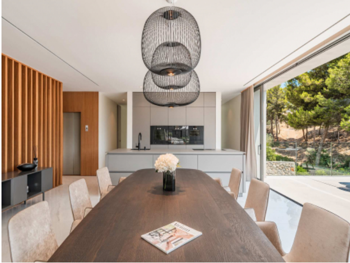
Stylish kitchen and dining area