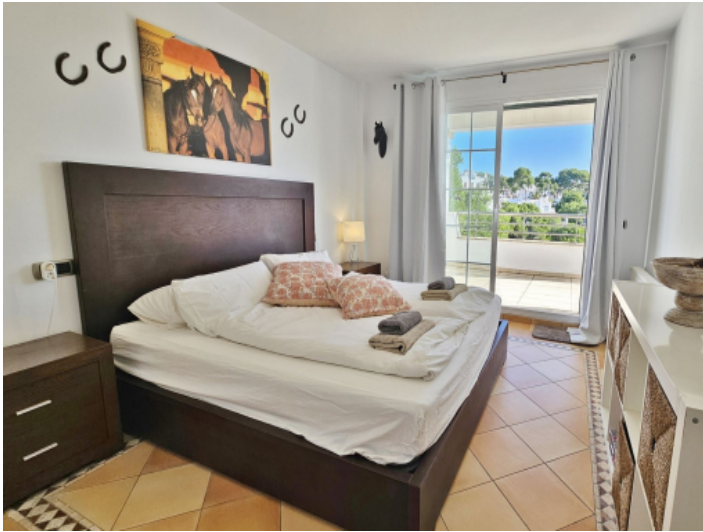
All bedrooms have access to the balcony