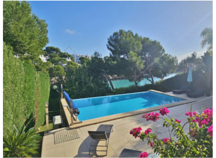
Garden and pool on the seafront