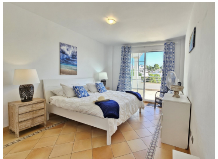
All bedrooms have access to the balcony