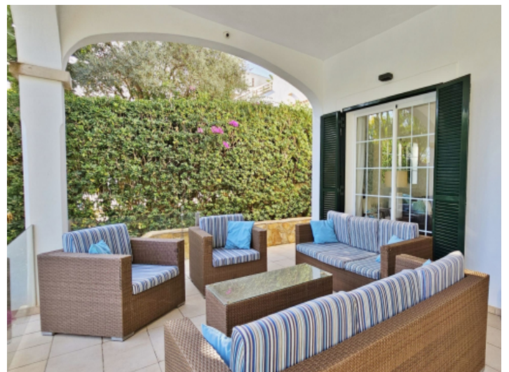
Covered terrace at the house