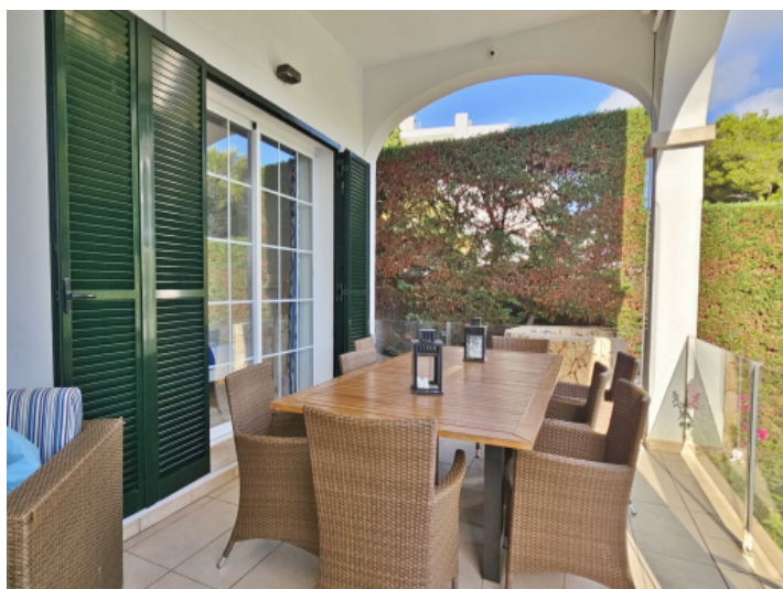
Covered terrace at the house