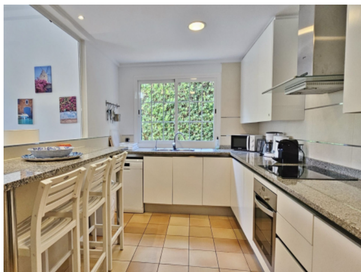
Kitchen with opening to the living area