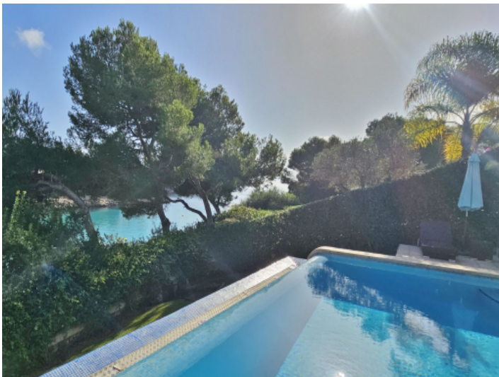
Garden and pool on the seafront