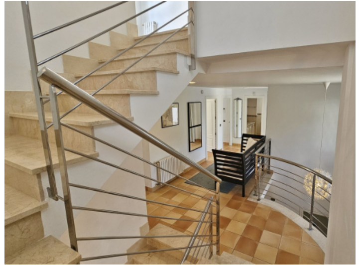
Staircase over three floors