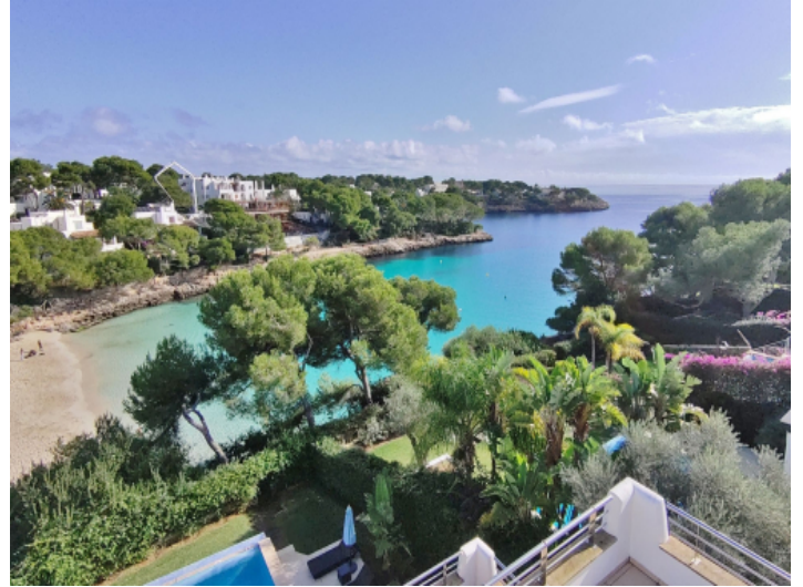
Cala Gran is just a few meters away