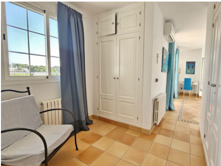
Bedroom on the third floor with balcony and bathroom