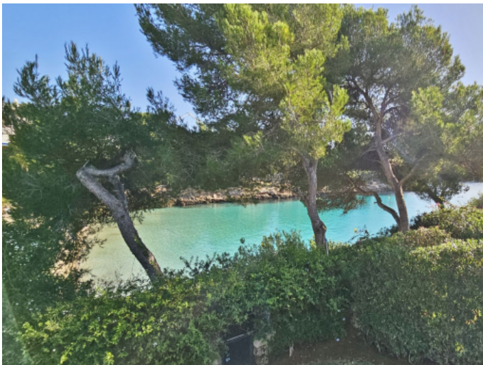
Cala Gran is just a few meters away