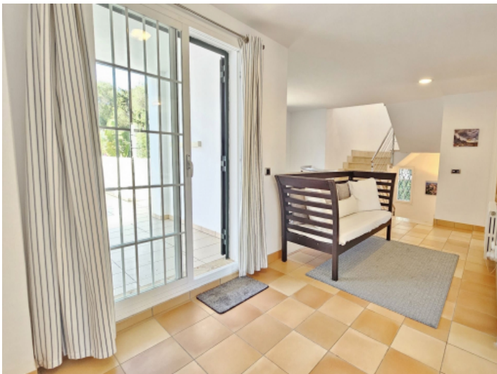
Staircase over three floors