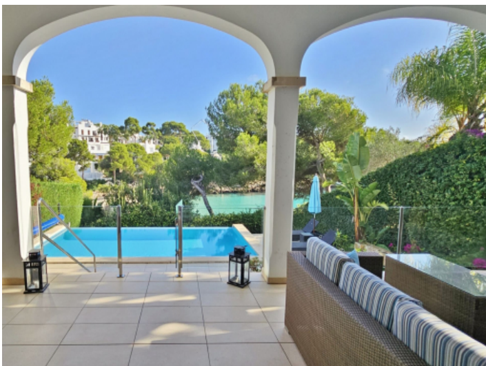
Sea view from the terrace