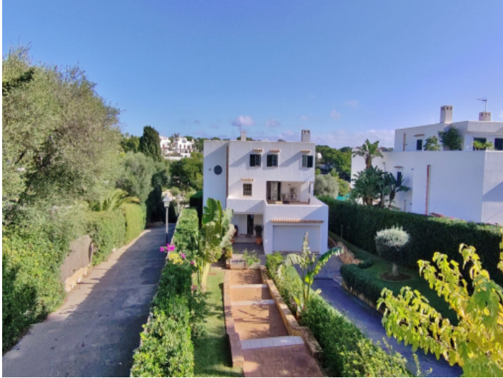
View from the street side