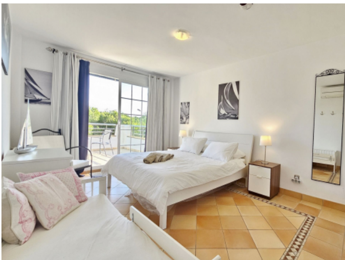
All bedrooms have access to the balcony