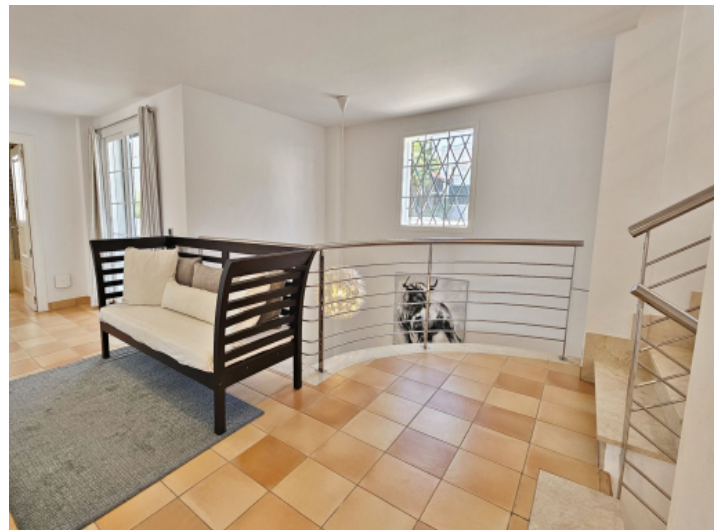
Staircase over three floors