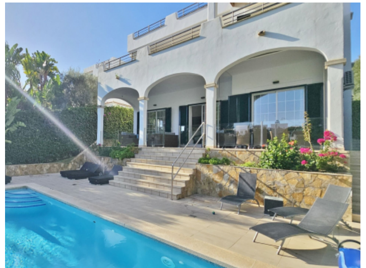
Covered terrace and sun terrace