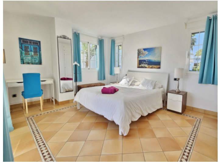
Bedroom on the third floor with balcony and bathroom