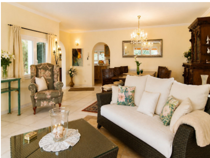
Living and dining area with fireplace