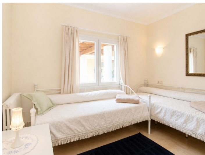
Third bedroom on the ground floor