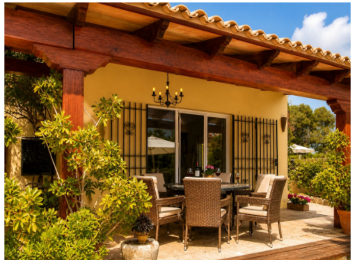
Covered terraces directly attached to the house