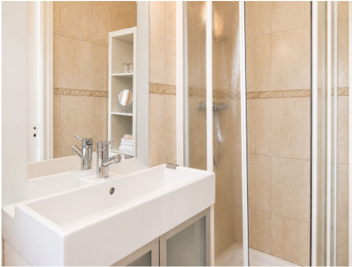
Bathroom with shower on the upper floor