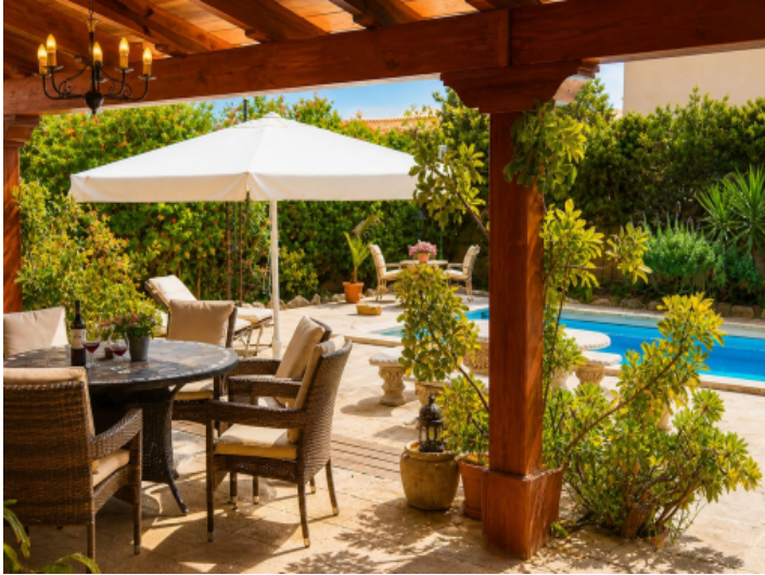
Covered terraces directly attached to the house