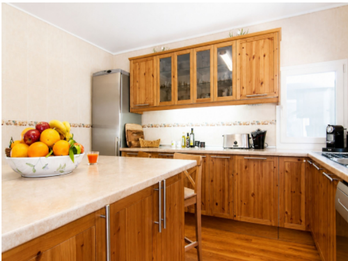
Large and modern kitchen