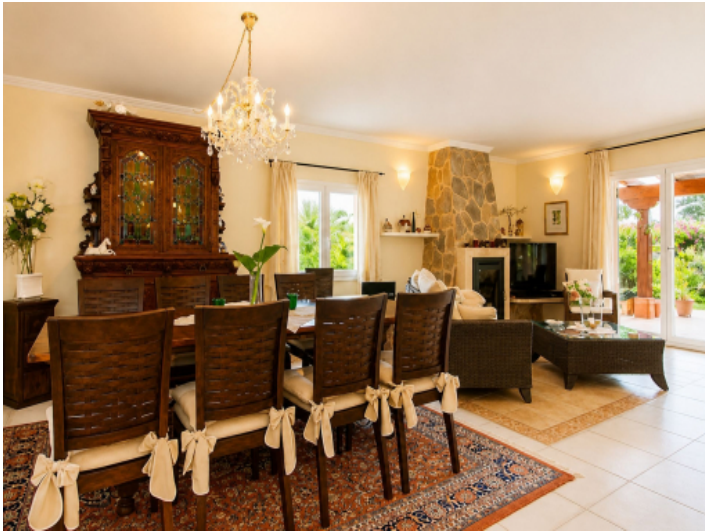
Living and dining area with fireplace