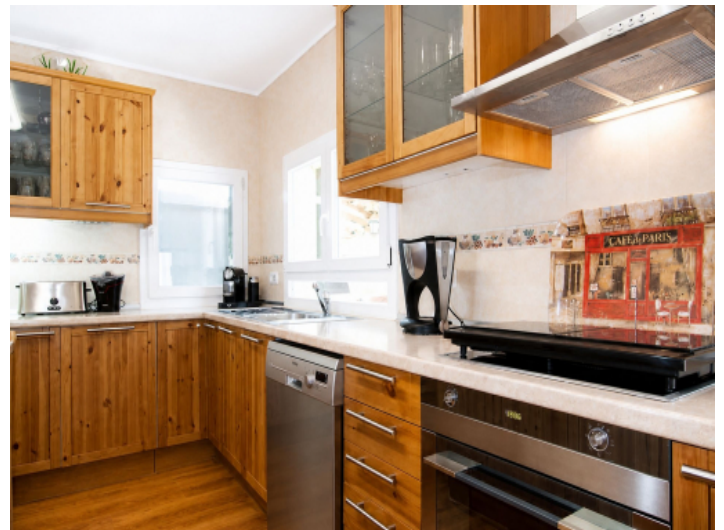
Large and modern kitchen