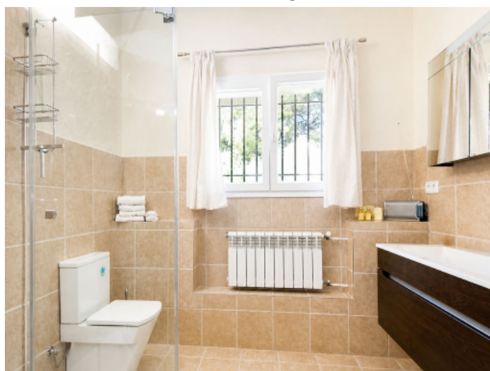
Bathroom with large shower in the ground floor