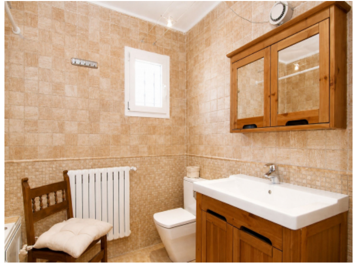
Bathroom with bathtub in the ground floor