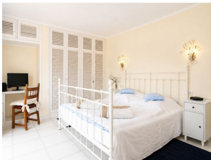
Upstairs bedroom with access to the balcony