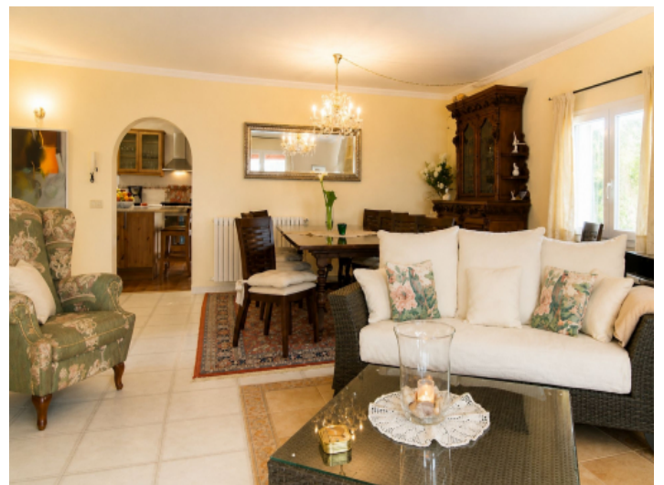
Living and dining area with fireplace