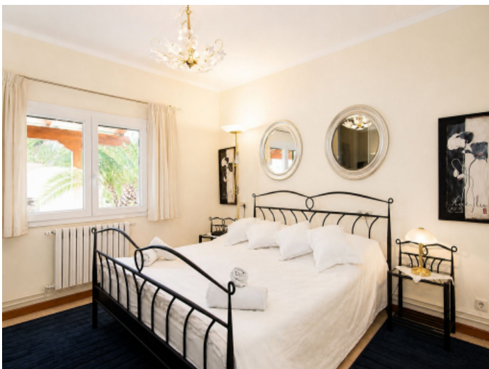
First bedroom on the ground floor