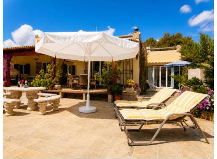
Sun terrace directly by the pool