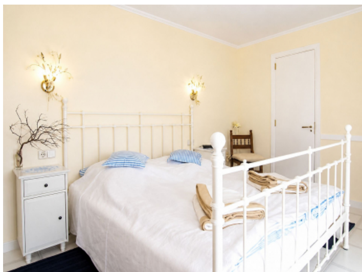
Upstairs bedroom with access to the balcony