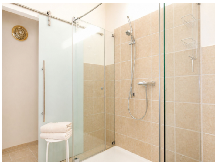
Bathroom with large shower in the ground floor