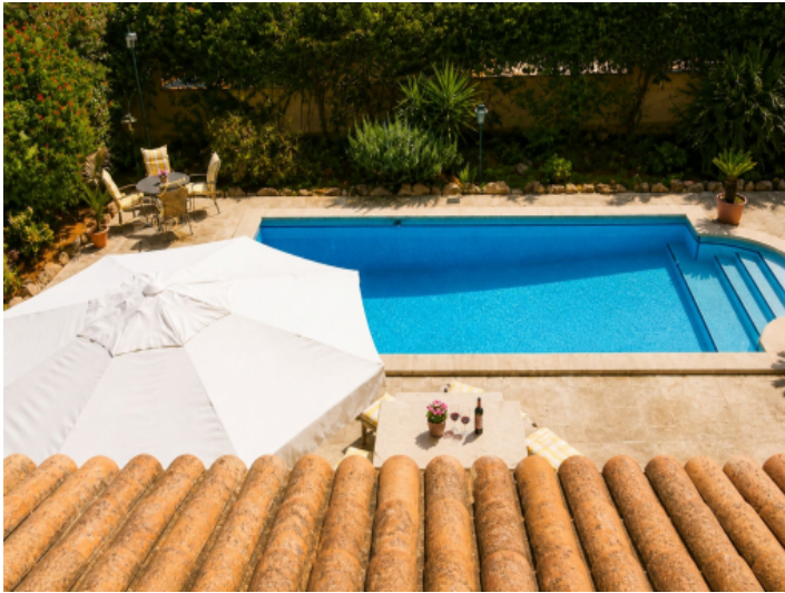
View of the pool from the roof terrace