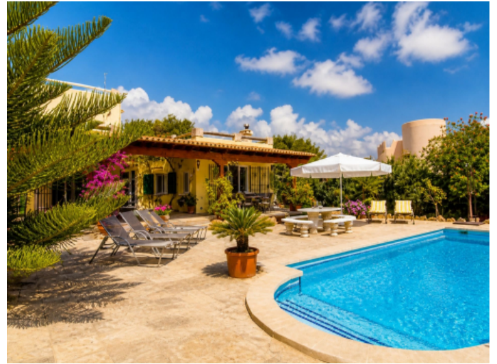
Large pool and terraces directly adjacent to it