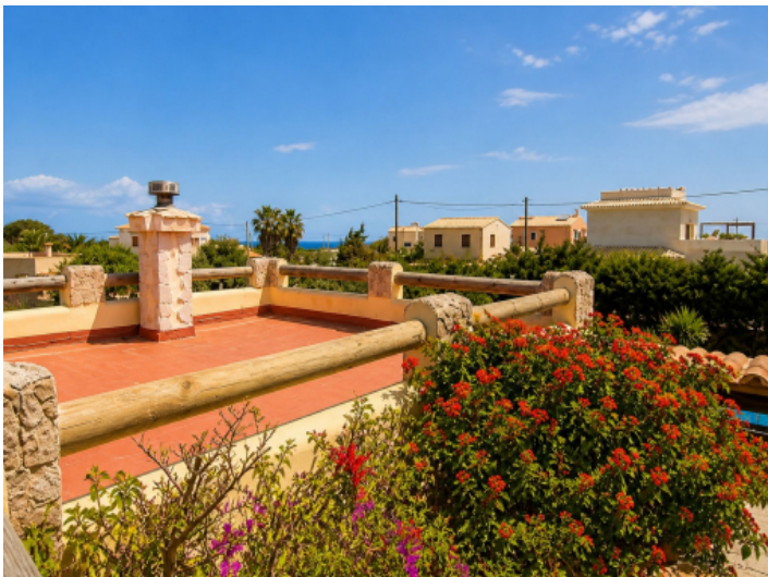
Several roof terraces with sea views