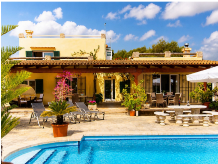
Large pool and terraces directly adjacent to it