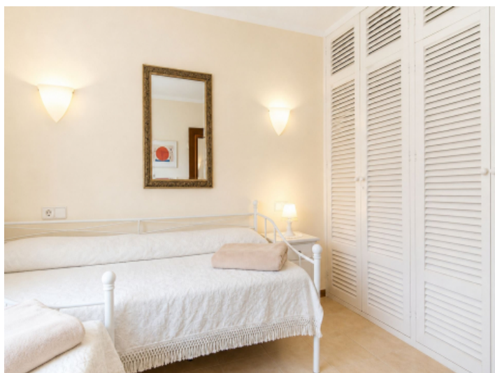
Third bedroom on the ground floor