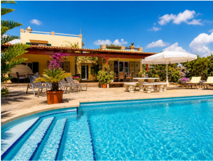
Large pool and terraces directly adjacent to it