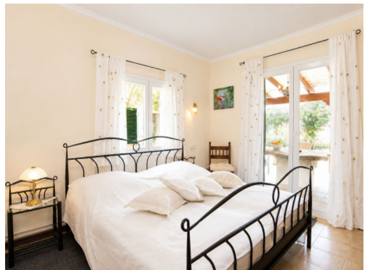
Second bedroom on the ground floor