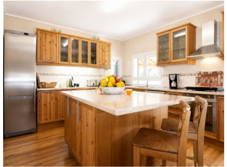
Large and modern kitchen