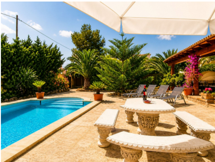
Sun terrace directly by the pool