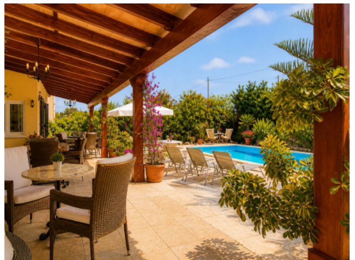
Covered terraces directly attached to the house