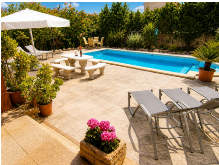
Sun terrace directly by the pool