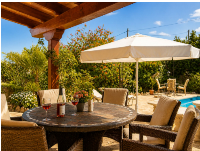
Covered terraces directly attached to the house