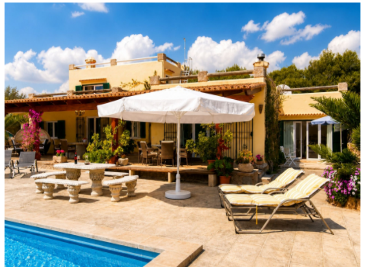
Sun terrace directly by the pool