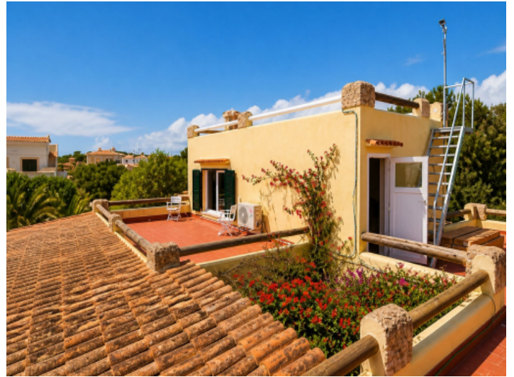
Several roof terraces with sea views