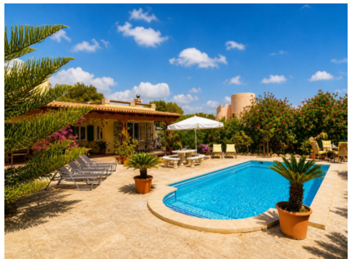
Sun terrace directly by the pool