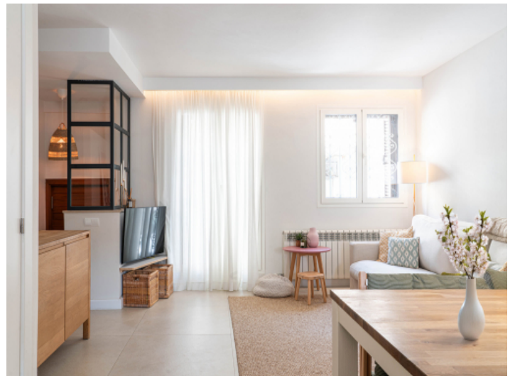
Light-filled living area