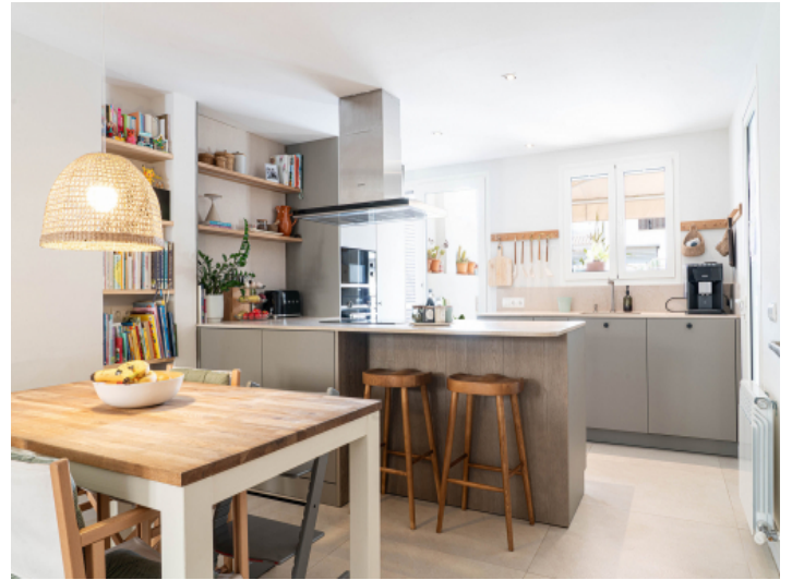
Bright kitchen-dining area