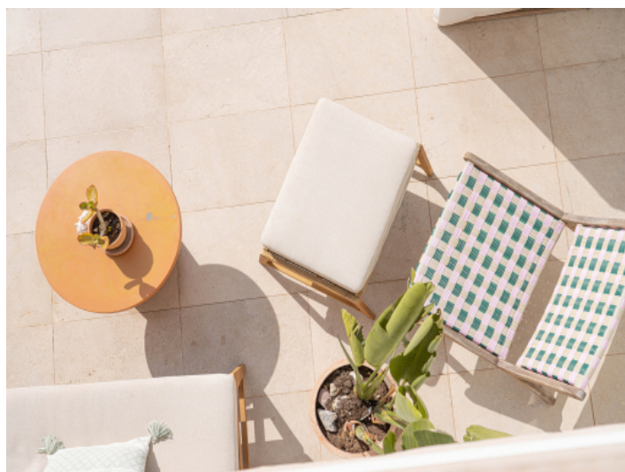
Cozy corner for relaxing