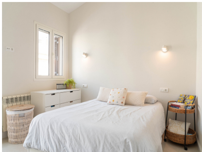
One of the three bedrooms