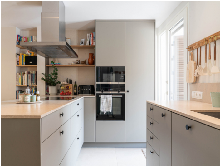
Open designer kitchen