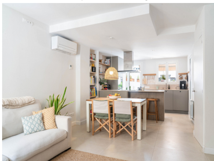
Open living concept