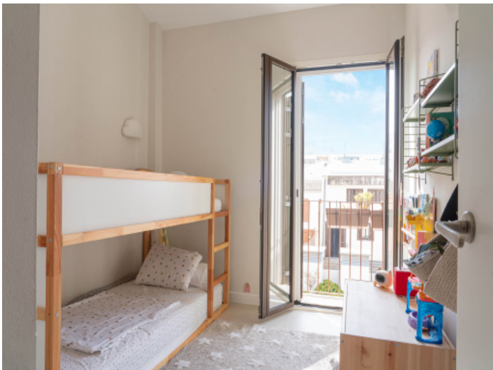
One of the three bedrooms