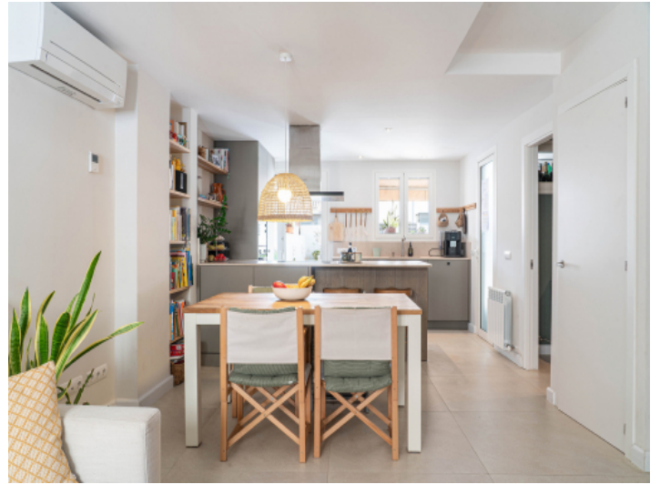
Open designed kitchen and dining area