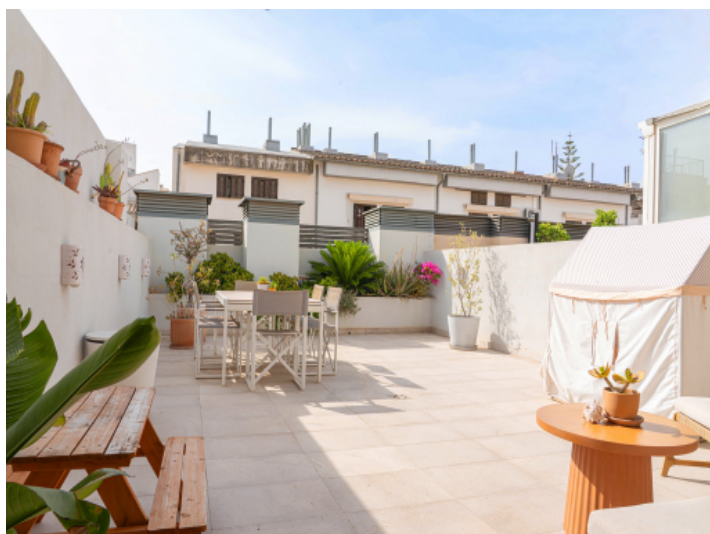
Spacious sun terrace