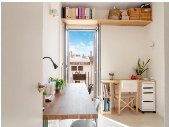
One of the three bedrooms