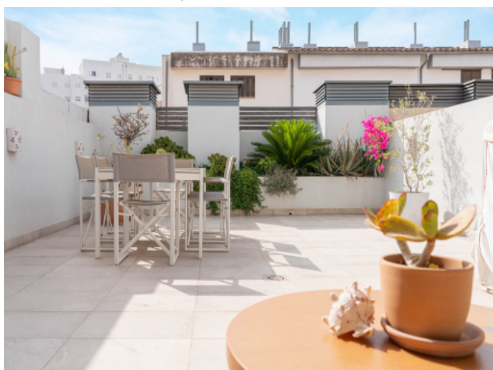
Large terrace for relaxing hours outdoors