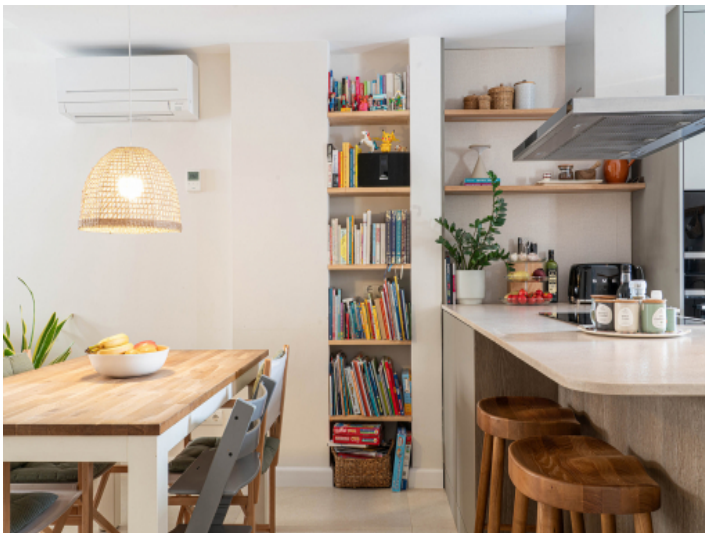
Cozy dining area