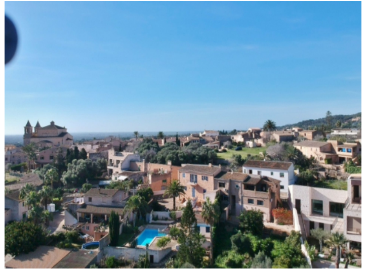
View over S'Alqueria Blanca