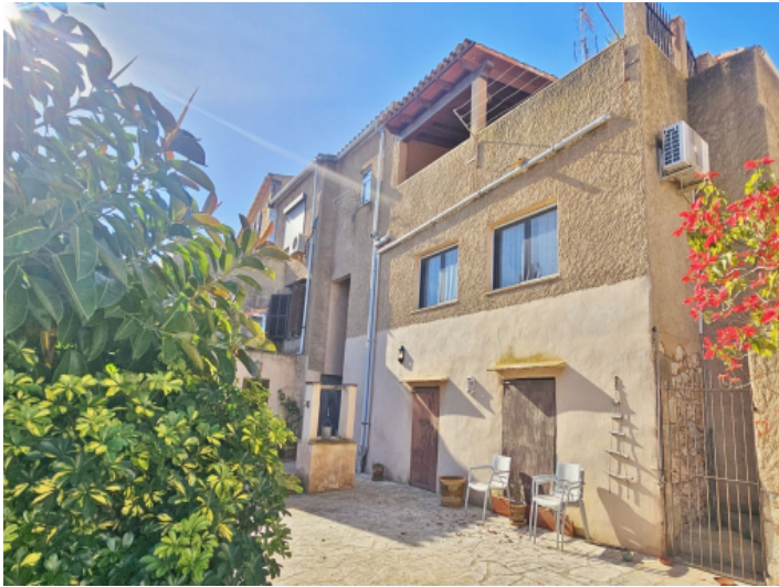
Townhouse with a view in S'Alqueria Blanca