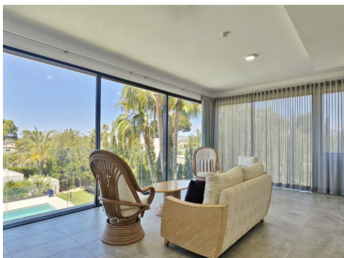
Living room on the upper floor