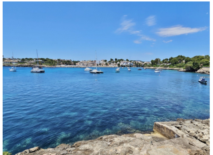
The sea is only a few meters away