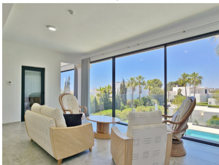
Living room on the upper floor