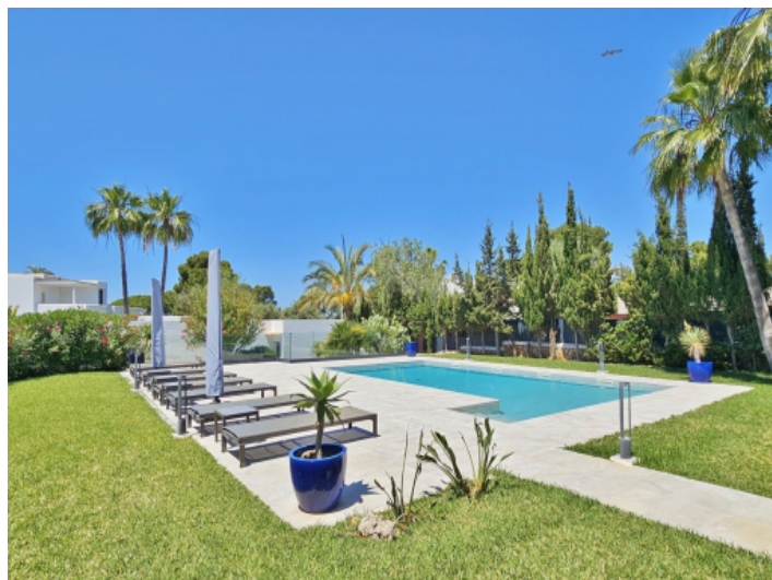
Pool and garden