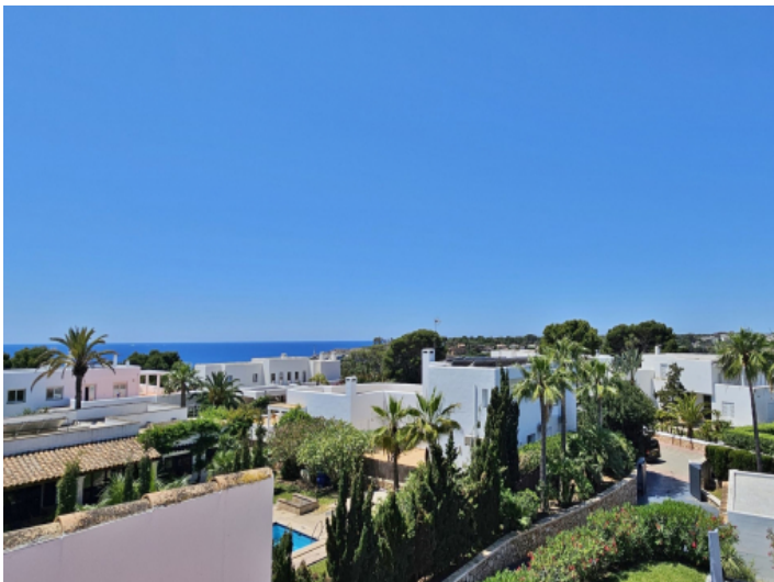
Sea view from the roof terrace