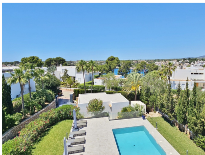
Pool and garden