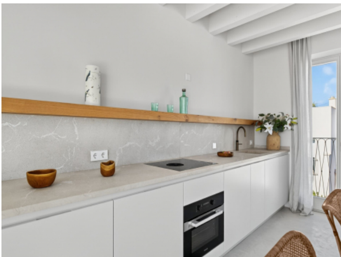
Kitchen with stone