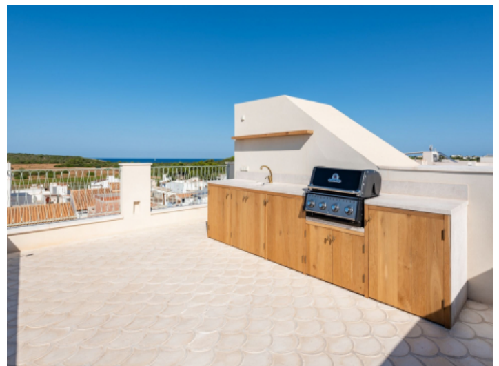
Roof Top Terrace with sea view