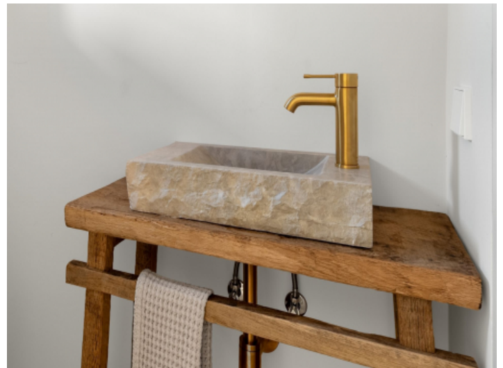
Bathroom with stone sink wash