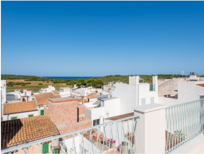
Panorama view to the sea