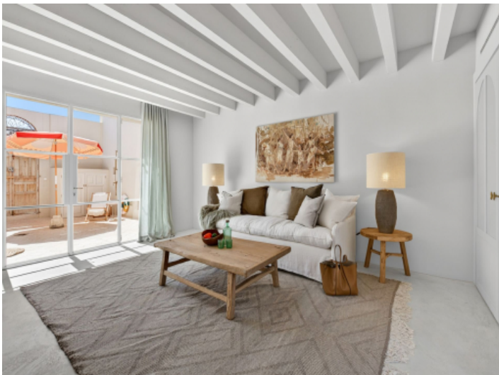
Living room with access to the patio