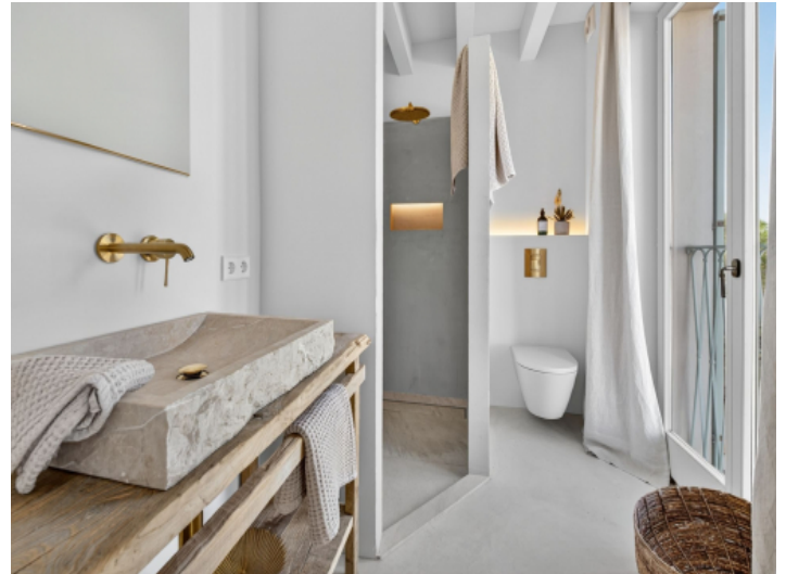
Bathroom with microcement