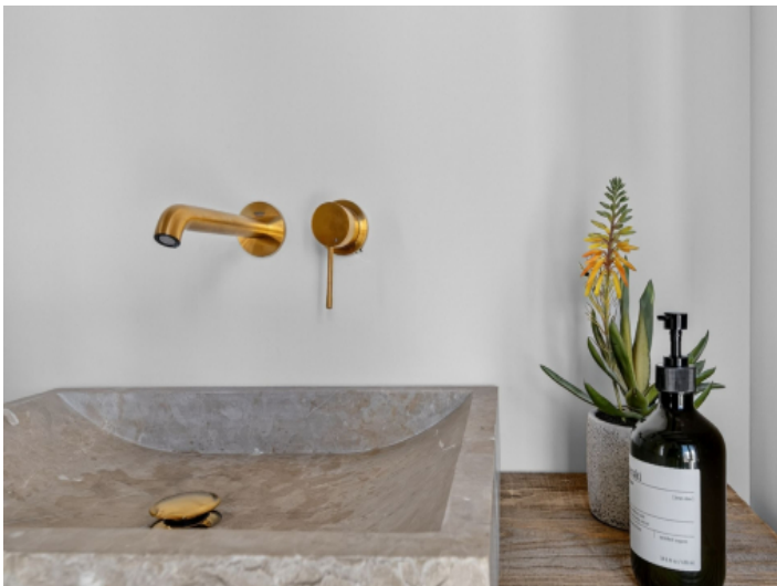
Stone sink bathroom