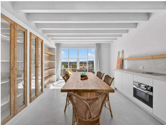
Open kitchen concept