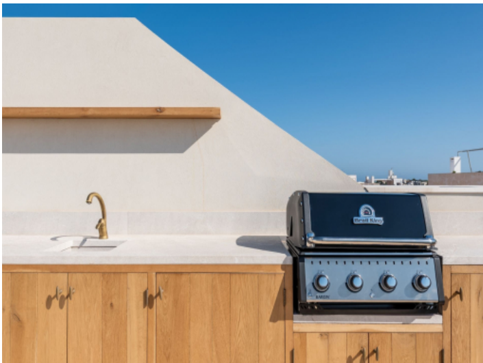
Roof top BBQ