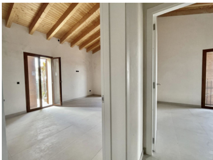
Master bedroom on the left and third bedroom on the right