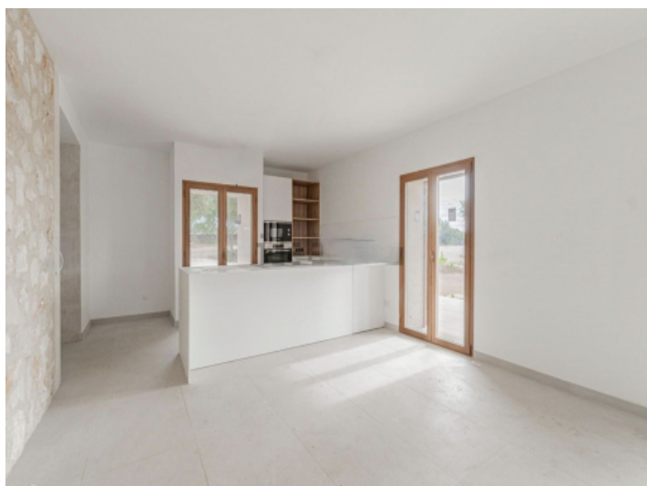
Kitchen with kitchen island