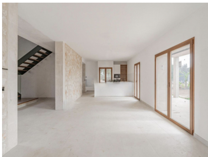
Living and dining room