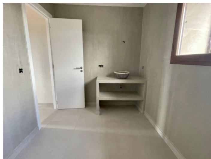
En suite bathroom, second bedroom