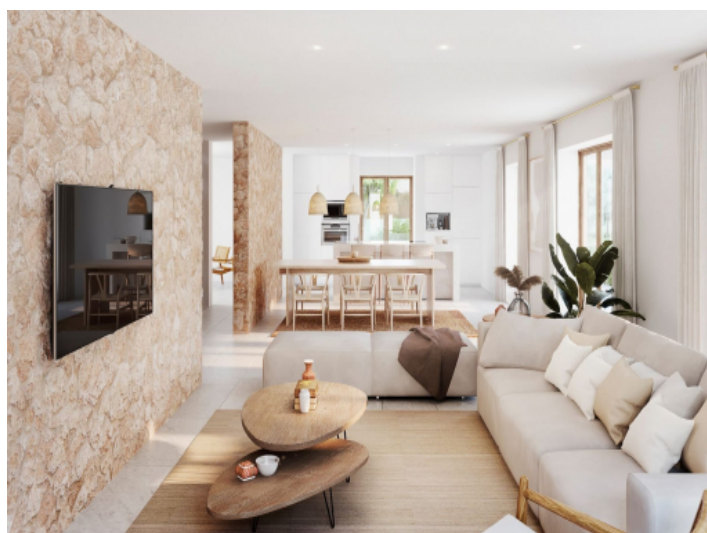
Living and dining room