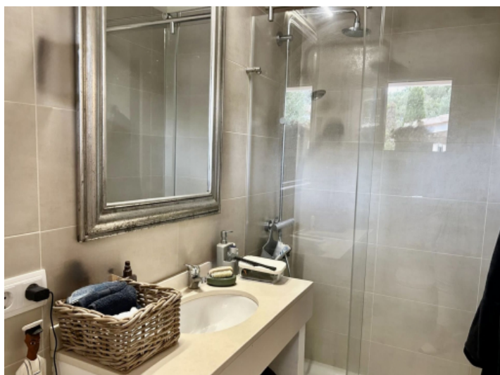
En suite bathroom on the ground floor