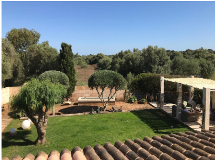
Vista desde el balcón