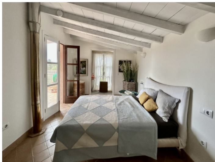
Bedroom on the first floor