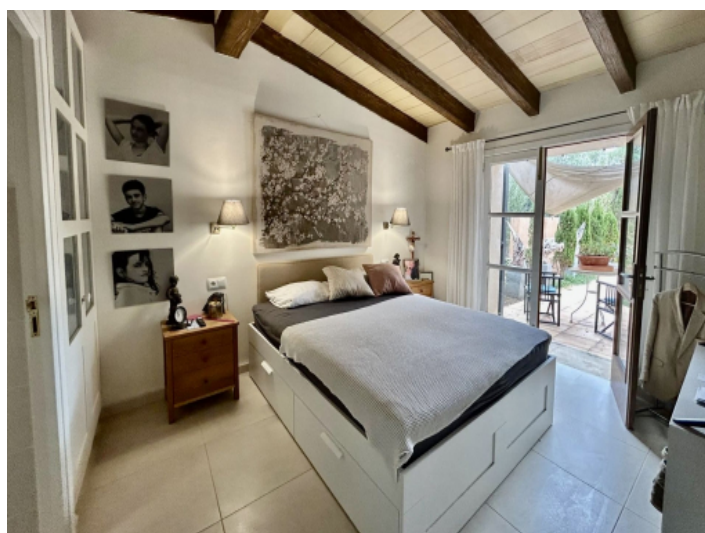
Bedroom on the ground floor