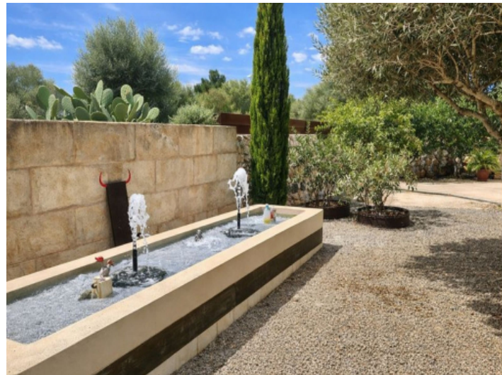
Fountain in the garden