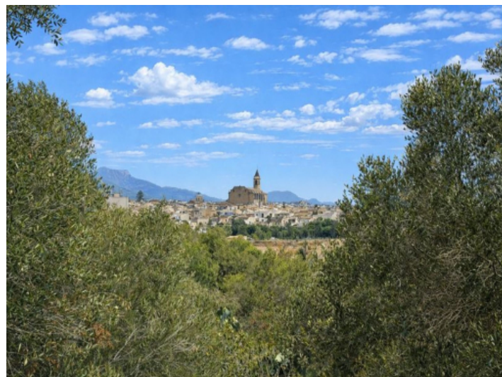
View towards Santanyi