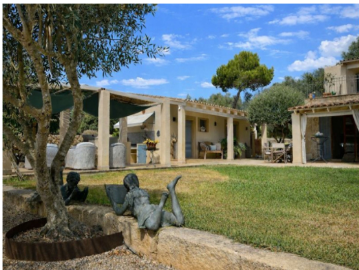
View of the guesthouse