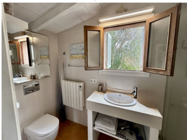
En suite bathroom on the first floor