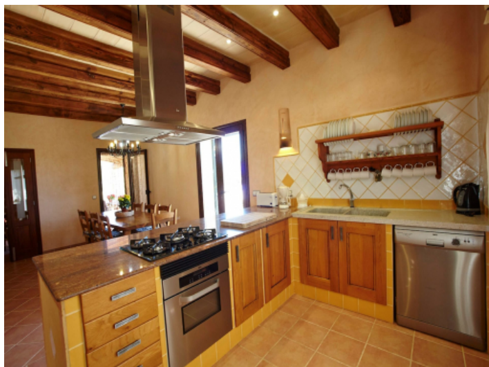
Kitchen with adjoining dining room