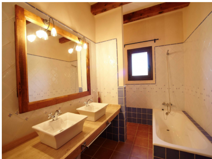
Second bathroom on the ground floor