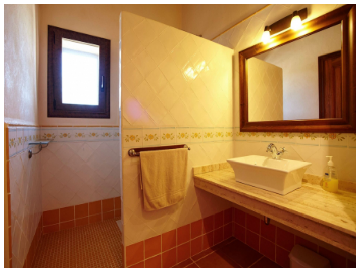
First bathroom on the ground floor