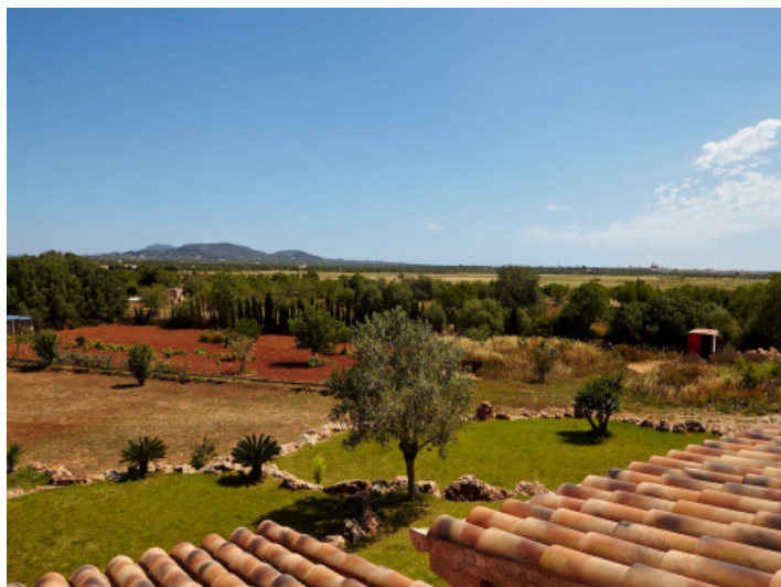
View from the upper floor