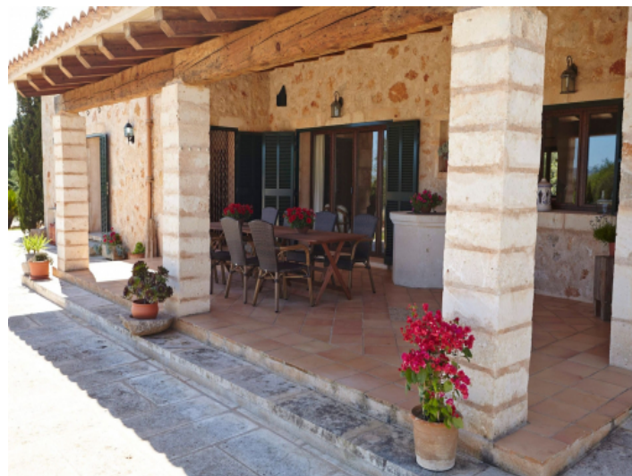
Covered terrace attached to the house