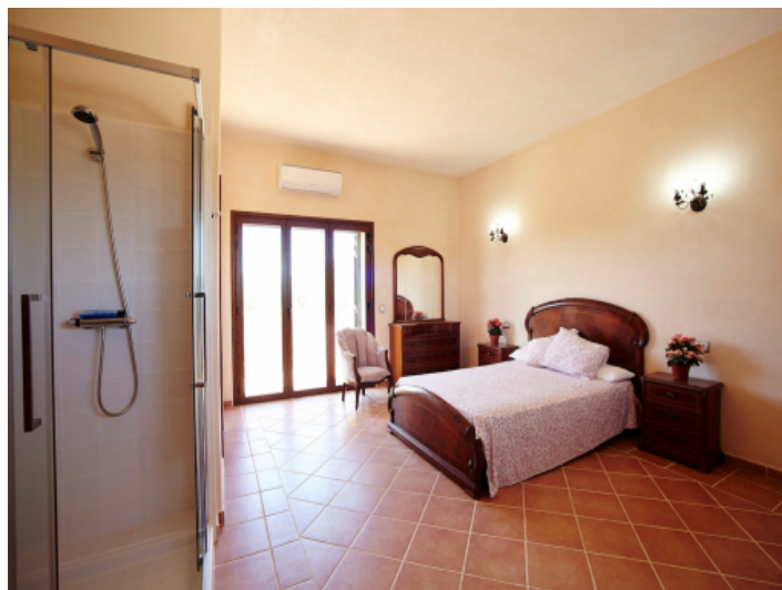
Master bedroom with bathroom en suite