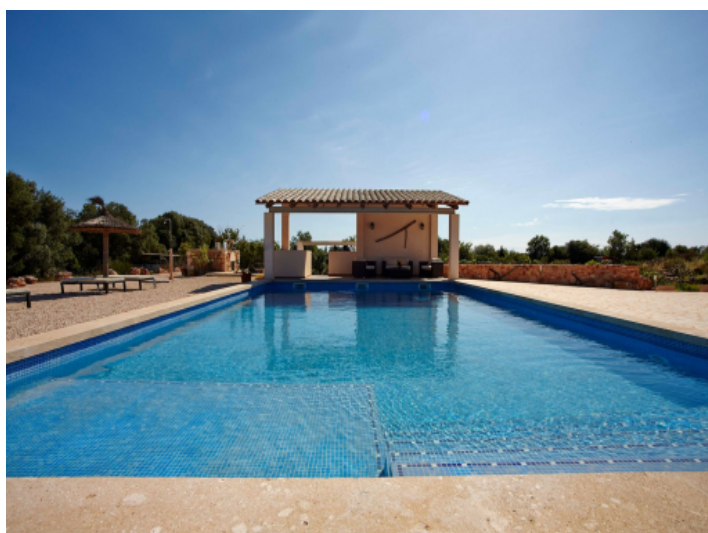
Pool with 84 m 2 , outdoor shower and lounge area