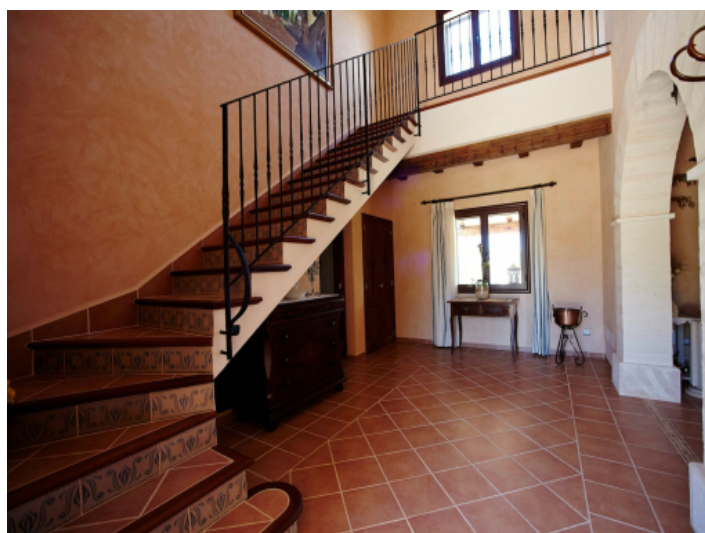
Staircase and entrance area