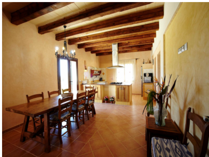
Large dining area