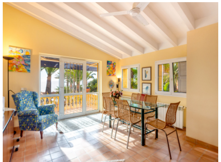
Office in the studio