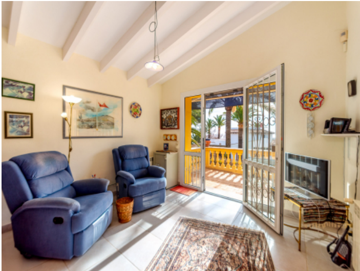
Additional living area in the separate Studio