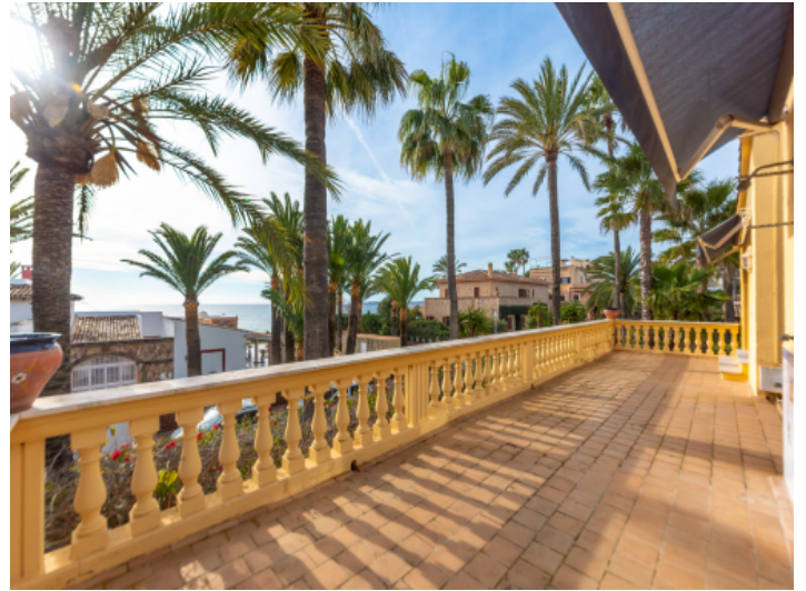
Large terrace with awnings