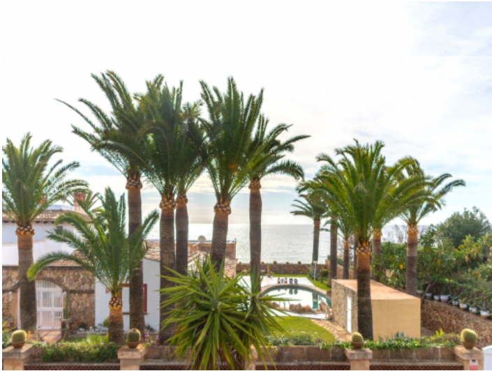
Lovely sea views