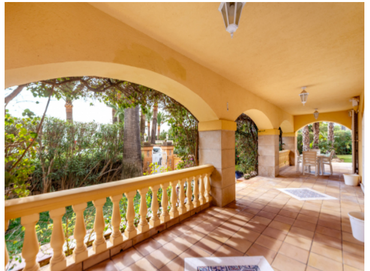
Superb covered terrace