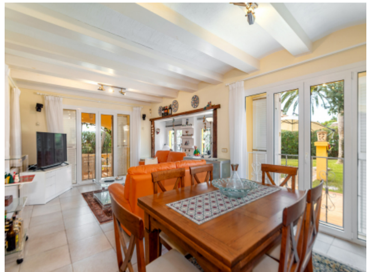
Dining area with access to the garden