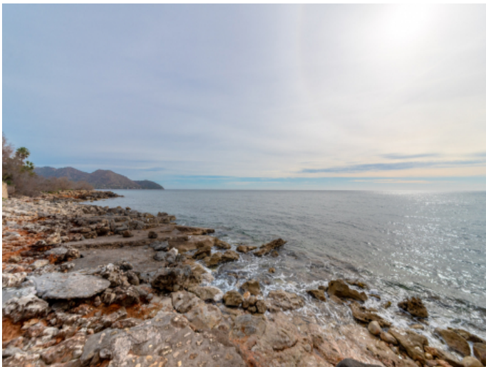
The sea closeby