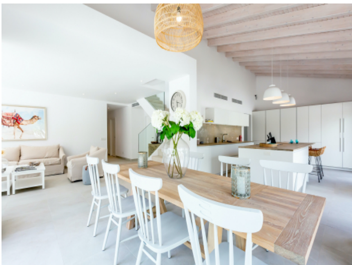
Spacious dining area