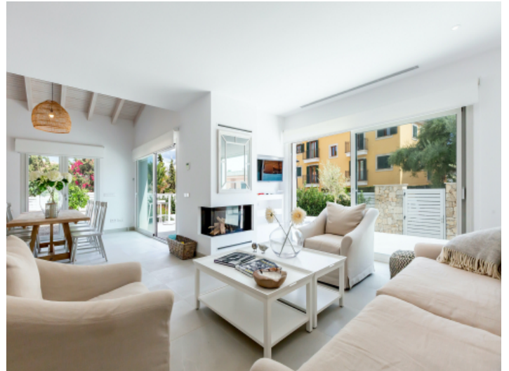
Elegant living area