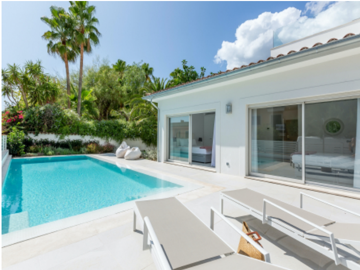
Exclusive villa with holiday rental licence in Puerto de