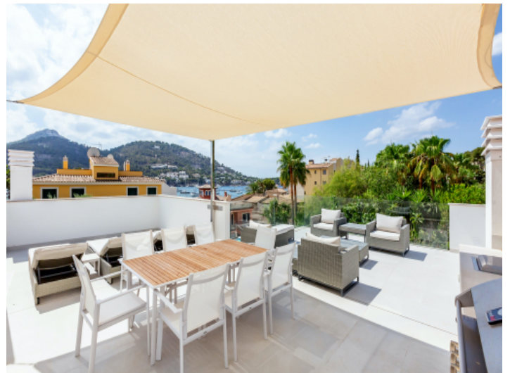
Outdoor dining area