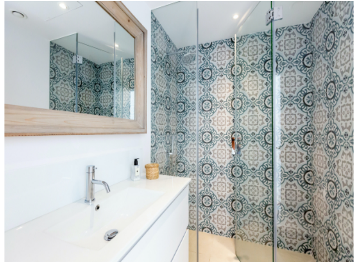
One of 4 bathrooms