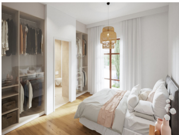
One of 6 bedrooms