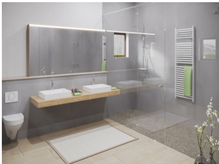
Finca with 7 bathrooms