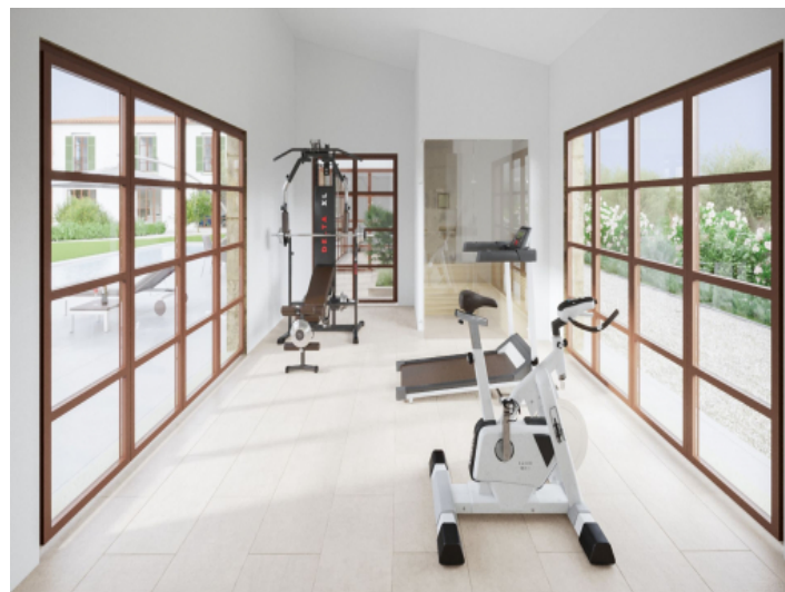
Gym and fitness