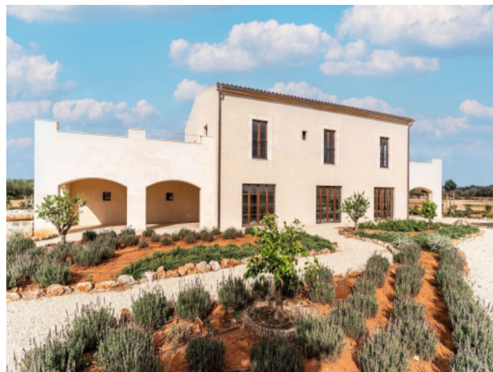
View to the finca