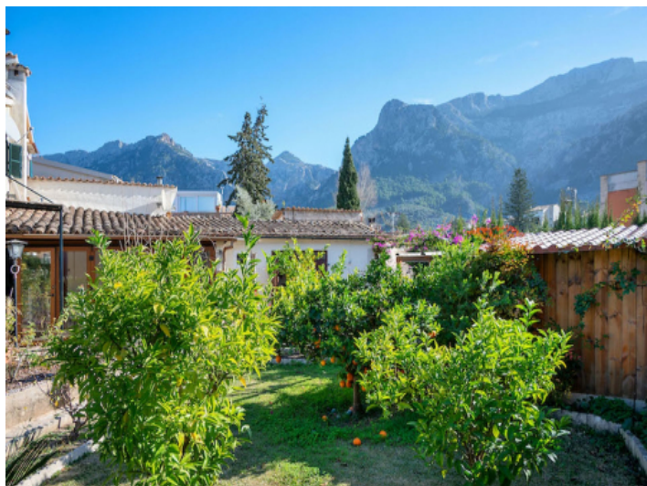
Garden and Trautman mountain views