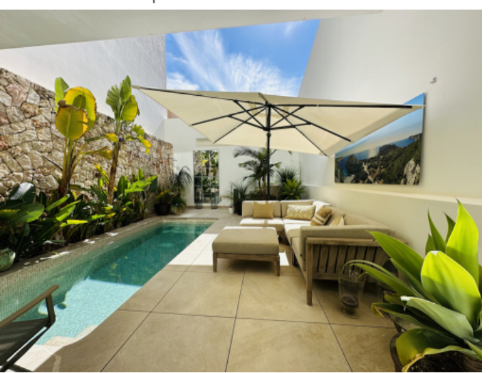
Patio and pool