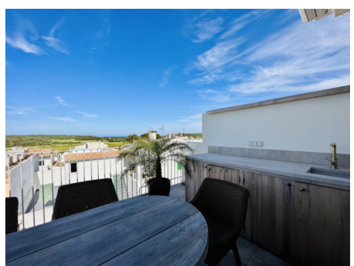
Rooftop terrace with outdoor kitchen