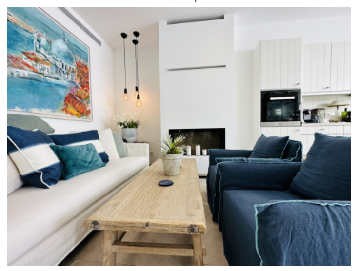
Relaxed living area