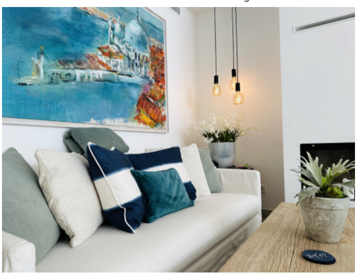
Beautiful living area