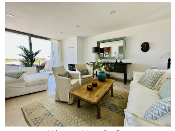
Living area at the rooftop floor