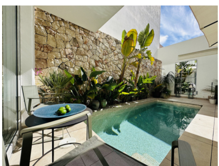
Patio and pool