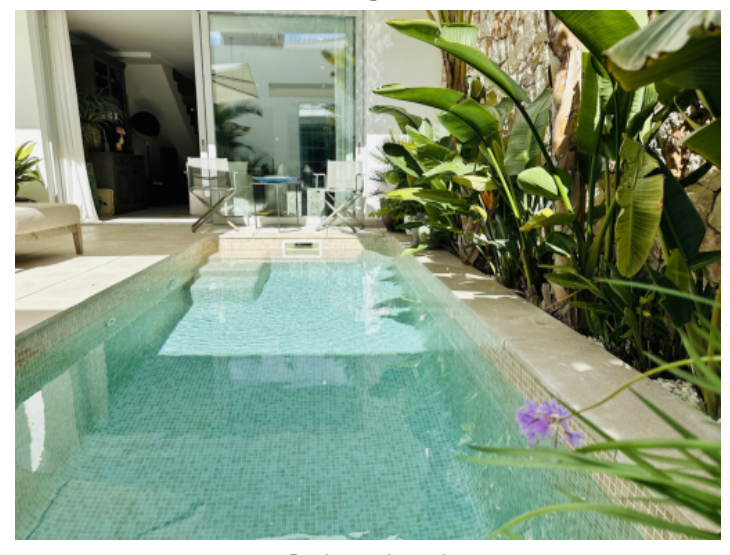
Patio and pool