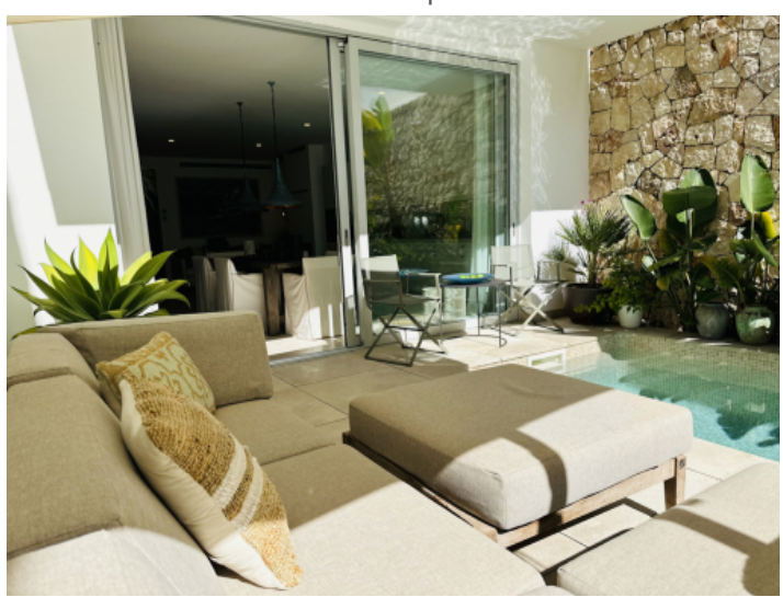
Comfortable outdoor lounge