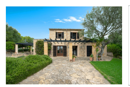
Petra search for property MAL-077798