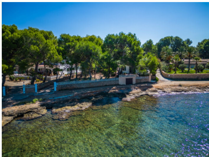
Villa in first sea line