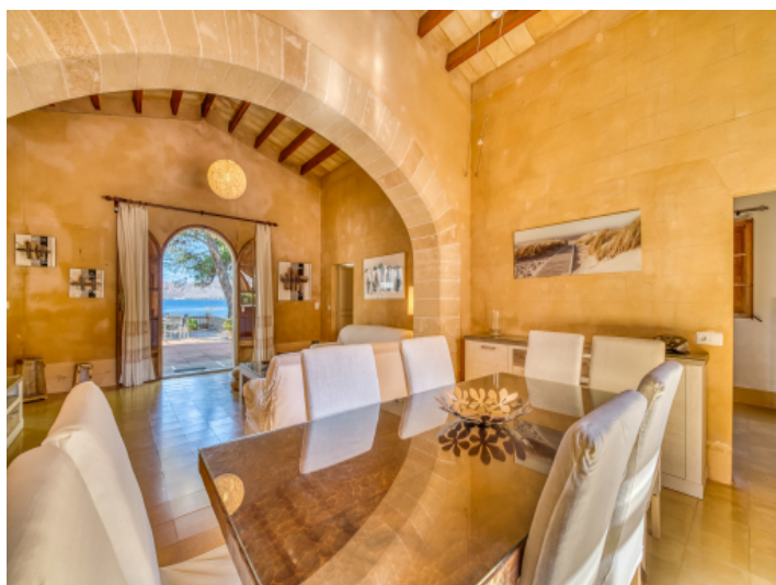
Open dining area