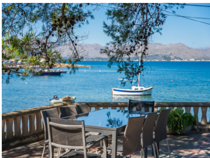
Gorgeous mediterranean sea views from the terrace