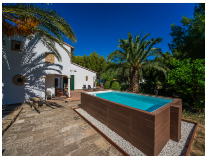
Pool is located on the terrace