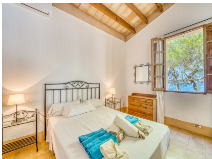
Bedroom with mediterranean sea views