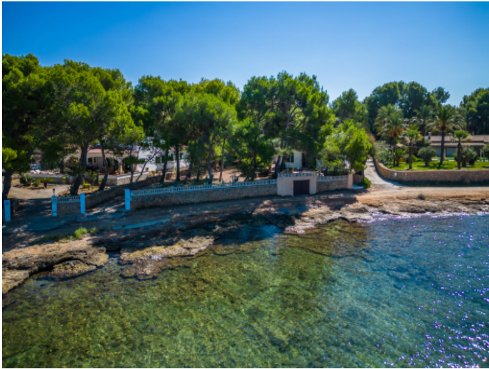
Villa in first sea line