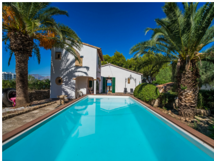
Pool area is surrounded by palma