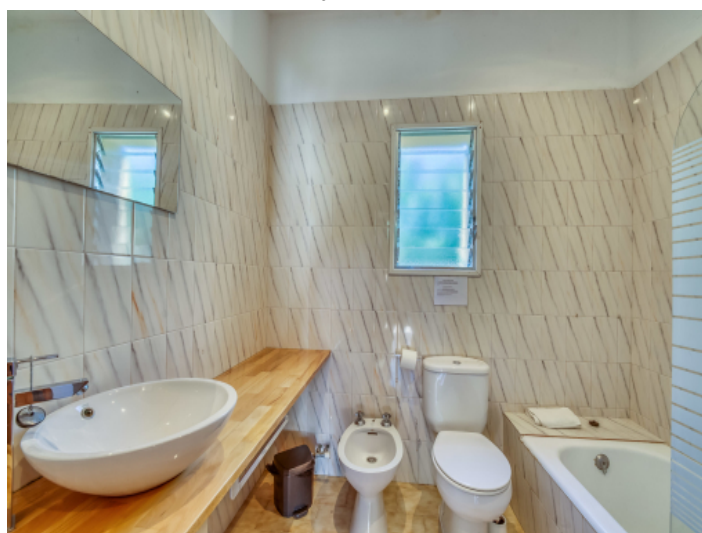
Bathroom with daylight