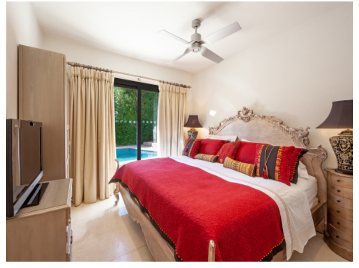
Bedroom with double bed and pool views