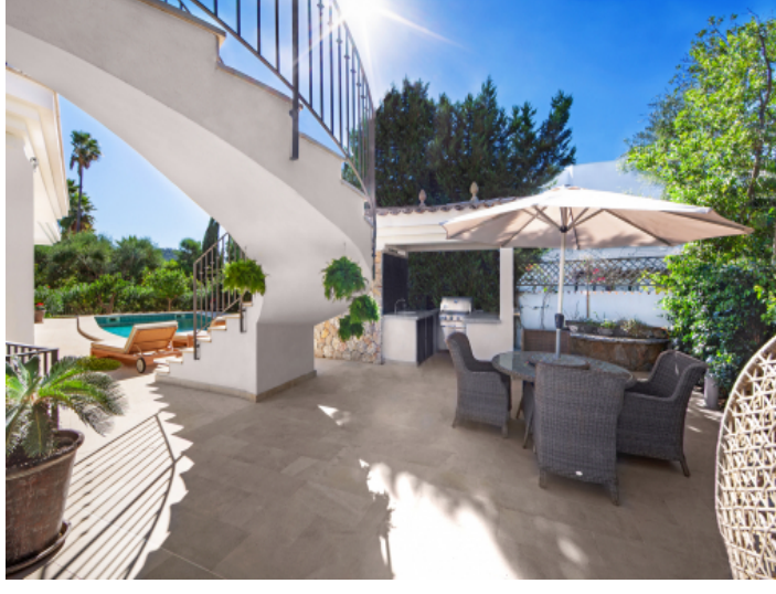
Gorgeous terrace with summer kitchen