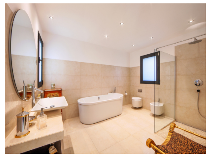
Bathroom with shower and bathtub