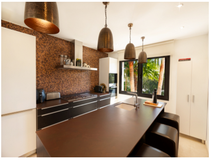
Kitchen with bar