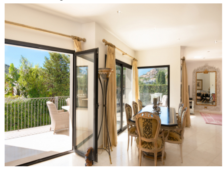
Dining area with balcony access