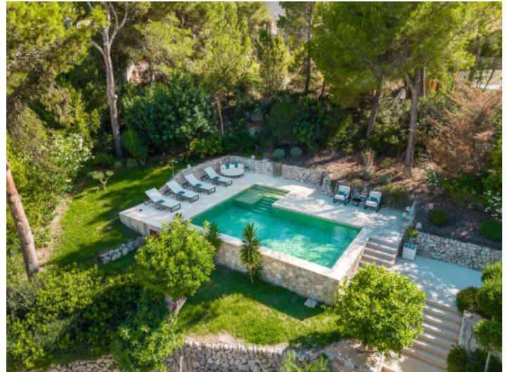
Pool oasis in a green garden