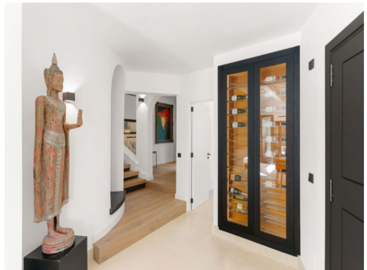
Corridor with wine cooler