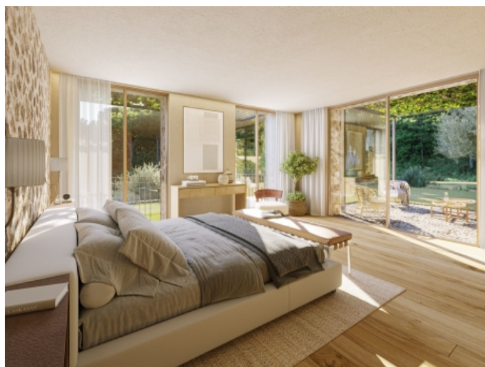
Luxurious master bedroom