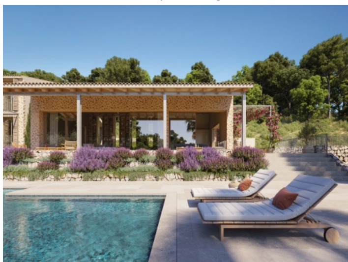
Mediterranean pool oasis