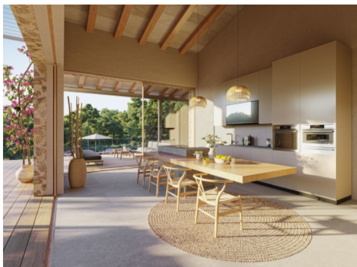
Fluent access to the open kitchen