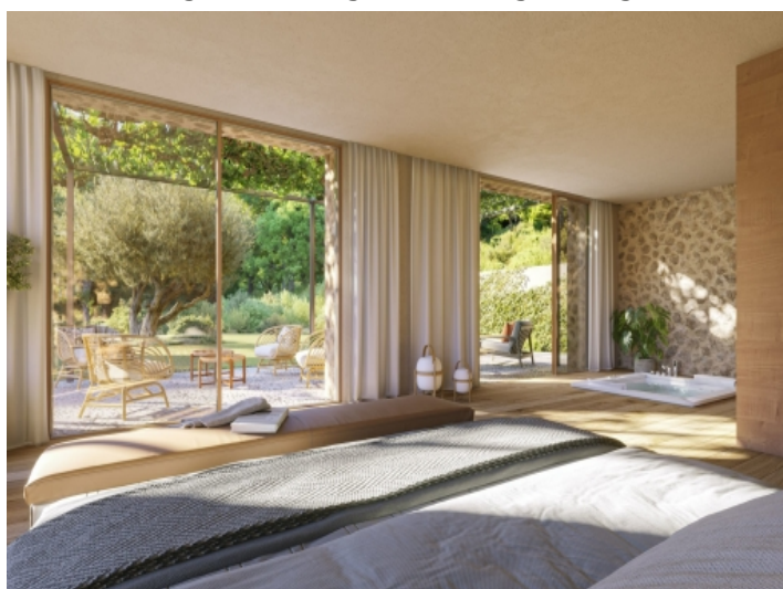
Direct access to the outside