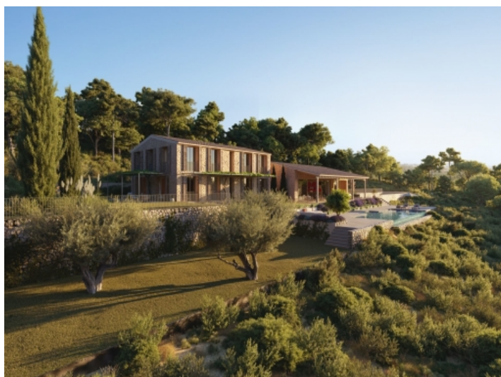
Situated in a tranquil location