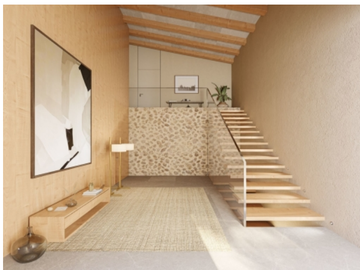
Elegant interior design