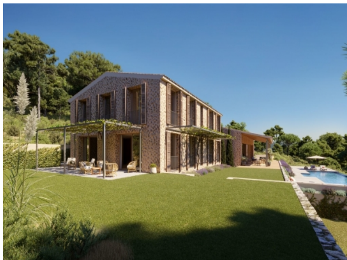
Wonderfully laid-out garden