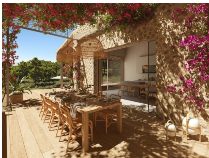
Idyllic outdoor dining area