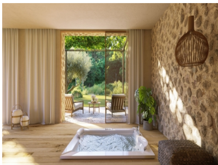
Jacuzzi in the bedroom