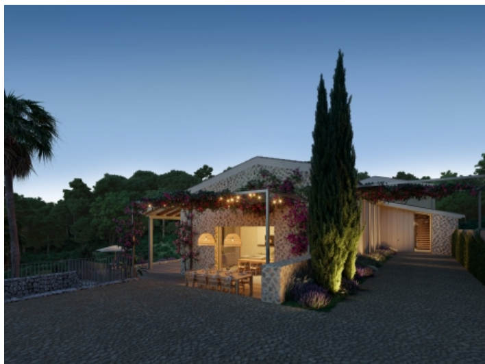
Finca by night