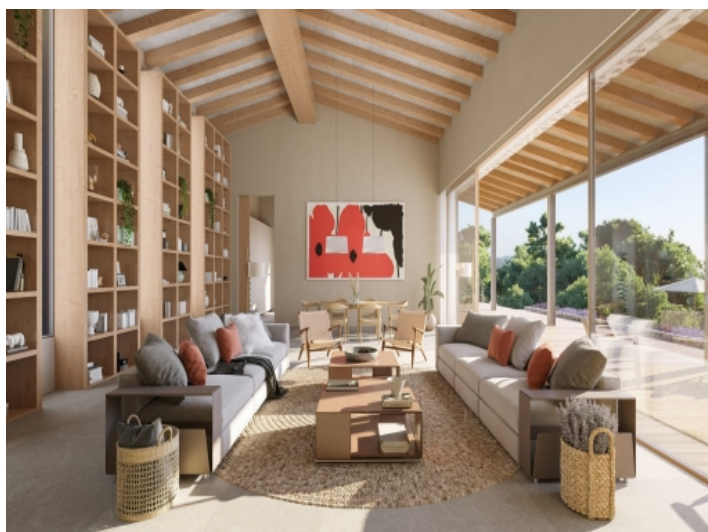
Lightfilled living area with high ceiling