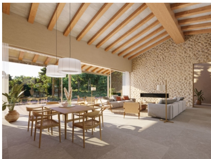
Open plan living and dining area