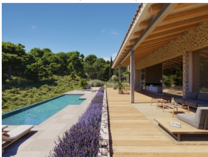
Paradise-like terrace and pool area