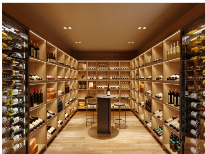
Fantastic own bodega