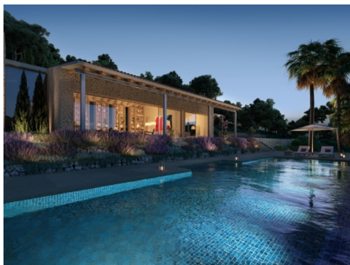
Finca and pool by night