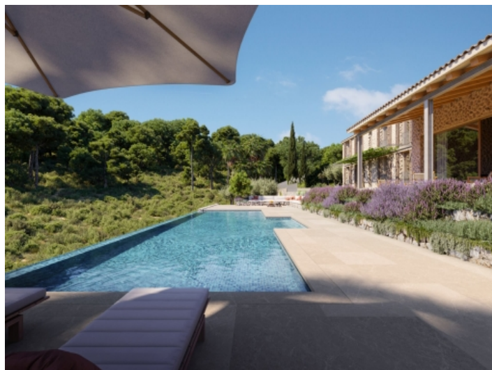
Pool area that offers absolute privacy