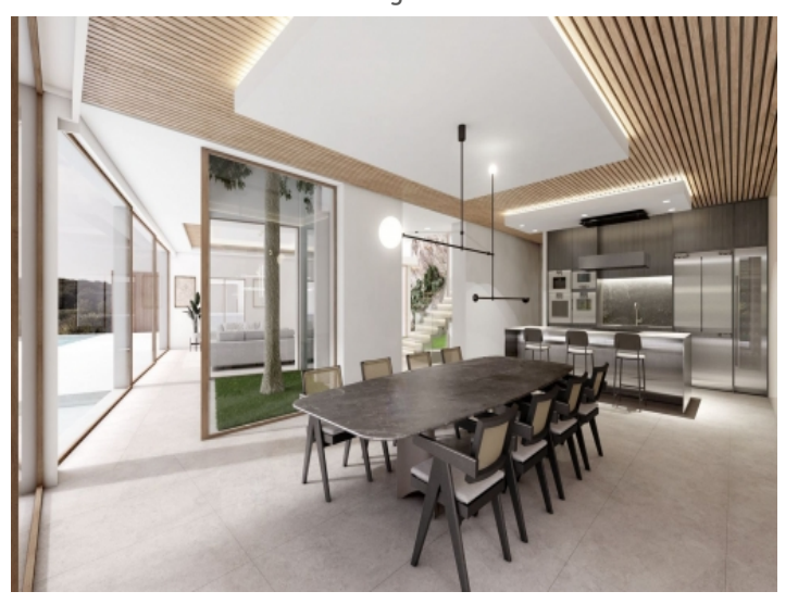
Dining area and kitchen