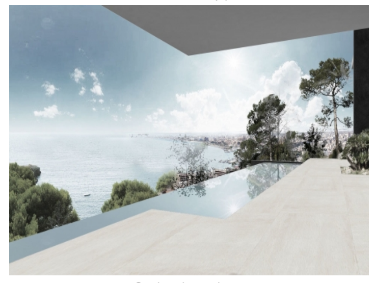
Pool and sea views