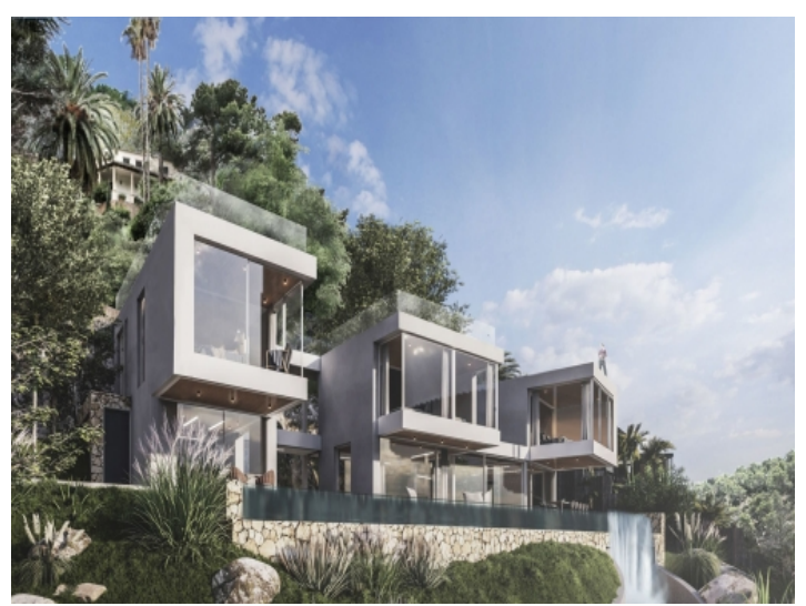
Villa and infinity pool