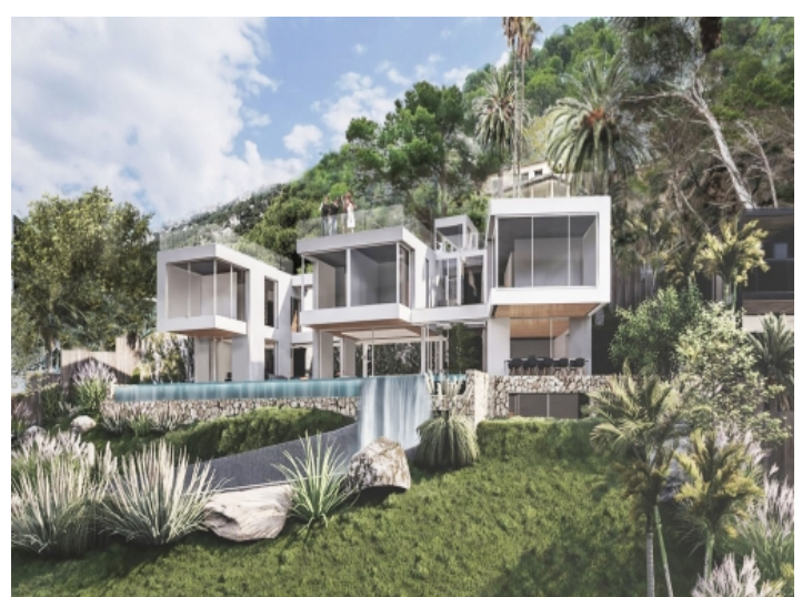
Villa and infinity pool