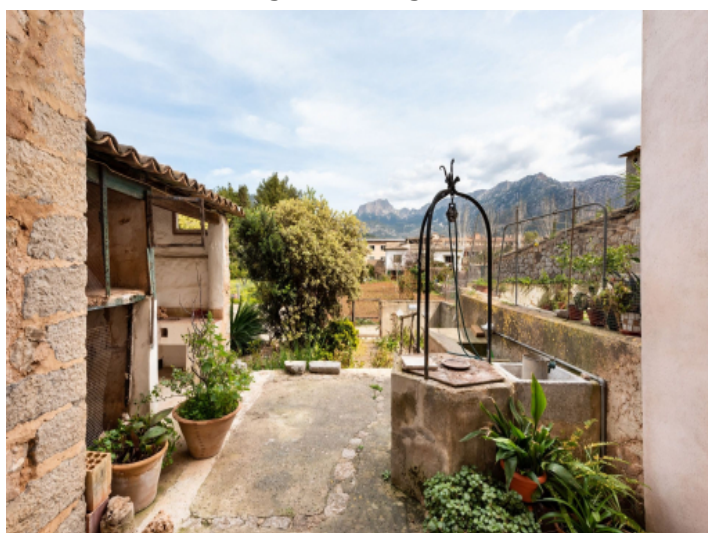
Mountain view from the terrace