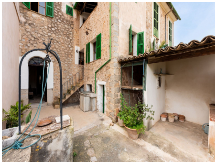
Terraces and own fountain