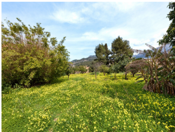
Large beautiful garden