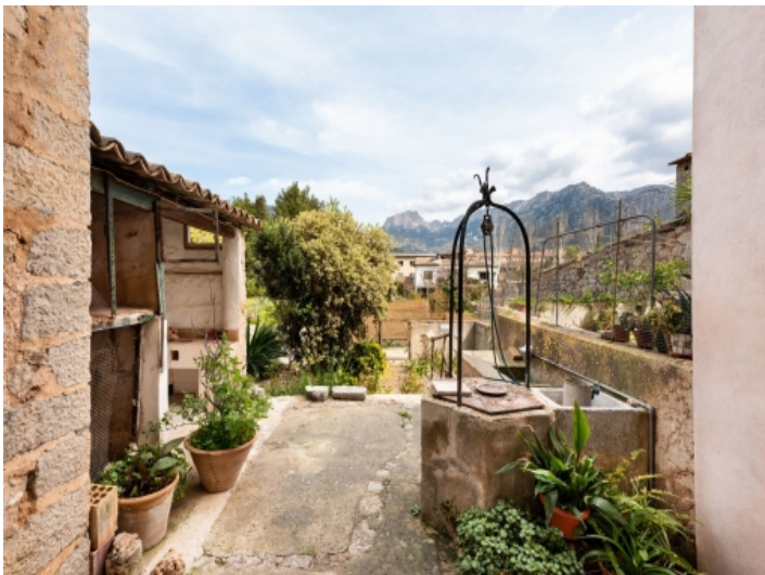
Mountain view from the terrace