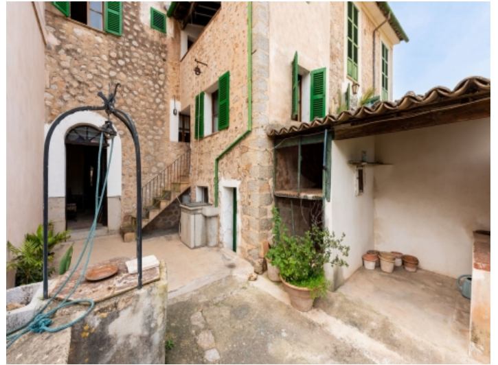
Terraces and own fountain