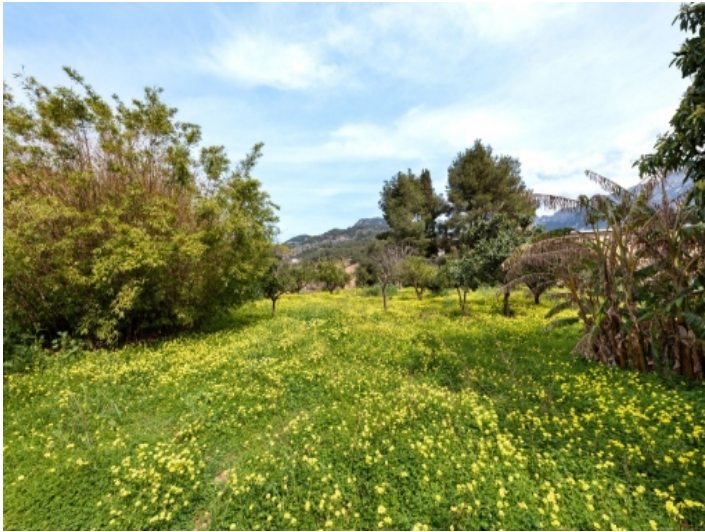
Large beautiful garden