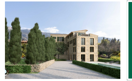
Soller search for property MAL-077684