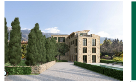
Soller search for property MAL-077684