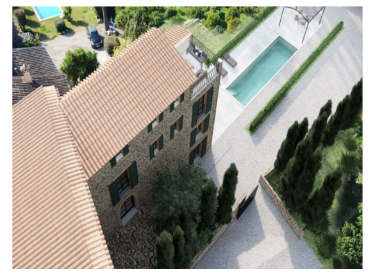
Pool and outdoor area