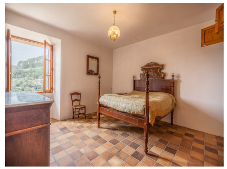
One of 7 bedrooms

PORTA MALLORQUINA • C./ COLOM 20 2°, 07001 PALMA, SPAIN TEL.: +34 971 698 242 • INFO@PORTAMALLORQUINA.COM • WWW.PORTAMALLORQUINA.COM