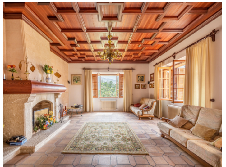
Cozy living area with fireplace