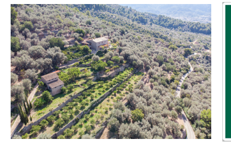
Soller search for property MAL-077676