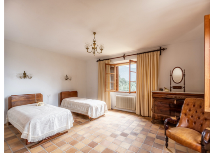
One of 7 bedrooms