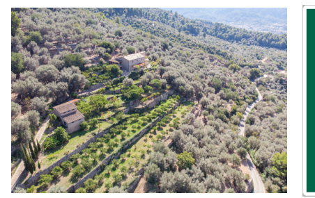
Soller search for property MAL-077676