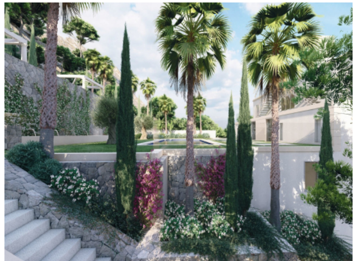
View of the garden