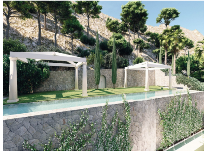
View of the pool