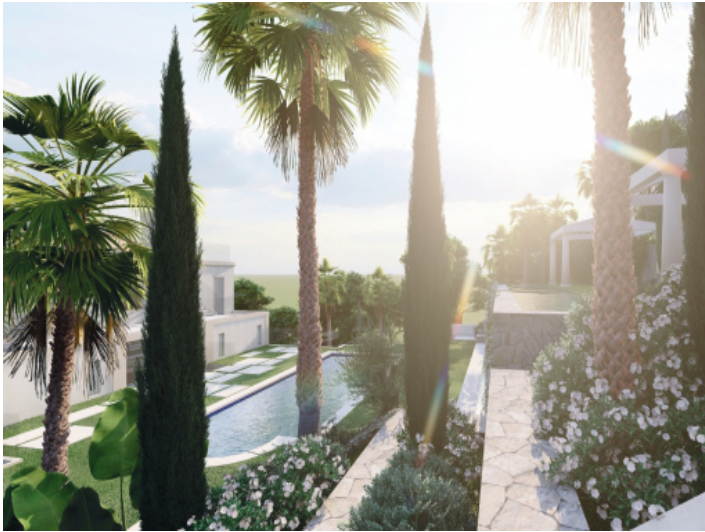
Mediterranean garden with pool