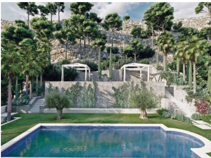
Garden with pool