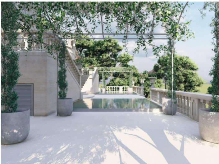
Terrace and pool area