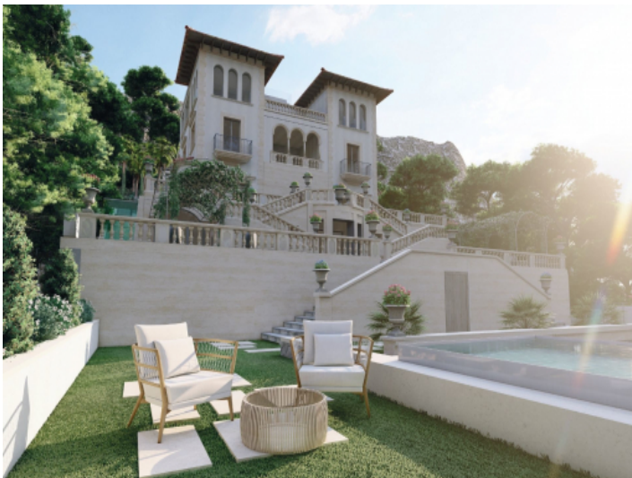
Exterior view and pool