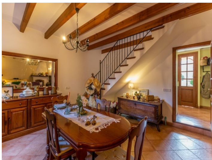
Dining area with wooden ceiling beams