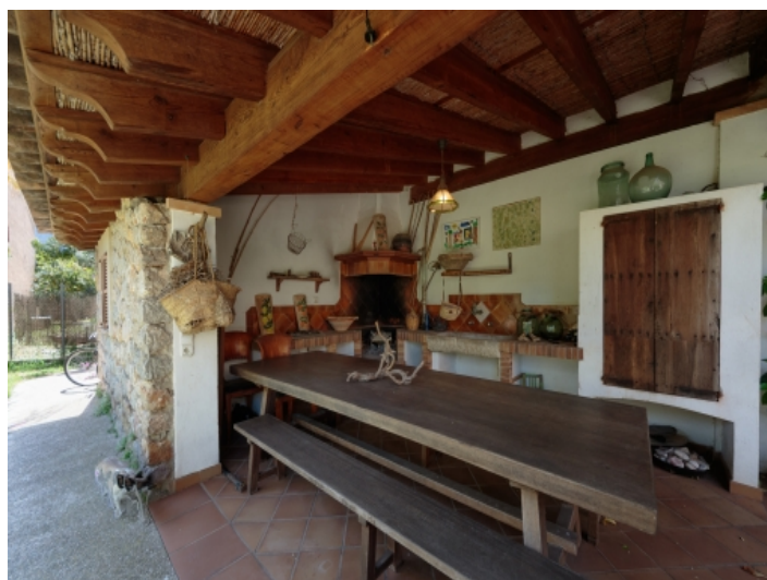
Fantastic outdoor bbq area