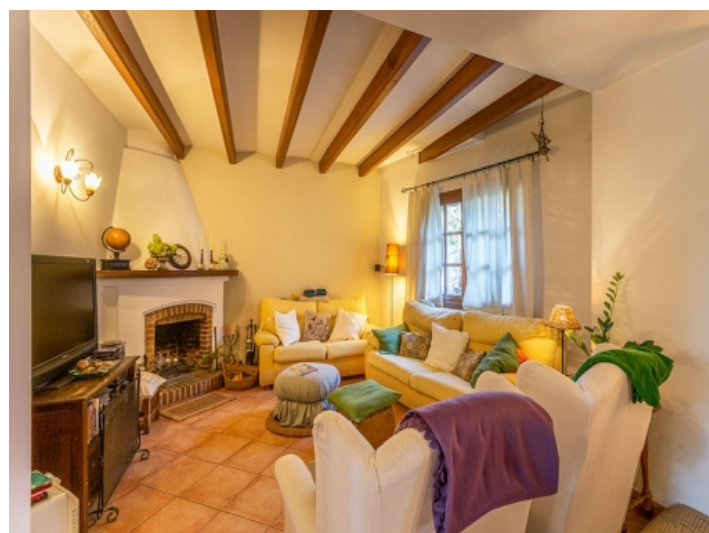
Cosy living area with fireplace