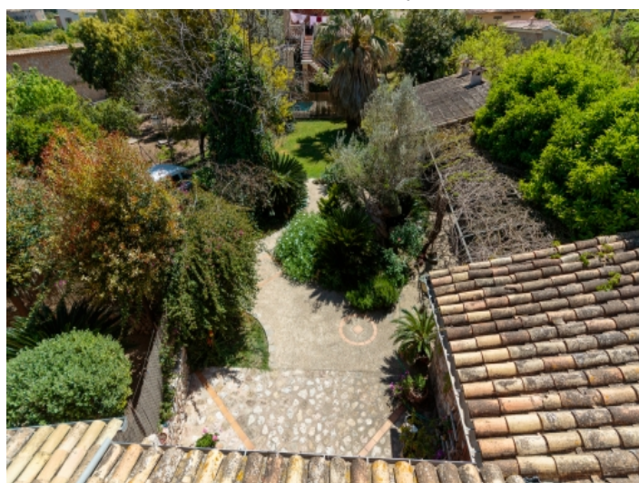
Terrace and garden