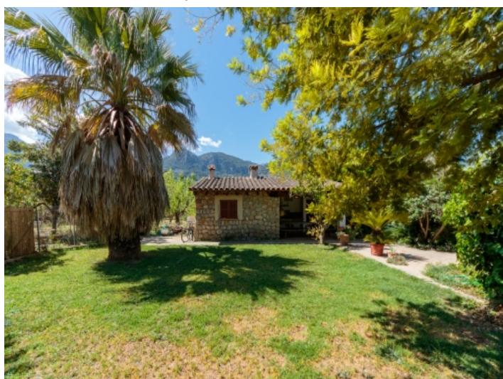
Beautiful mediterranean garden