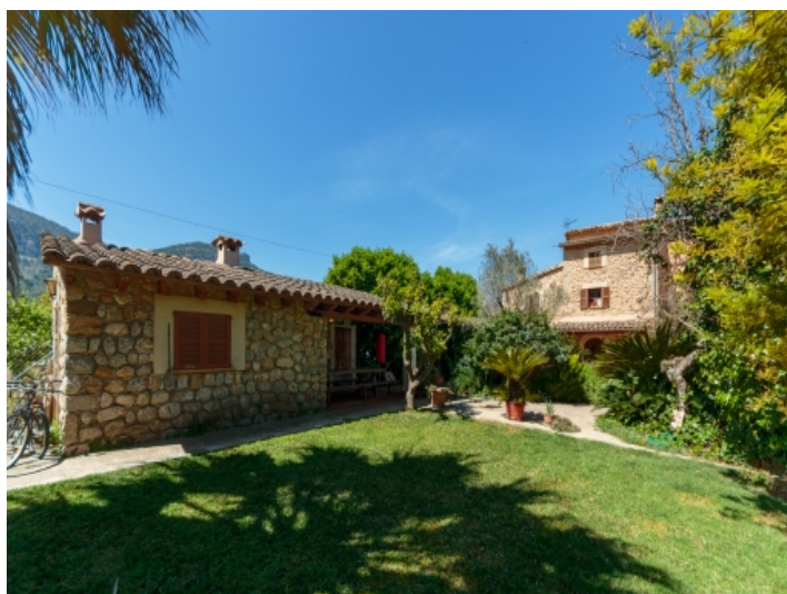
Wonderful country house with charme close to Soller