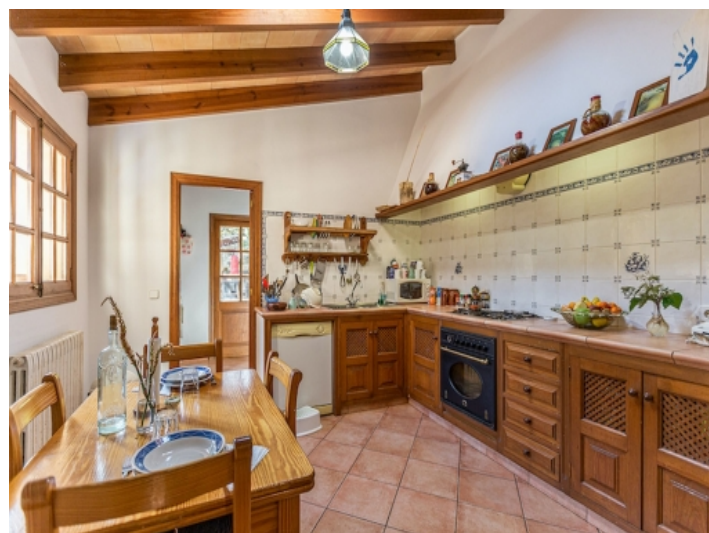
Lovely country house kitchen