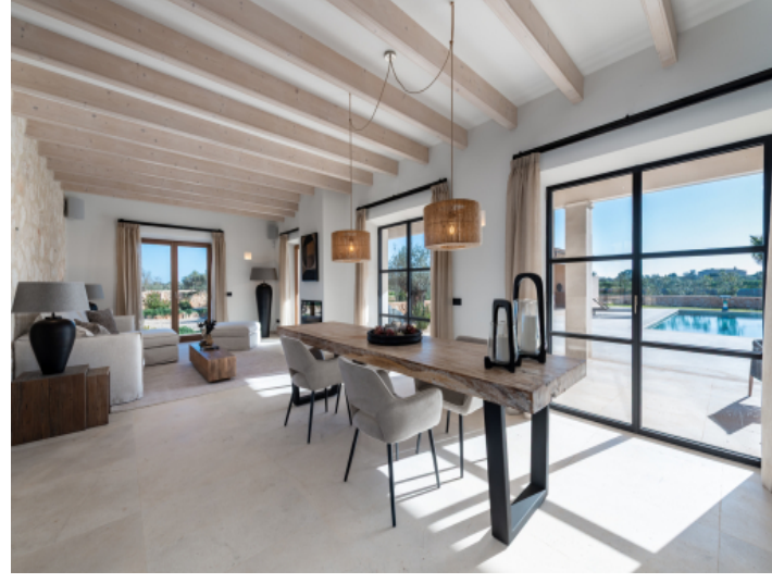
Living area Dining area