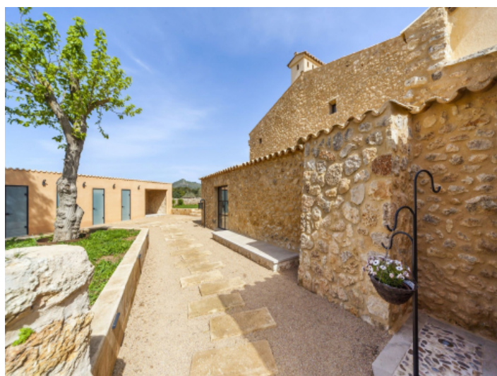
Exterior view and outdoor area