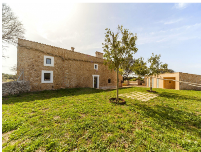
Finca and garden