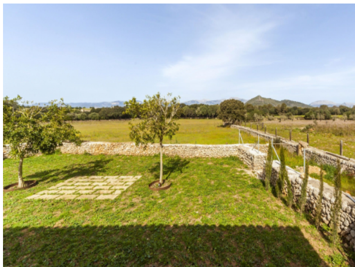
Sweeping views from the plot