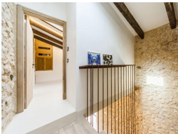
Corridor on the upper floor