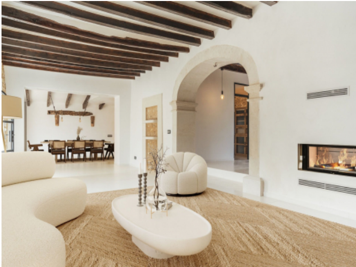
Light flooded living area