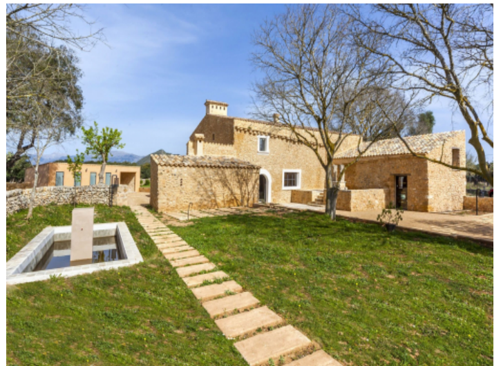
Property with extensive outdoor area