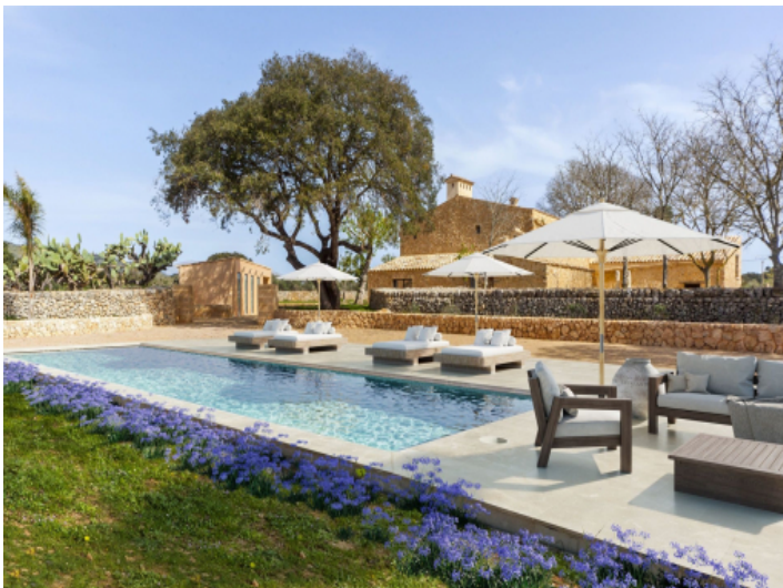
Wonderful outdoor area with pool