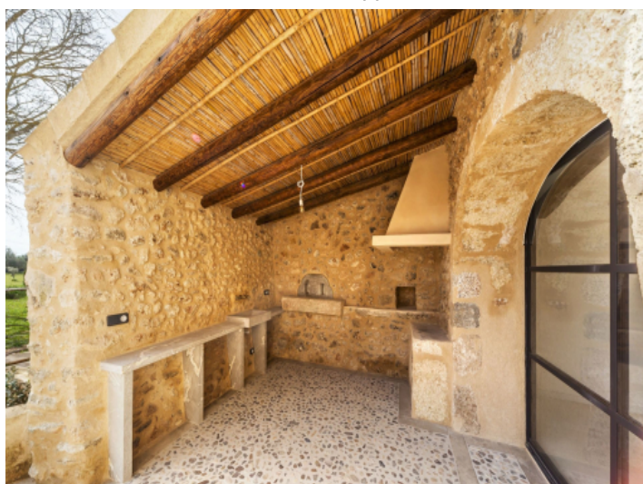
Fantastic bbq area