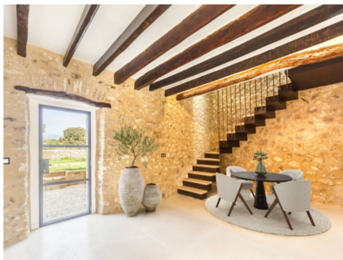
Room with natural stone wall and access from the outside