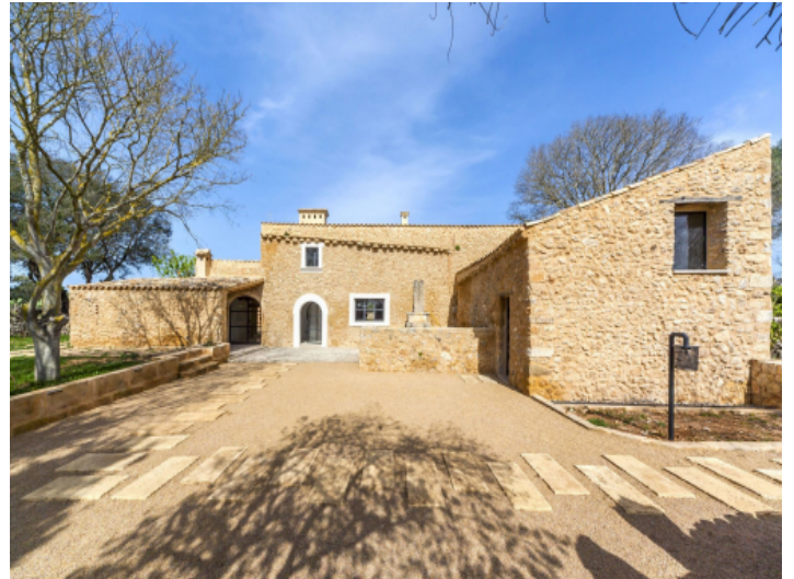
Front view and entrance to the finca