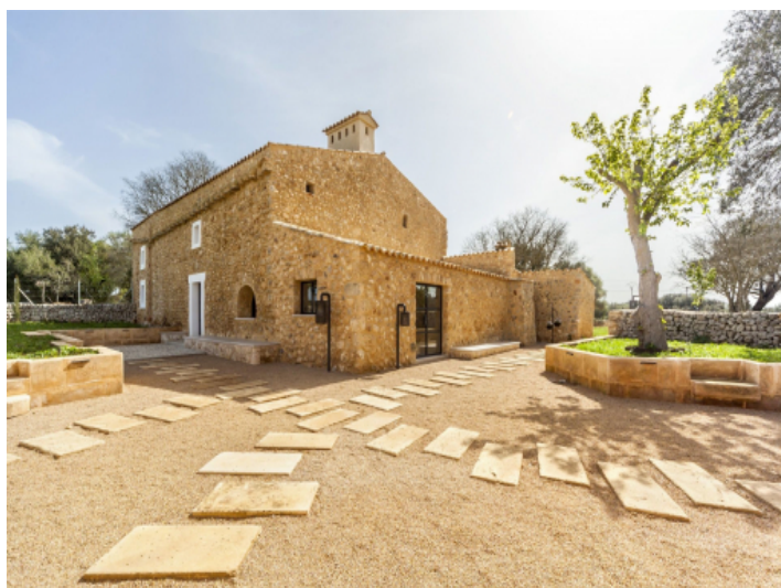
Exterior view of the finca