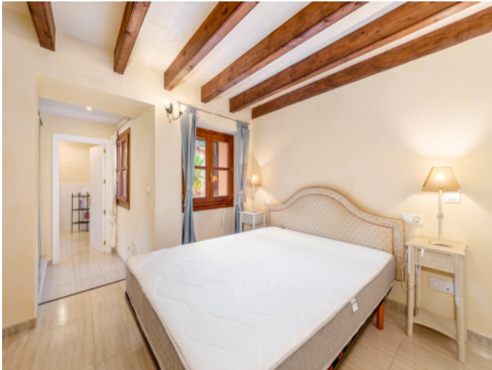
Double bedroom with en suite bathroom