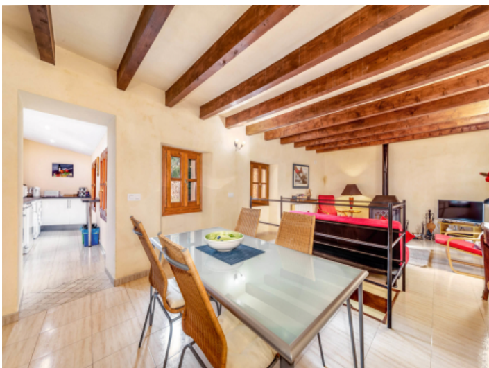
Open dining area with kitchen access