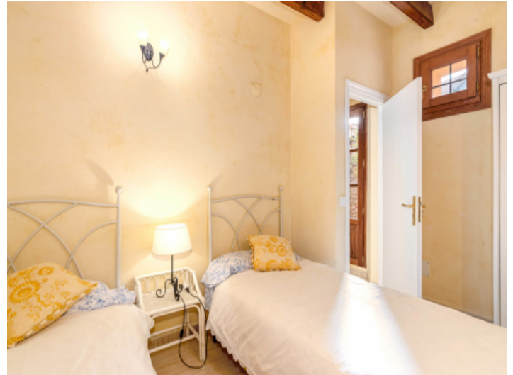
Second double bedroom