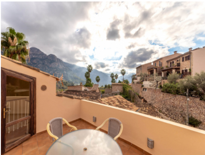
Terrace with seating area