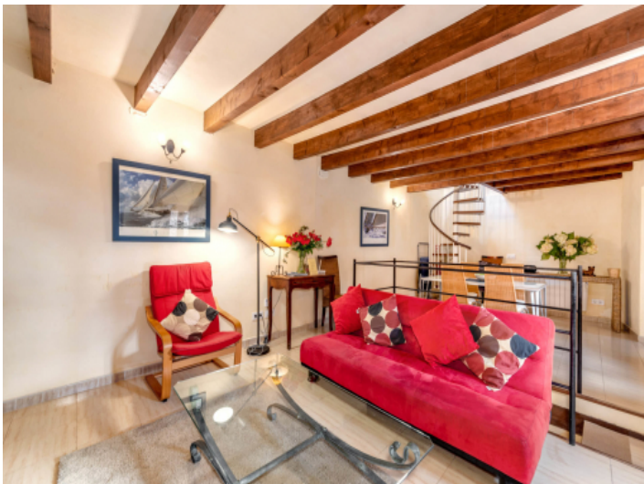
Beautiful living area on the upper level