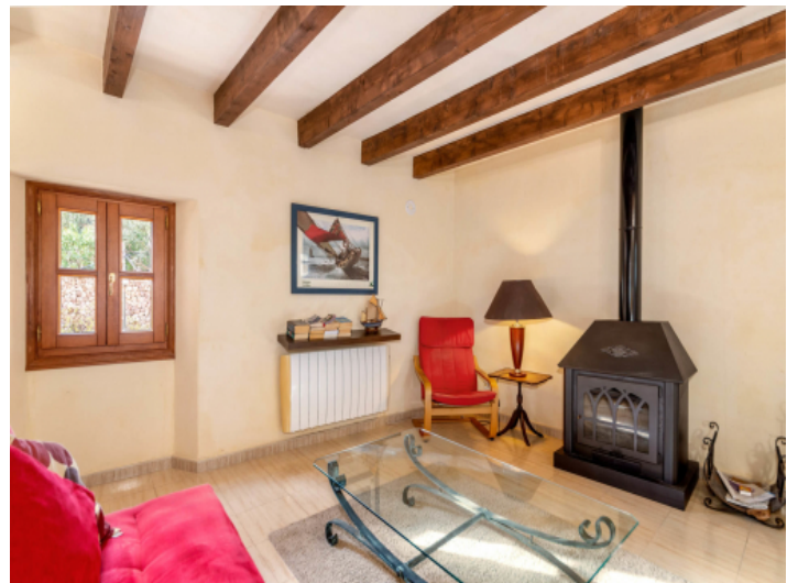
Cosy fireplace corner