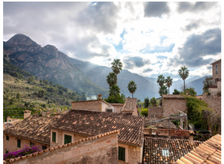
Wonderful Tramuntana views