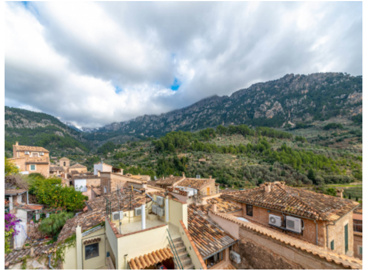
Sweeping views over the mountains