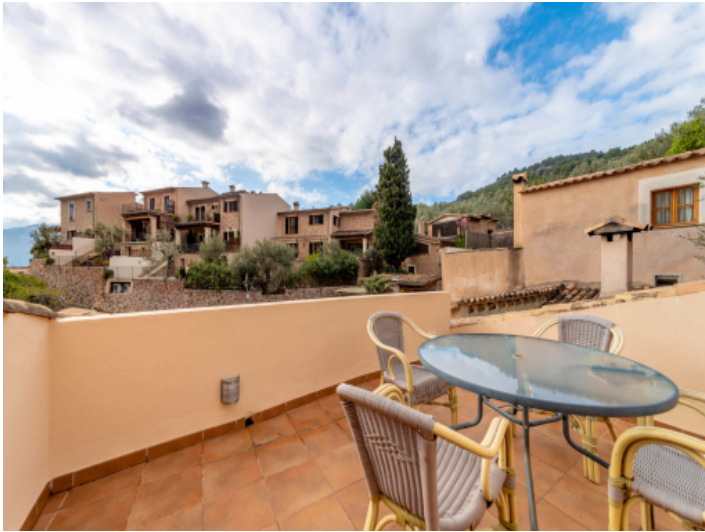
Terrace with wonderful views over the town