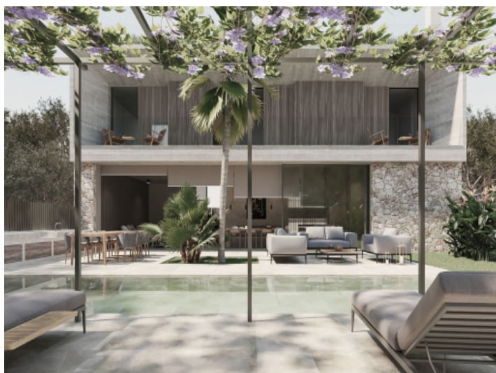
Outdoor area and pool