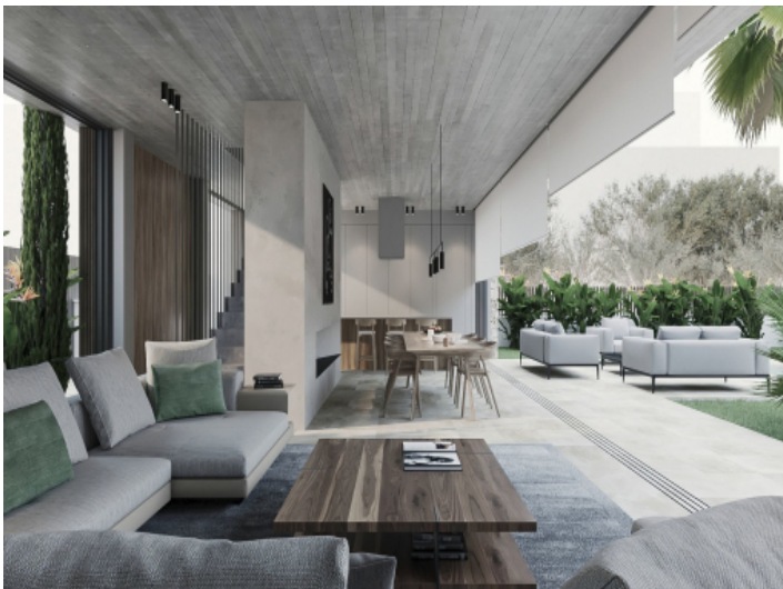
Living area and terrace