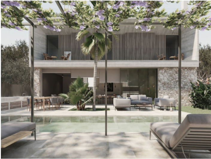
Outdoor area and pool