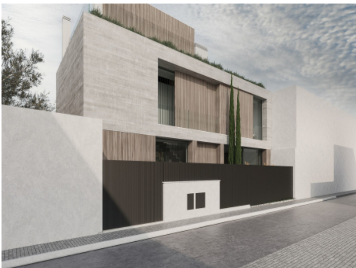
View from the street