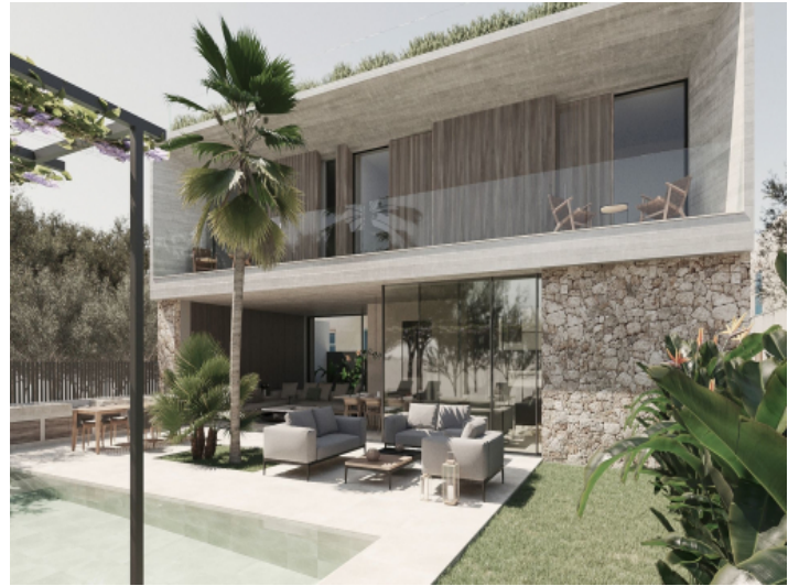
Outdoor area and pool