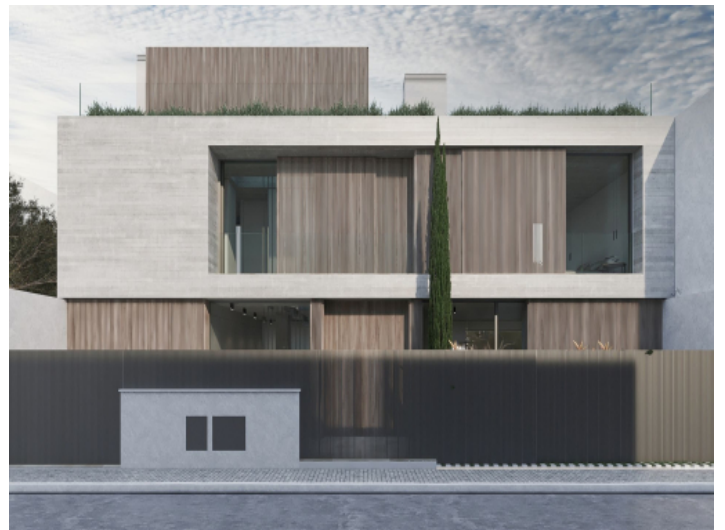
View from the street