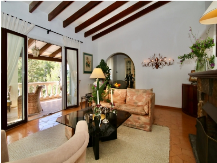
Bright living area with wooden beams