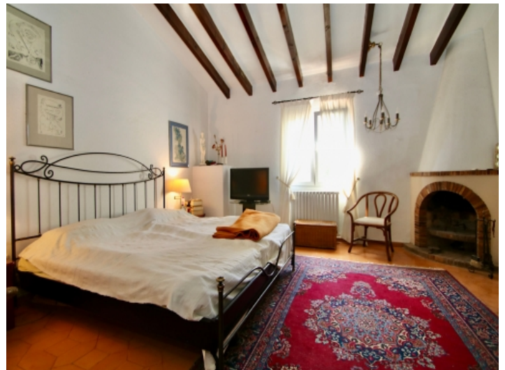
Master bedroom with bathroom en suite