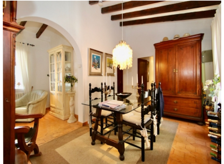
Inviting dining area