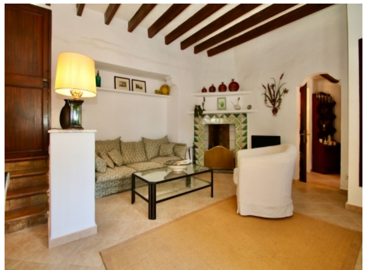
Spacious guest apartment