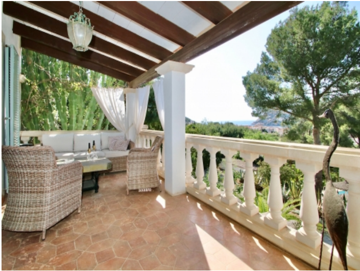
Covered balcony with sitting area