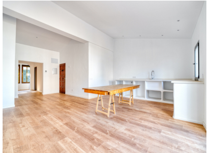
Living and dining area on the upper floor