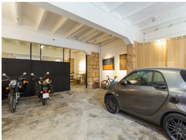
Alternative view of the garage