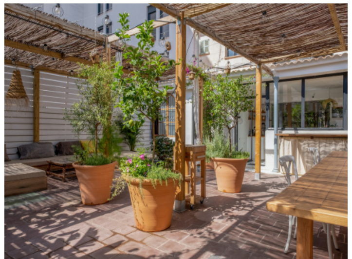
Green terrace with dining area