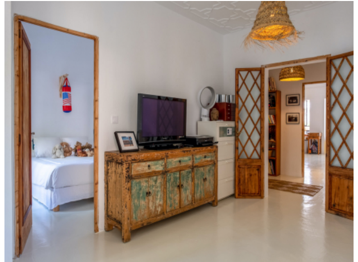
View to the bedroom