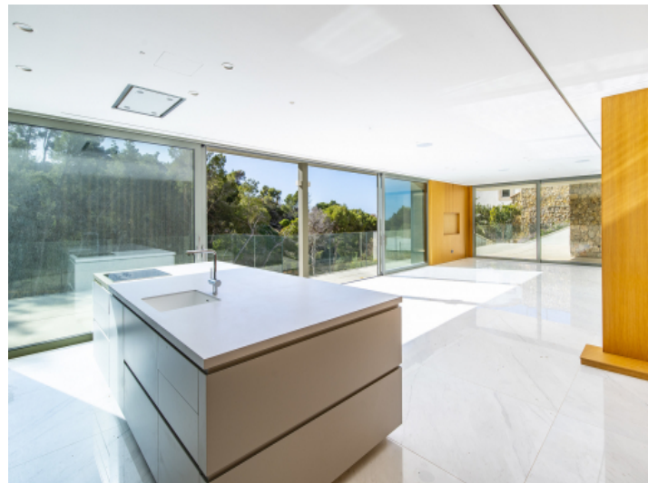
Open living and kitchen area