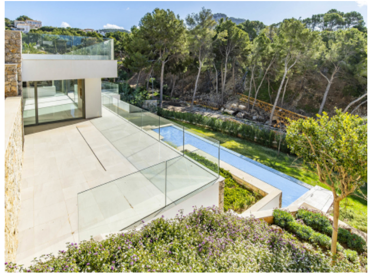
Upper terrace and pool