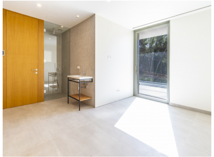
Bedroom and bathroom