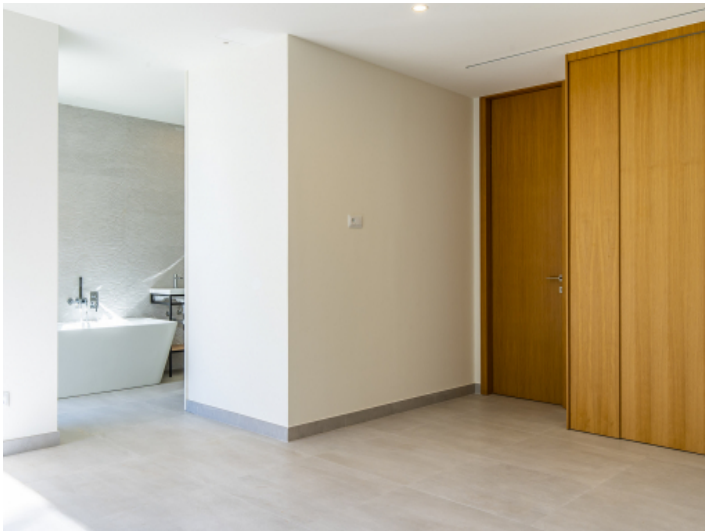
Bedroom and bathroom