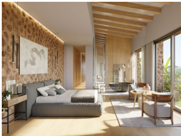
Elegant double bedroom