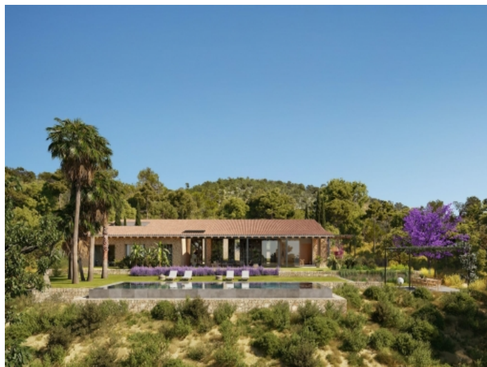
Spacious garden and pool area