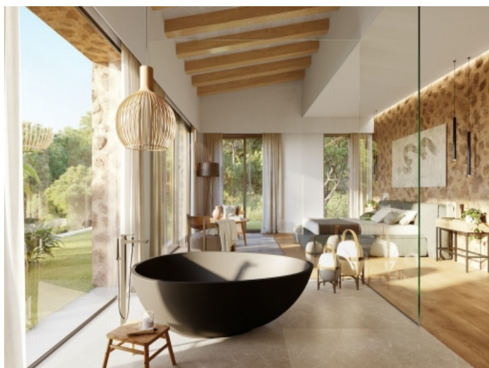
Stylisch bathroom with a view