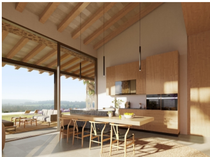
Modern kitchen with cooking island and dining area