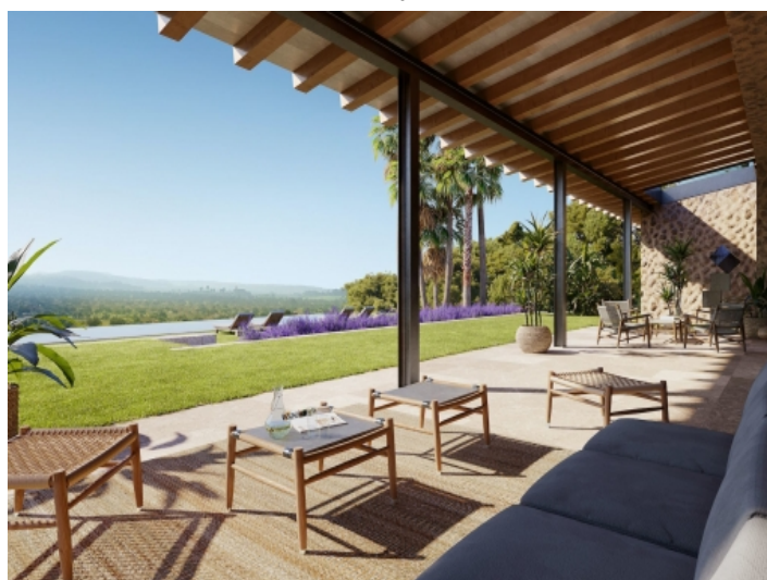
Covered terrace and garden