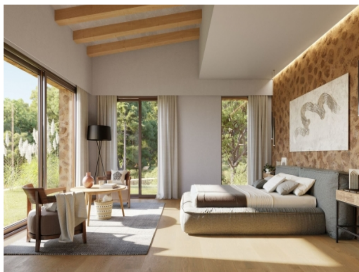
Another cozy bedroom