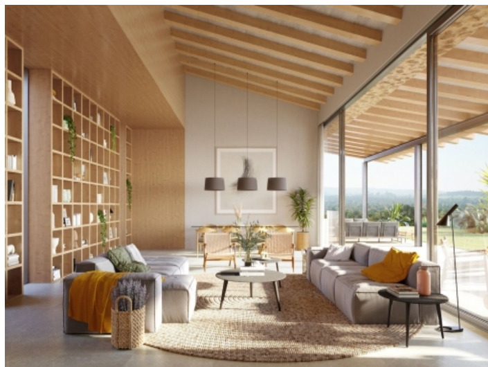
Open living area