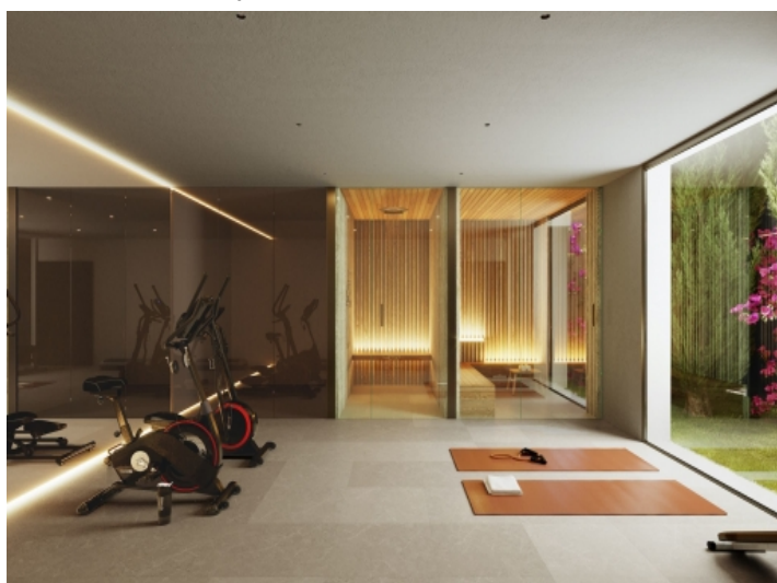
Inviting spa and fitness area