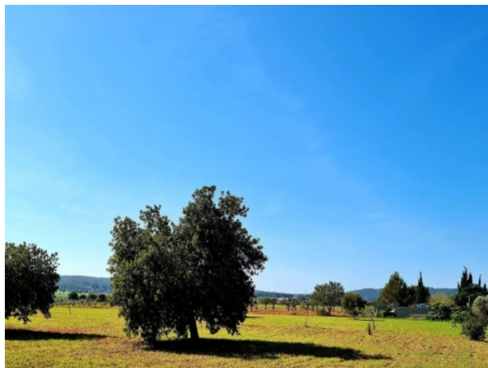
View of the property