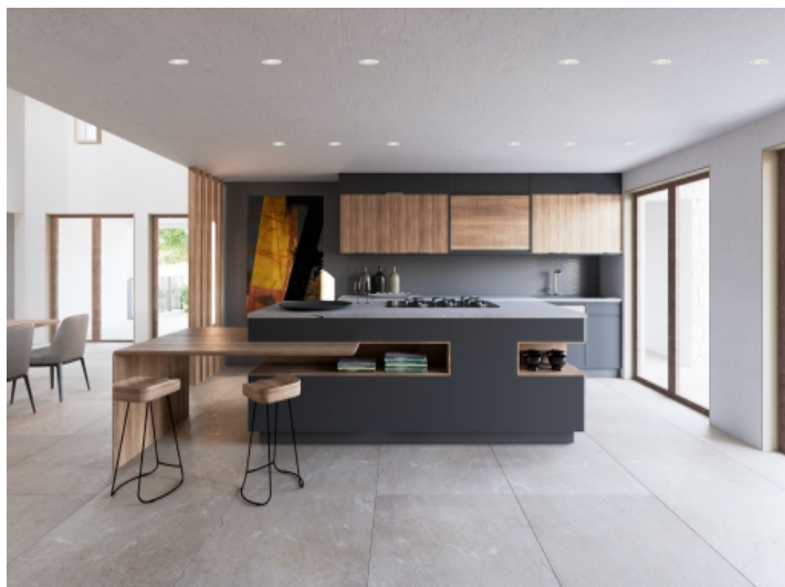
Alternative view of the kitchen