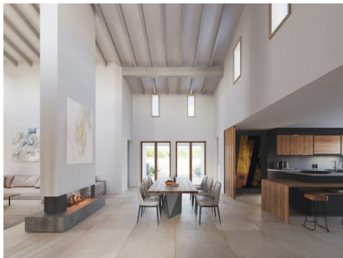
Stylish design with high ceilings