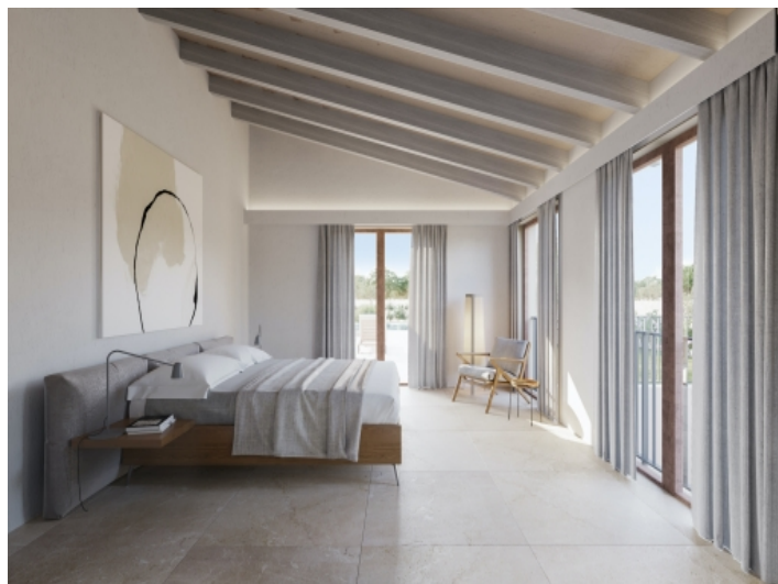
Light flooded bedroom