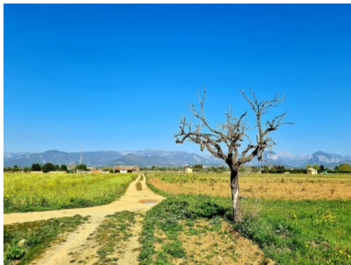
View of the property