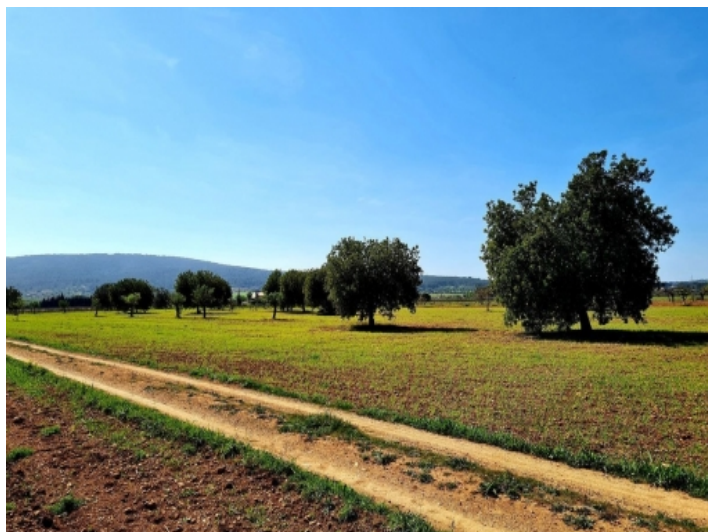
View of the property