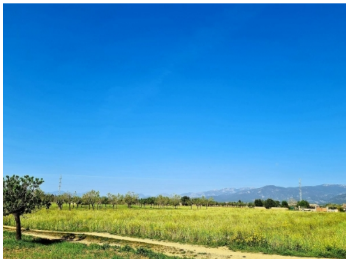
View of the property