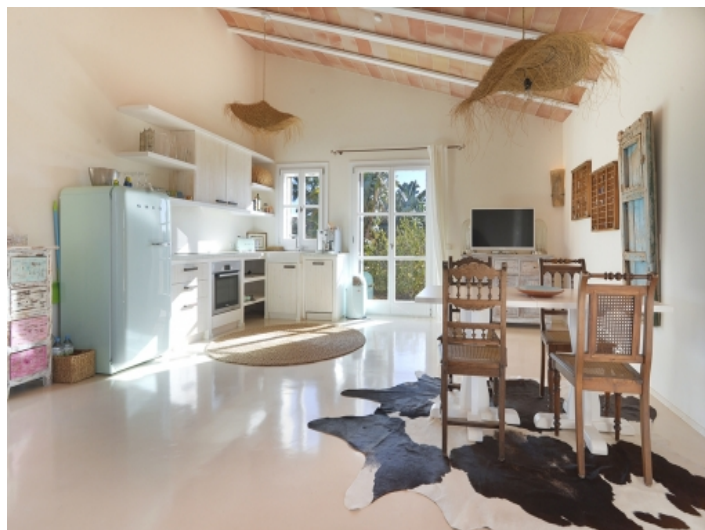
Open kitchen and dining area