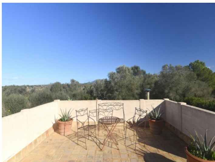
Splendid roof top terrace