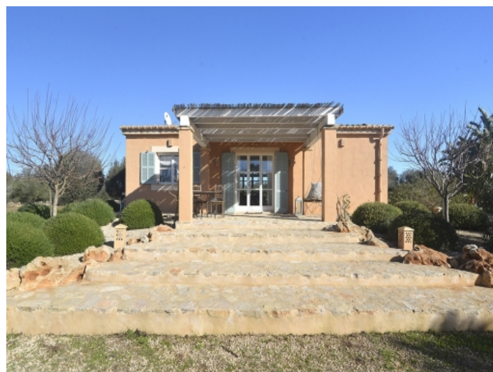
View of the guest house