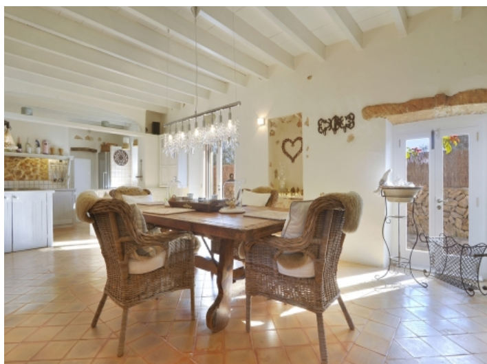
Dining area by the kitchen