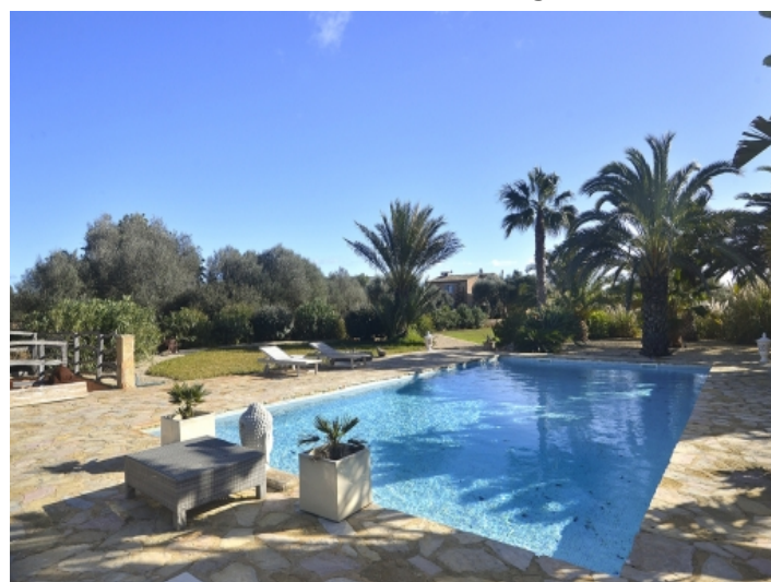
Sunny pool area