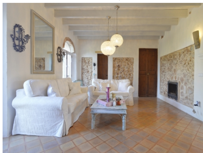
Alternative view of the living area