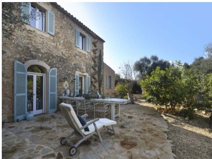
View of the terrace