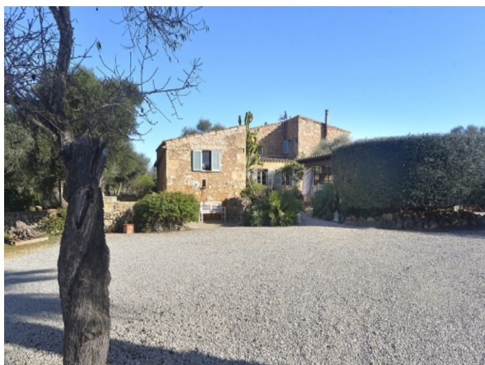
Entrance area and access to the house