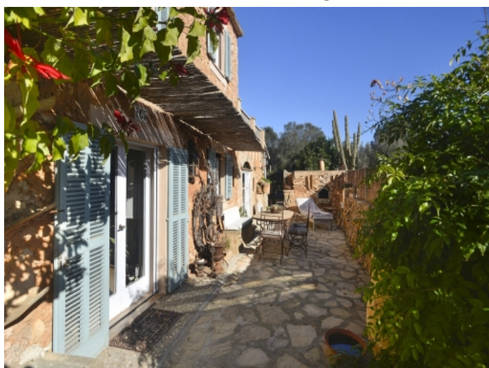
Small side terrace