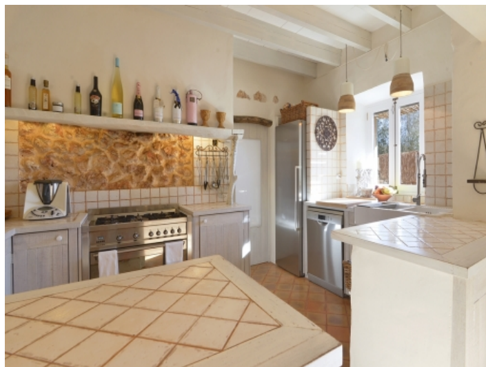
Cooking island of the kitchen