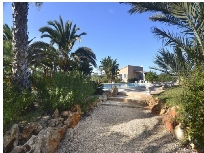
Access to the pool