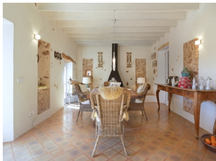
Alternative view of the dining area