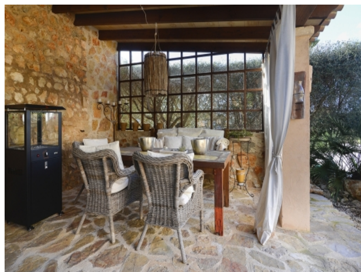
Alternative view of this dining area