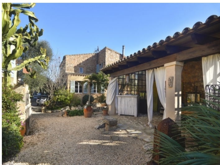
Covered terrace and dining area