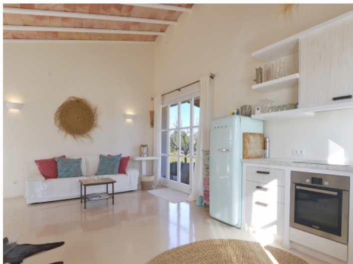
Living area of the guest house