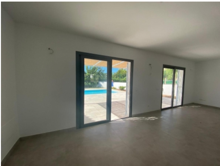
Light flooded living area