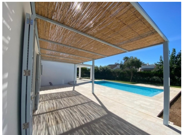
Covered terrace of the villa