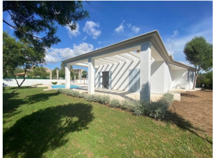
Exterior view and garden