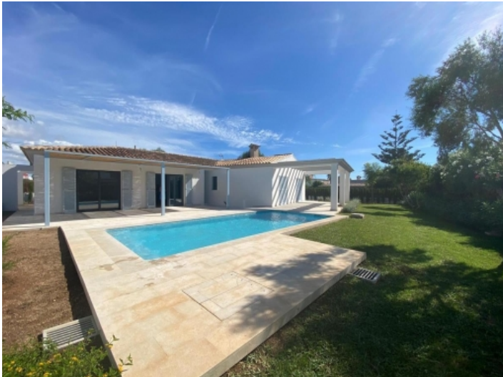
Exterior view of the villa