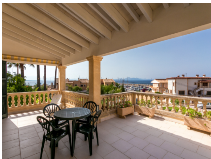
Large, covered terrace with sea views