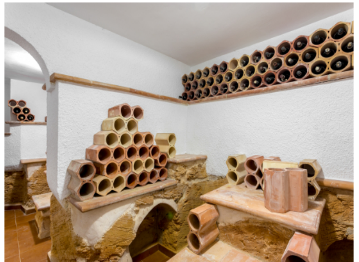
Own wine cellar