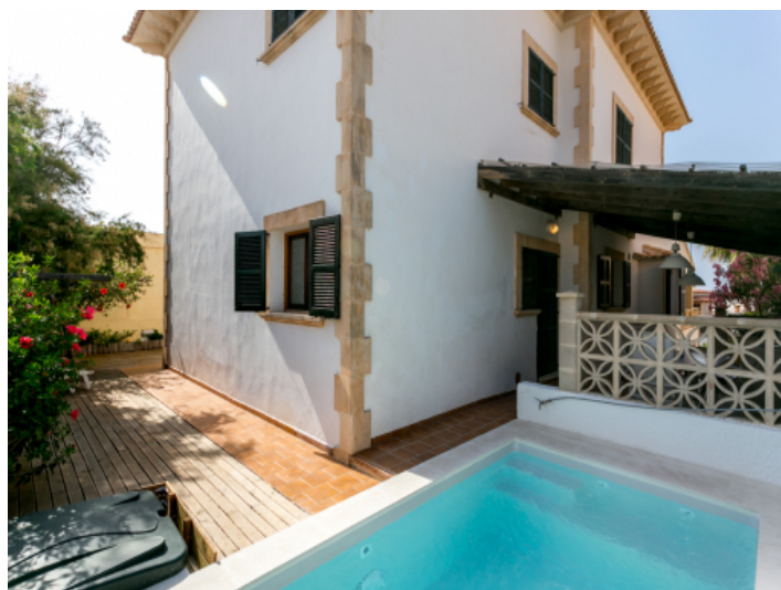
Terrace with small pool