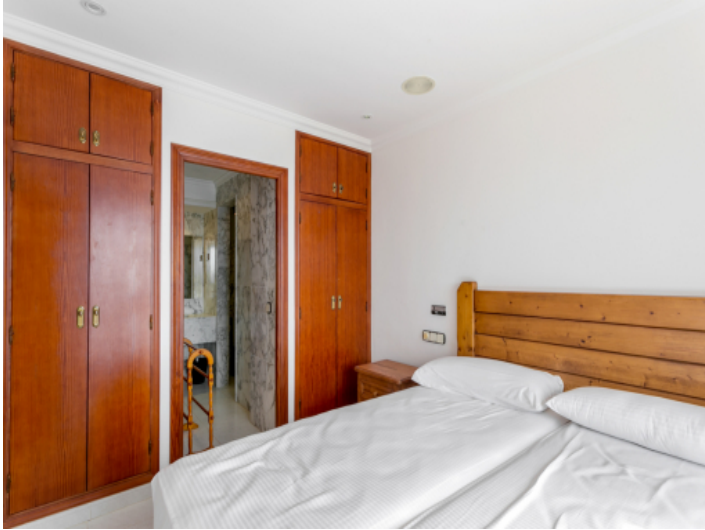
Further bedroom with built-in wardrobes