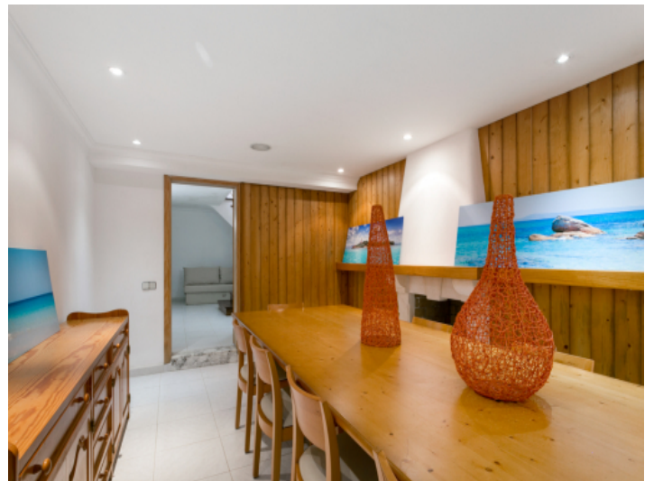
Large dining area in the basement