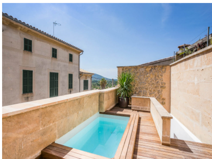
Terrace with lovely pool