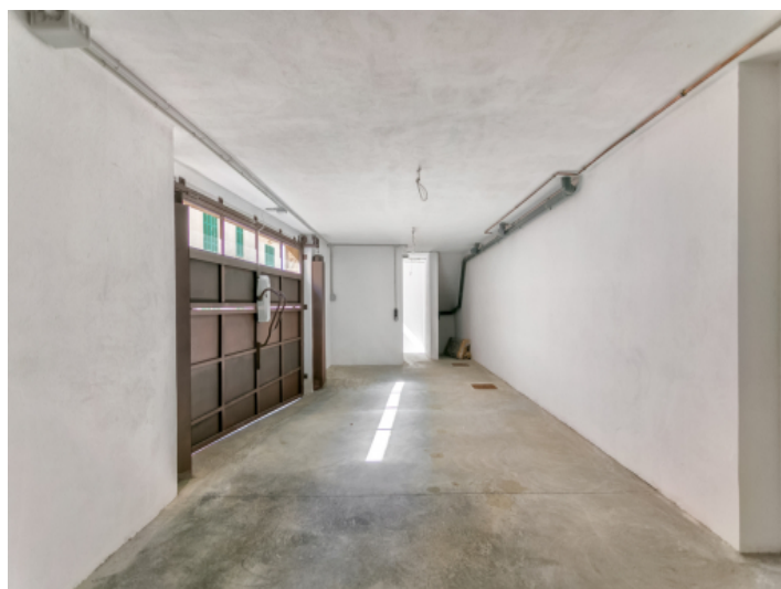
Garage with electric gate