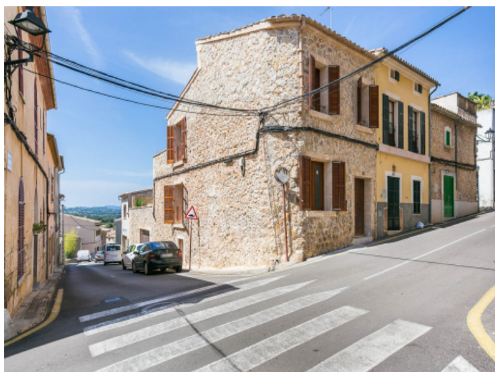
Corner house with rustic stone facade