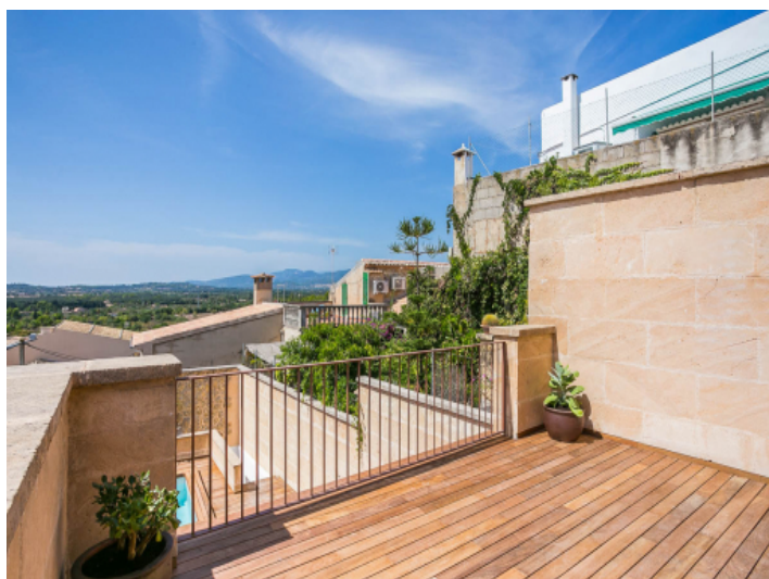
Private terrace with panoramic views