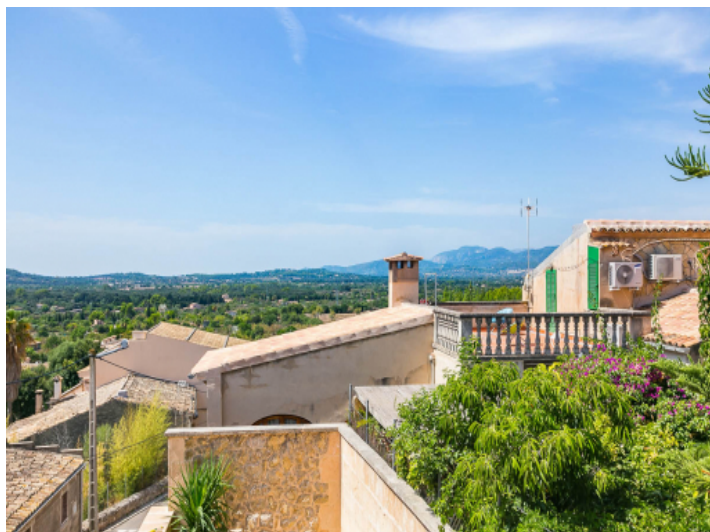
Marvellous mountain views