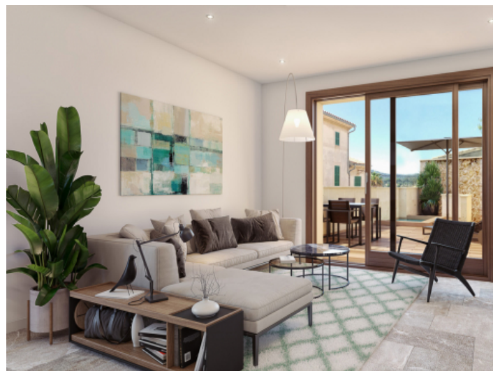
Bright living area with access to the terrace