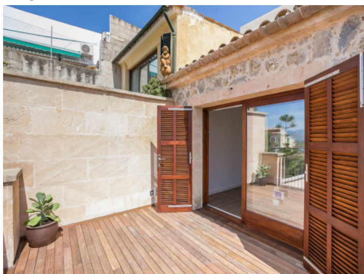
Charming access to the terrace