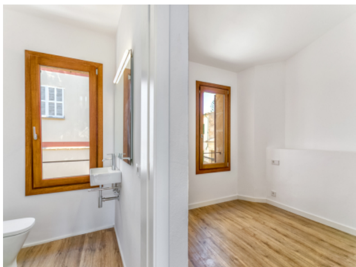
Lovely bedroom with bathroom en suite