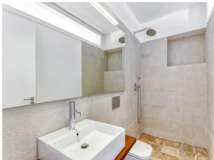
Modern and new bathroom with shower