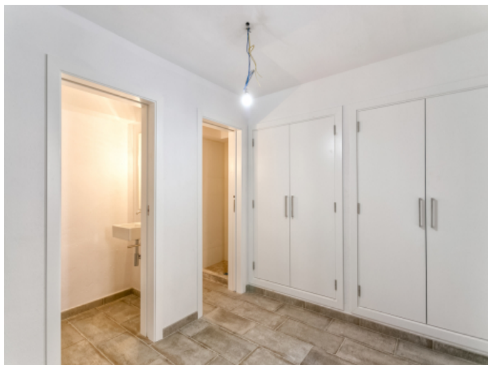
Large bedroom with built-in wardrobe and bathroom en suite