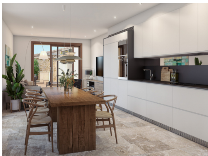
Dining area and open kitchen