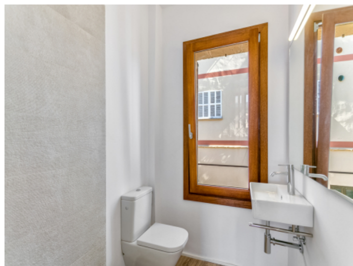
Small bathroom en suite