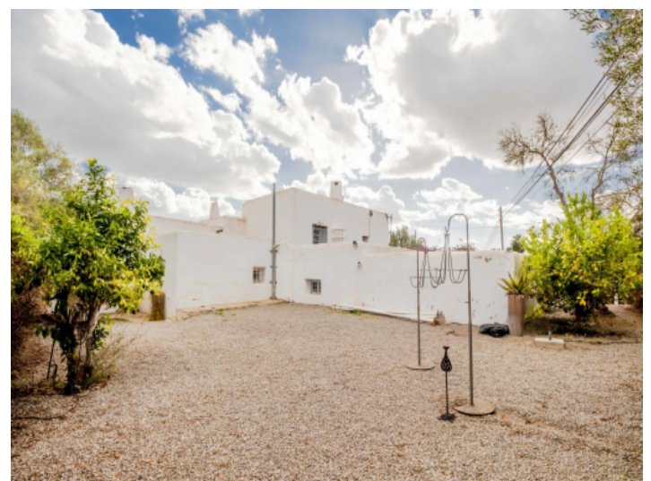
Private parking space