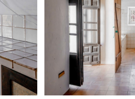
Kitchen on the first floor