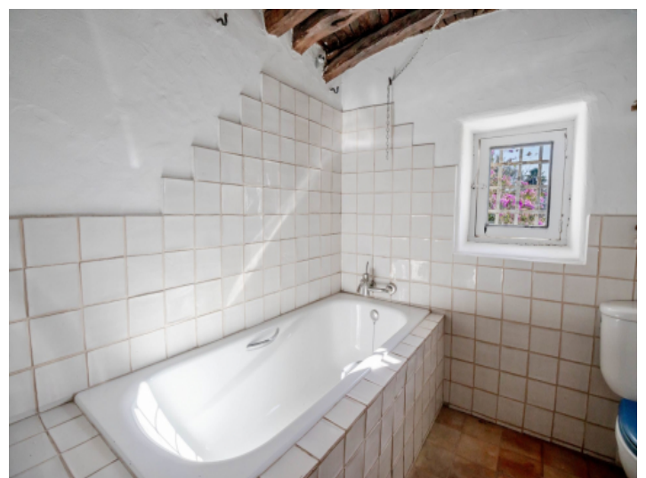
Bathroom on the first floor