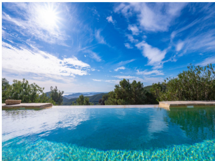
A very special place