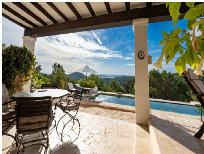
A little gem