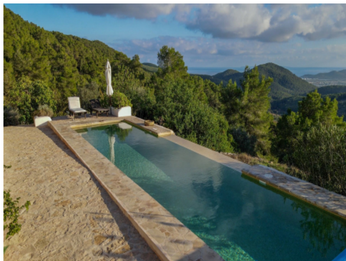
Infinity pool with amazing views