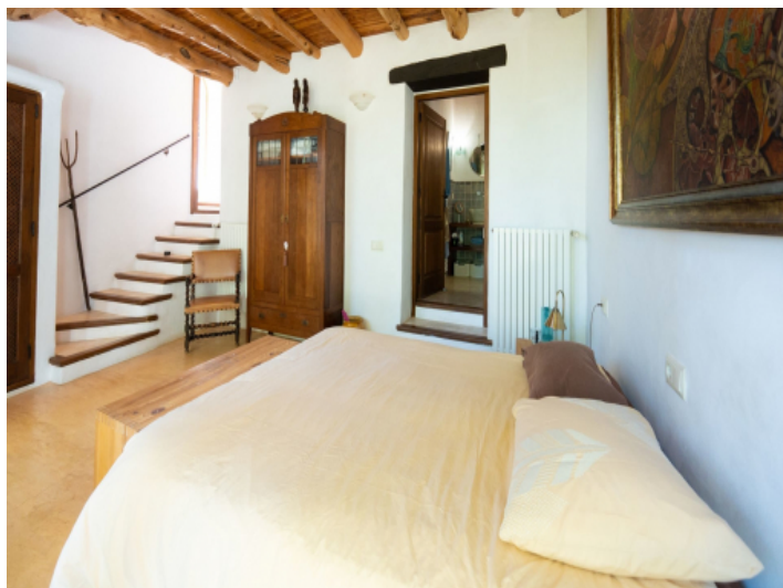
A total of 3 bedrooms