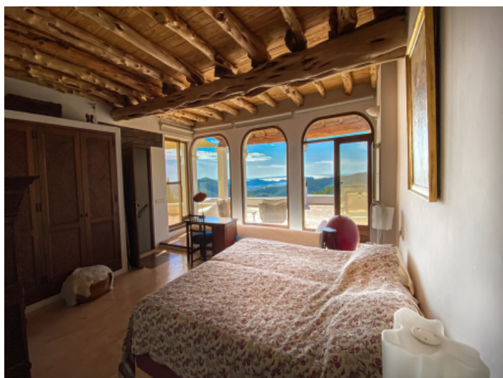
Wake up with stunning views