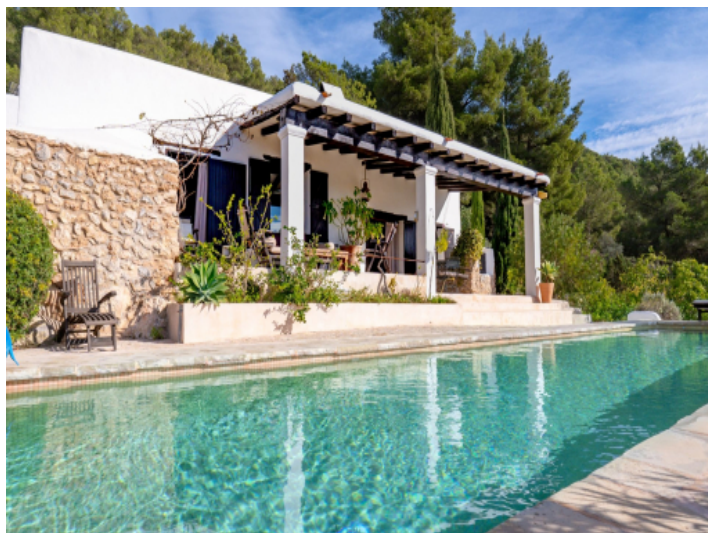
A lot of joy