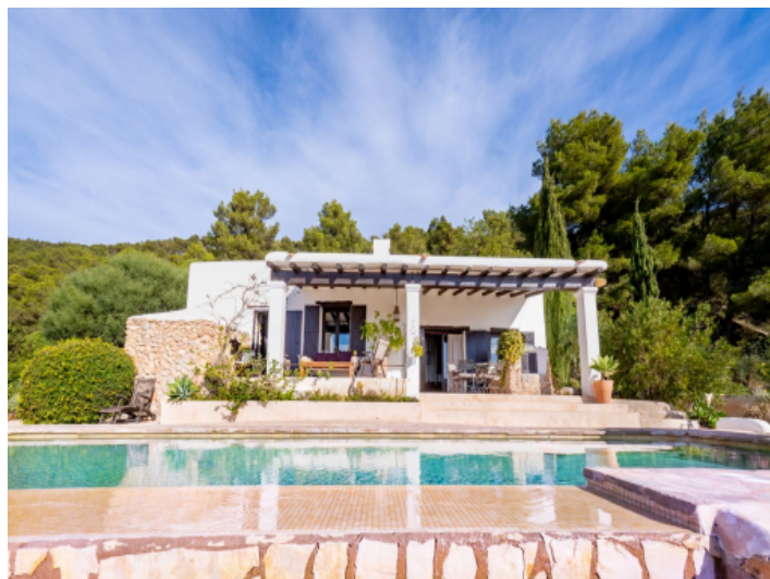
To fall in love