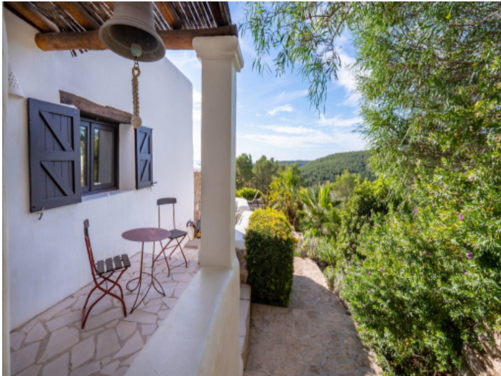
A relaxing place to be comfortable