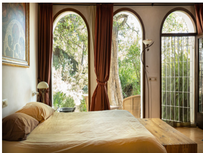
Twinkle twinkle little star