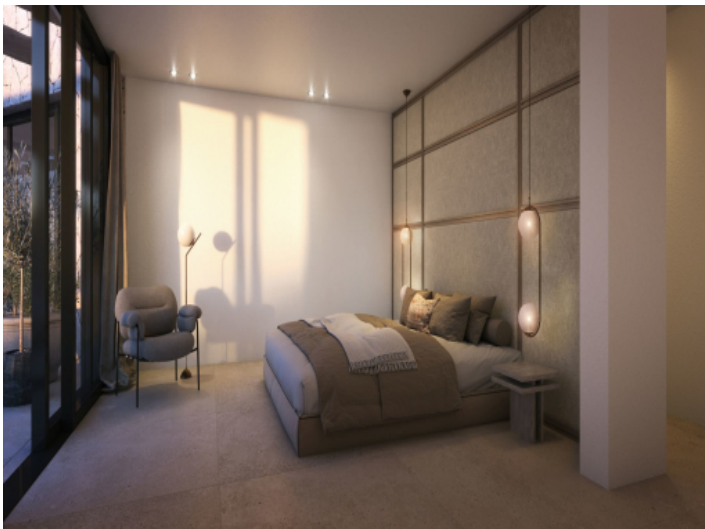
One of 4 bedrooms