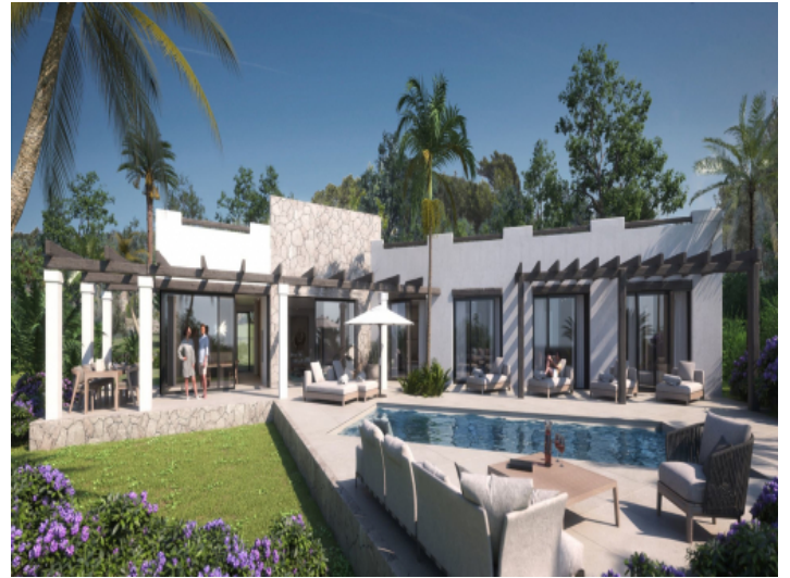
View to the property