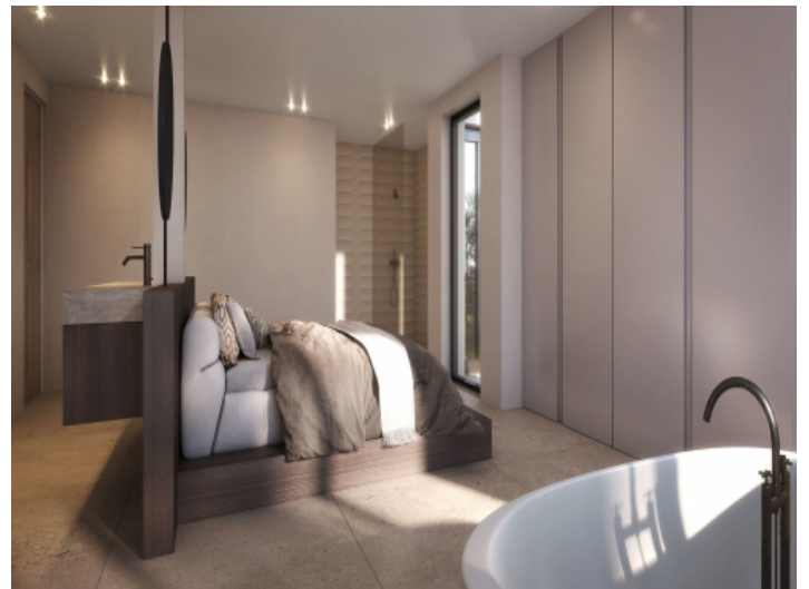
One of several bathrooms