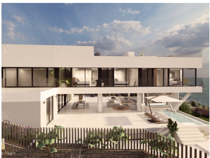
High quality construccion