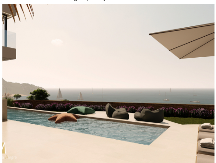
Stunning pool area