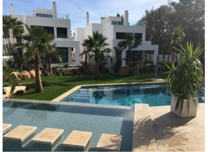
Large community pool