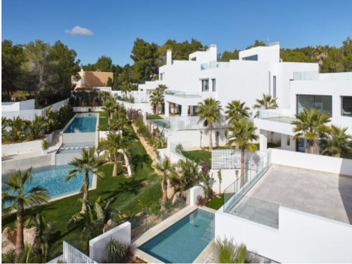
Exterior view of the villas