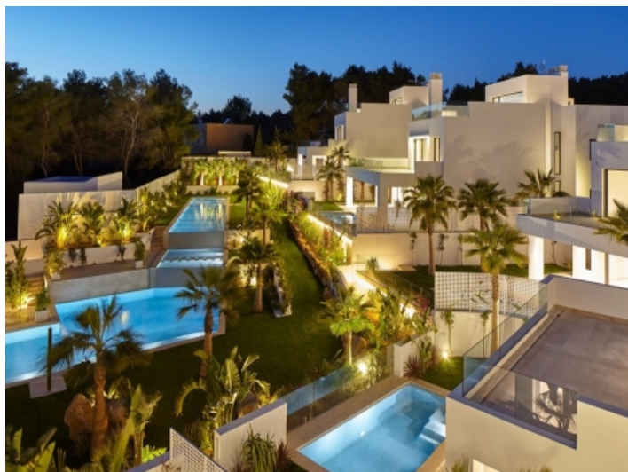
Villa by night