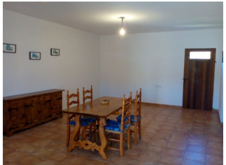
Separate dining area