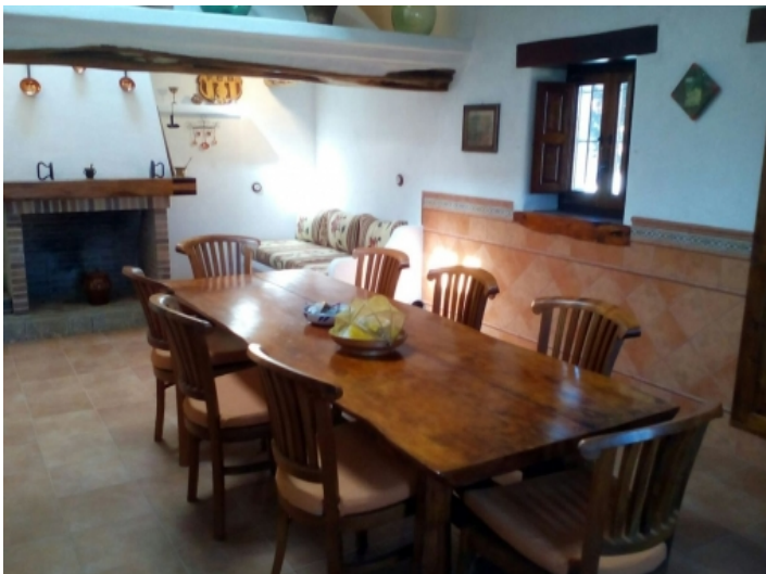
Spacious dining area