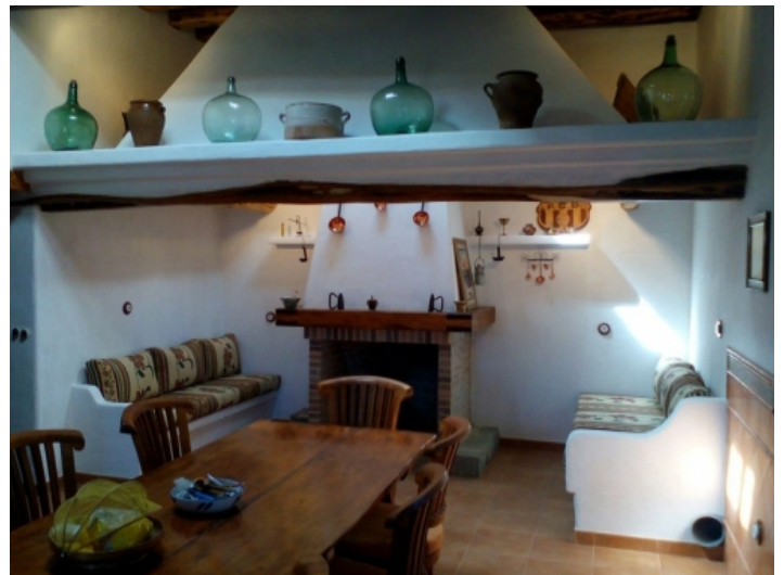
Living and dining area with fire place