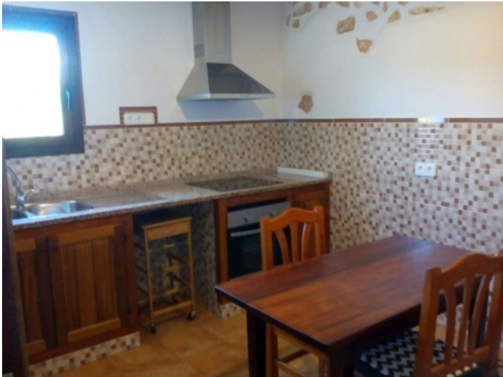
View of the rustic kitchen