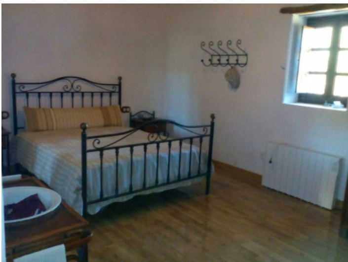
Cozy double bedroom