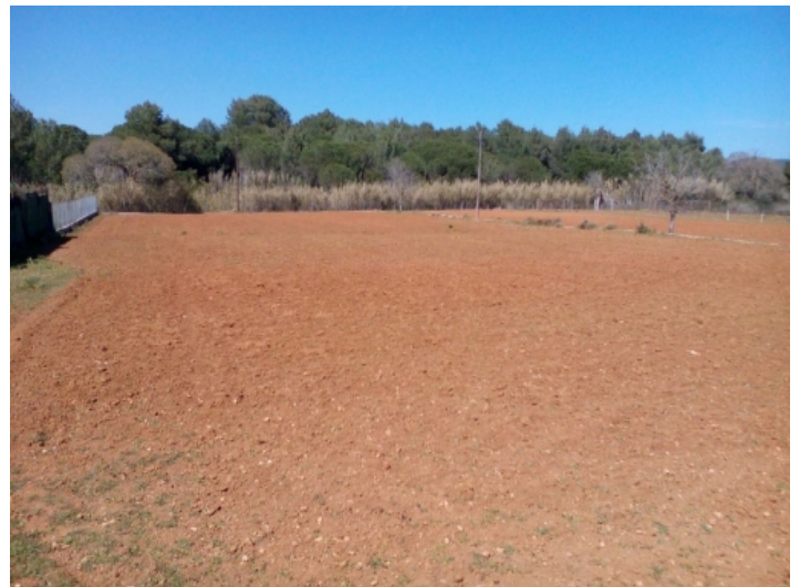
Alternative landscape view